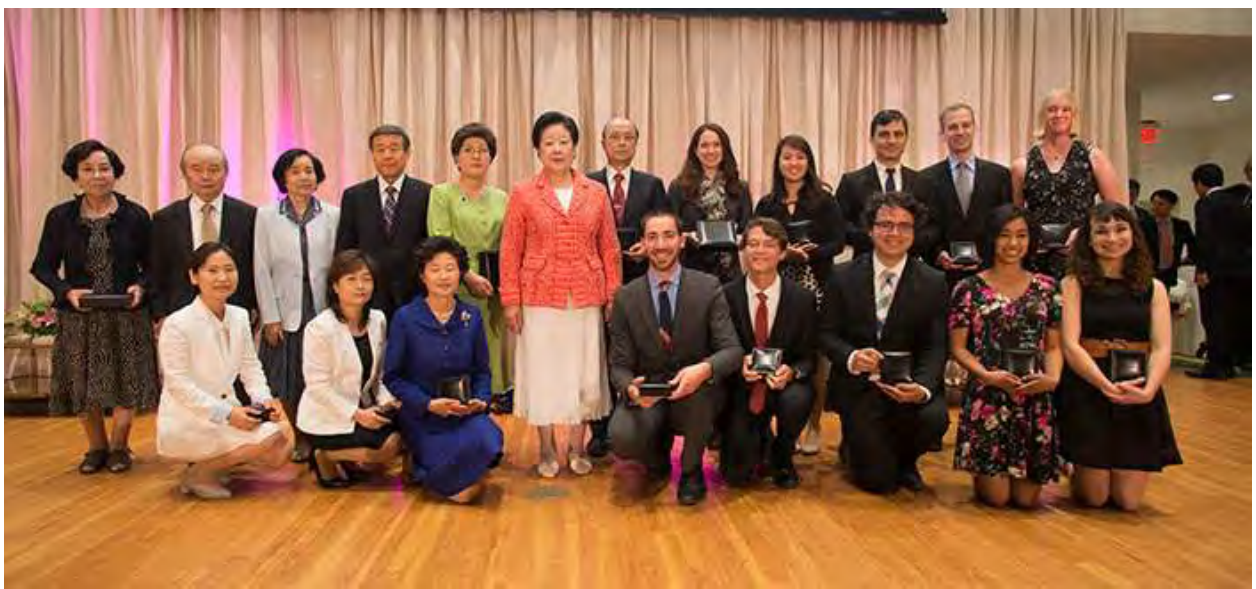
True Mother awards American Unificationists for their service

The event started out with an introduction video, describing the process of building the IPEC and thanking those who donated. A musical group of young Unificationists from Albuquerque, New Mexico, the 5-0-5s, performed the songs "Elias" and "Stand By Me."