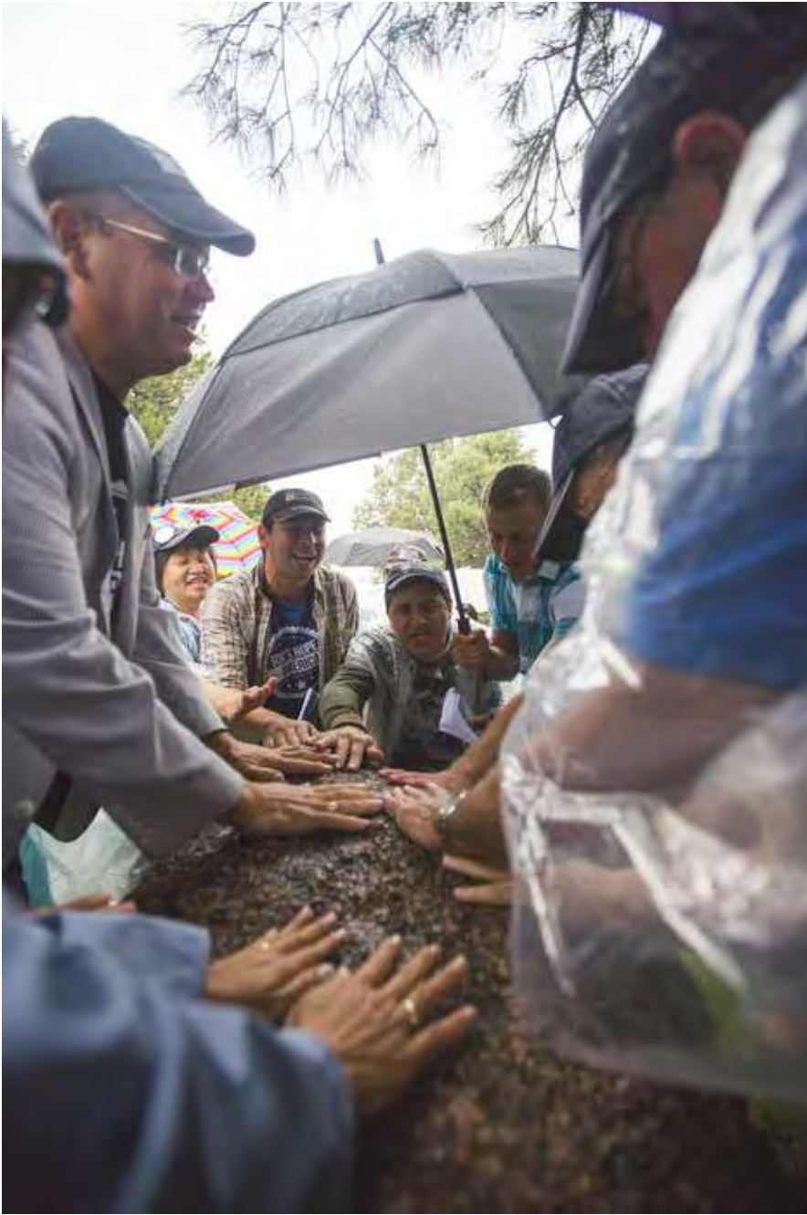
As we sang, we all moved into the circle and touched the rock that stood at the Holy Ground in Cheyenne