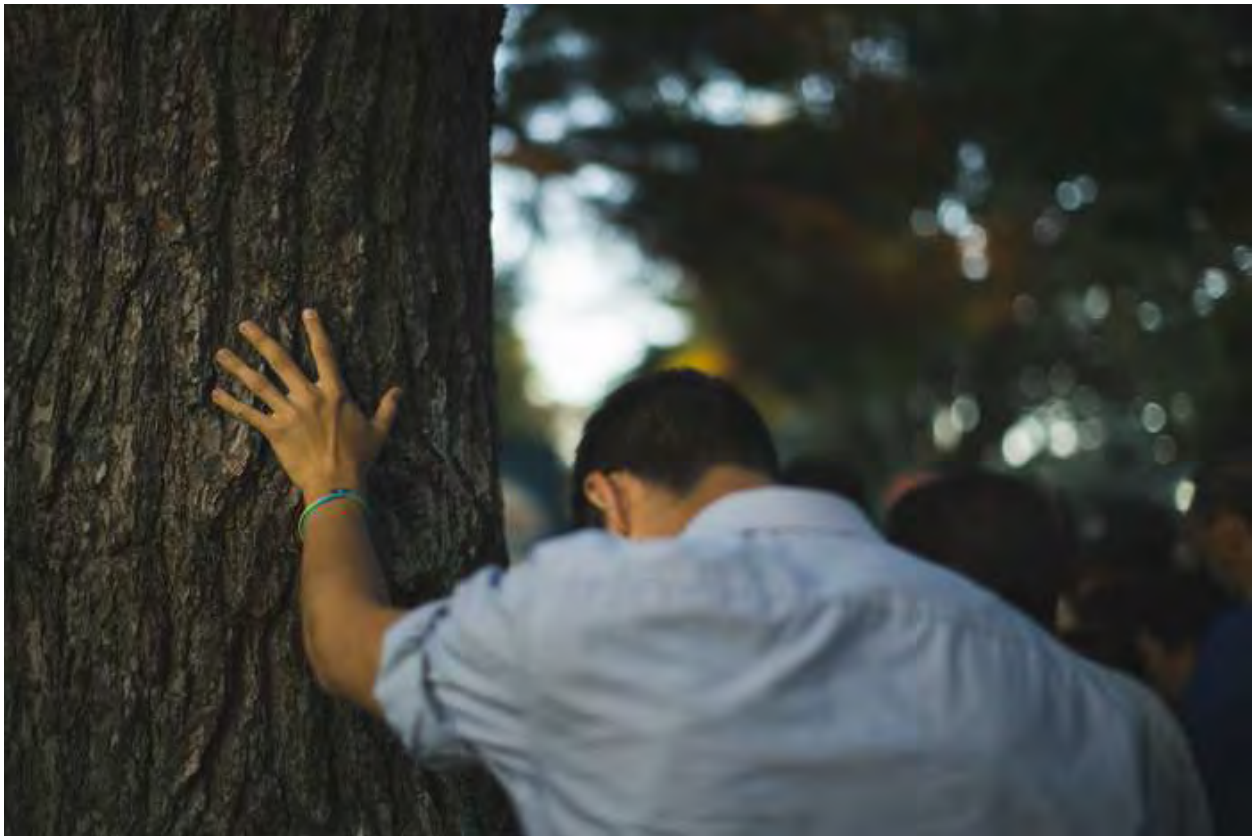
We prayed between four pine trees at the new Nebraska Holy Ground in Omaha's Memorial Park