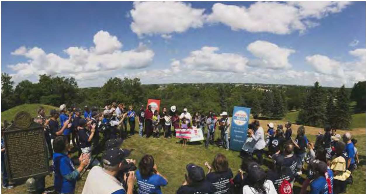
As True Father always chose the highest places for Holy Grounds, we gathered atop a hill overlooking the land in Sioux Falls

On July 28 we met in Sioux Falls, South Dakota at Sherman Park atop a hill, at the site of a Native American burial ground that is 1600 years old. We could feel the vast history of that spot, the heaviness of the Native American struggle yet the lightness of their simple and pure connection with nature, as we overlooked the immense plains of South Dakota. A Native American gift was offered to Father and Mother Moon by the local community—a handmade dream catcher.