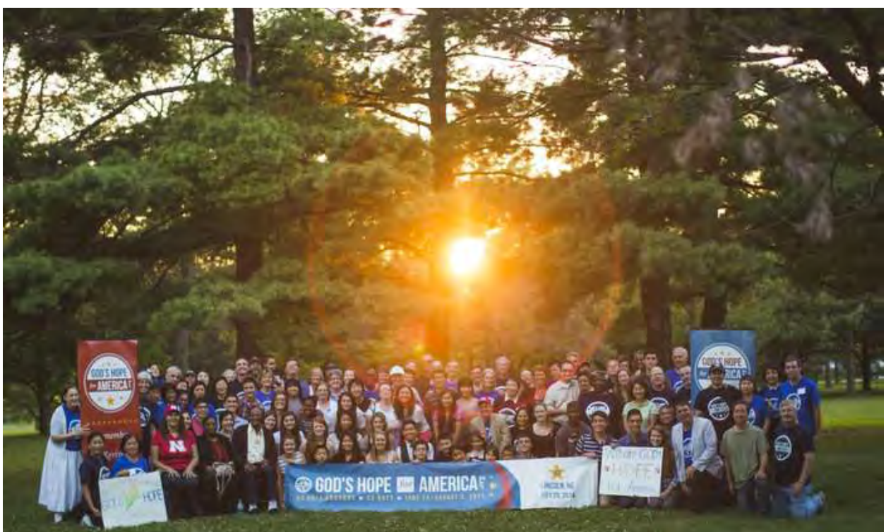
Several families greeted us at sunset in Omaha