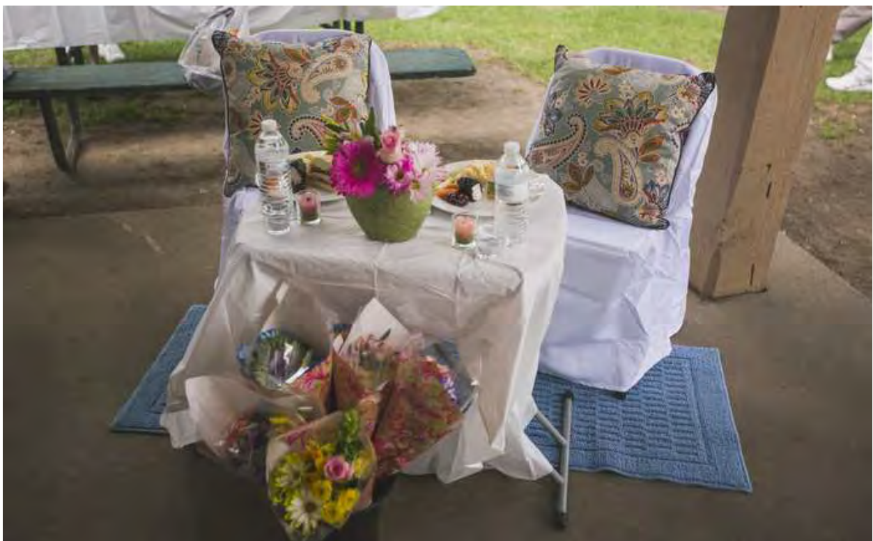
The community in Sioux Falls, South Dakota prepared seats for True Parents at our lunch picnic, and we felt their presence with us