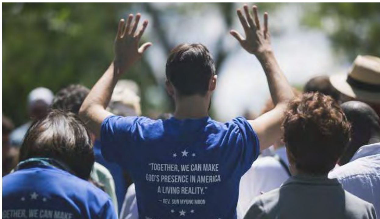
Praising God in St. Paul