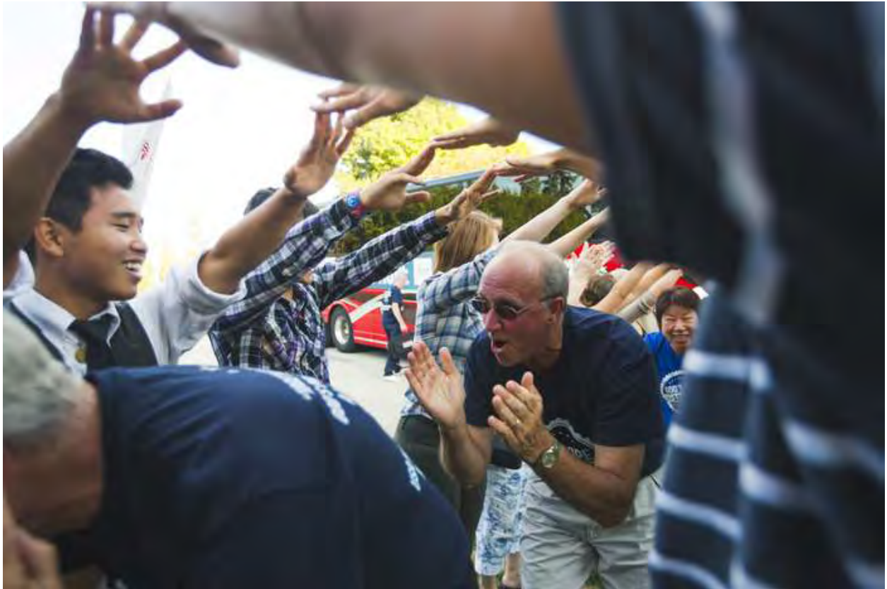
Omaha welcomes the bus with a human train

In Omaha, our last stop of the day, the sun began to set in the beautiful and peacefully empty Memorial Park. This is not the original Holy Ground that Father Moon established in Nebraska, because a zoo was since built there in Lincoln, but our gathering beneath four huge pine trees with the flickers of the orange sun was among our most beautiful so far.