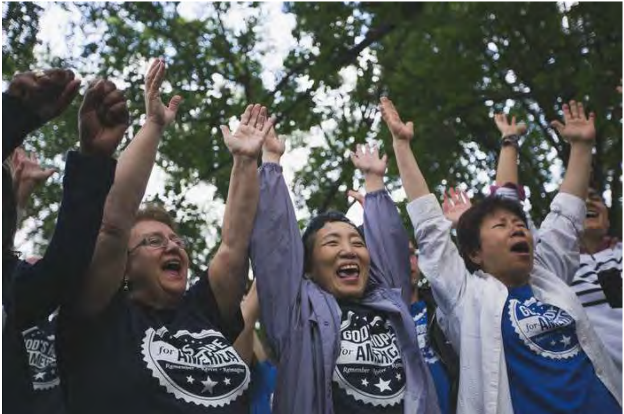
The Fargo community and bus travelers join together in cheers for the victory of God's Hope for America