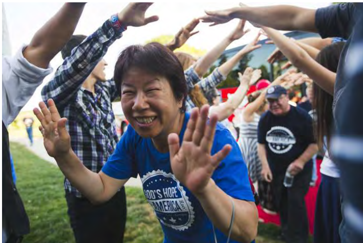
The bus is welcomed by a human train in Omaha