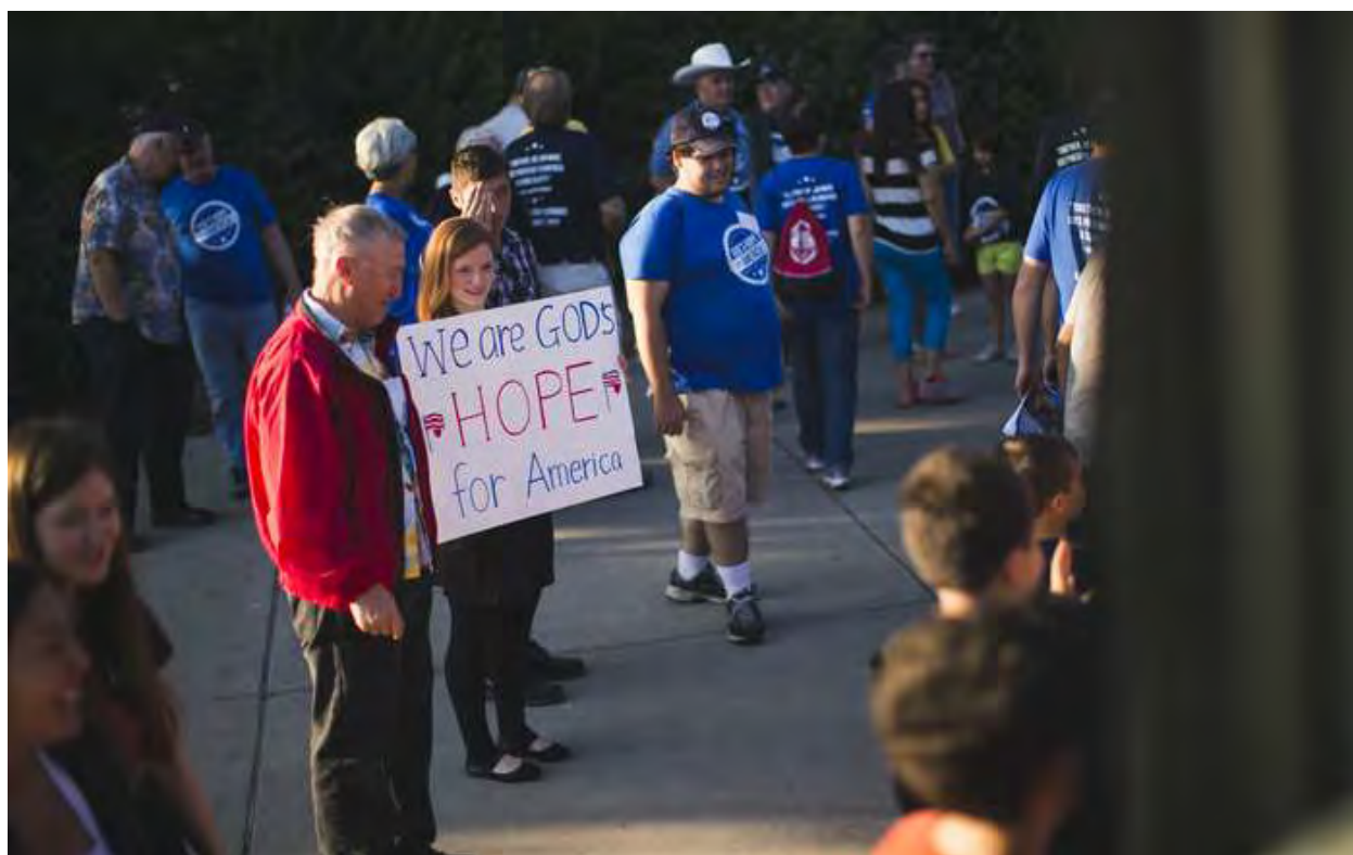
Nebraskans greeted us for a second time in Lincoln, where we got as close as possible to the original Holy Ground, now located in a zoo

On July 29, we got as close as we could to the original Nebraska Holy Ground. We had a short ceremony of song and prayer outside the zoo first thing in the morning, and then continued on to the next state.