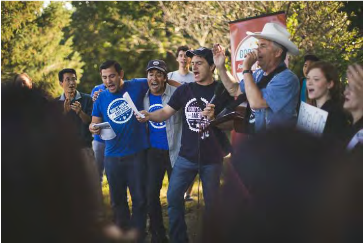
We greeted the day with high spirits and song in Lincoln, Nebraska