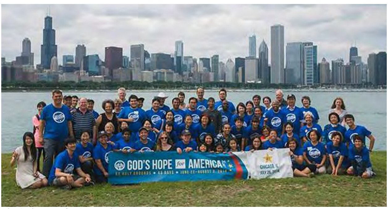
The God's Hope for America bus arrived in Chicago on July 25

On July 25, the God's Hope for America bus arrived in Chicago, ready for a special cycling rally, "Peace Bike 2014," hoping for the re-unification of the Fatherland Korea. Sixty Unificationists, young and old, gathered in downtown Chicago near the Chicago Holy Ground. They held a banner and put flags on their bicycles, starting their ride from the busy Michigan Avenue and along a beautiful bike trail southward along Lake Shore Trail. Though it was just a one-hour rally, a lot of passion and high energy was felt among participants and spectators alike.