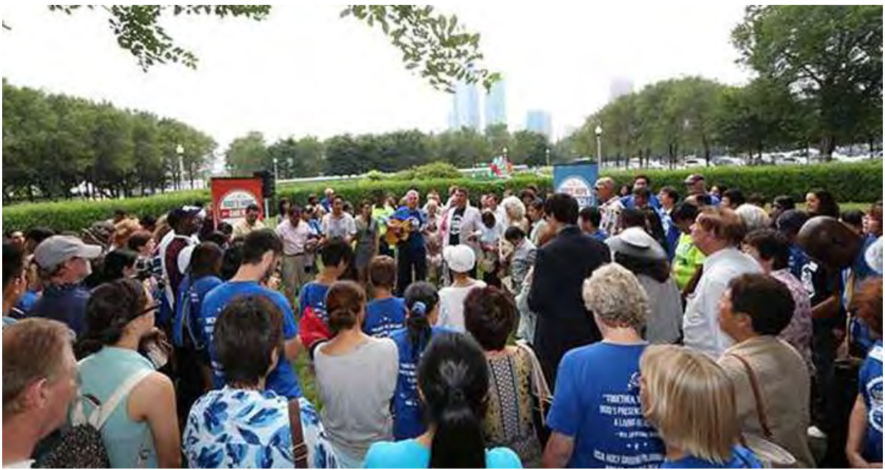
The Holy Ground is located in Grant Park South, downtown Chicago

On July 25, the God's Hope for America bus arrived in Chicago, ready for a special cycling rally, "Peace Bike 2014," hoping for the re-unification of the Fatherland Korea. Sixty Unificationists, young and old, gathered in downtown Chicago near the Chicago Holy Ground. They held a banner and put flags on their bicycles, starting their ride from the busy Michigan Avenue and along a beautiful bike trail southward along Lake Shore Trail. Though it was just a one-hour rally, a lot of passion and high energy was felt among participants and spectators alike.