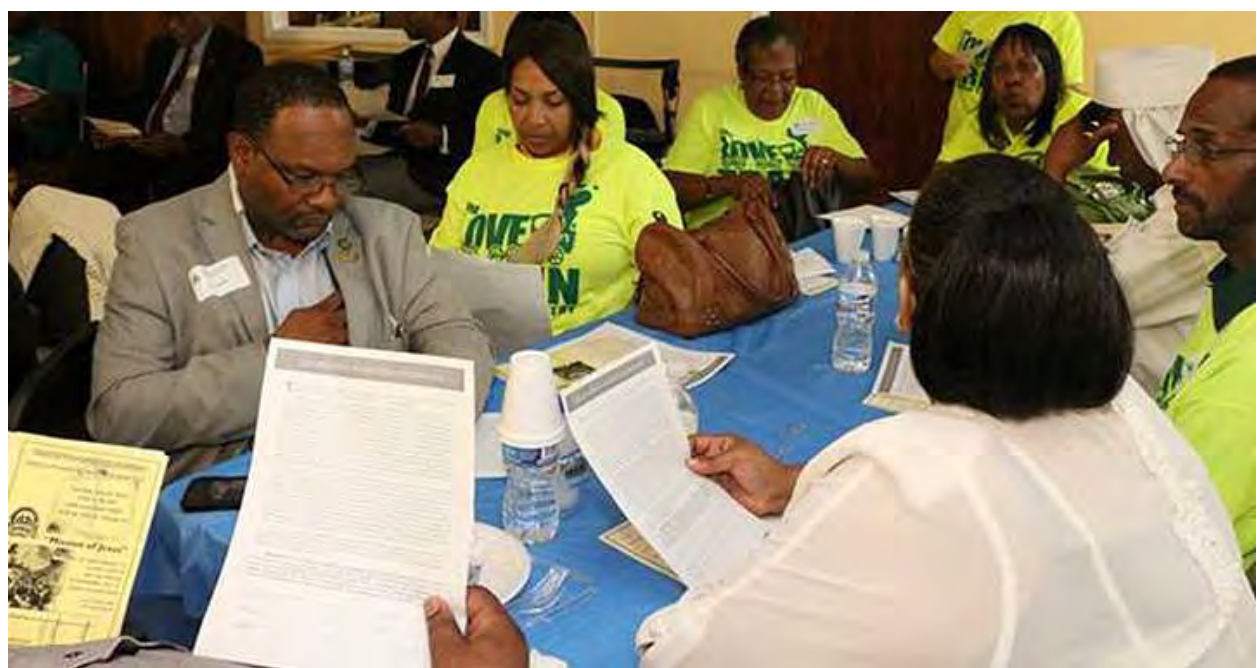
Attendees sign the petition

After the prayer breakfast program finished, the congregation quickly moved to the original Holy Ground that True Father established in Grant Park, located in a prime spot in downtown Chicago.