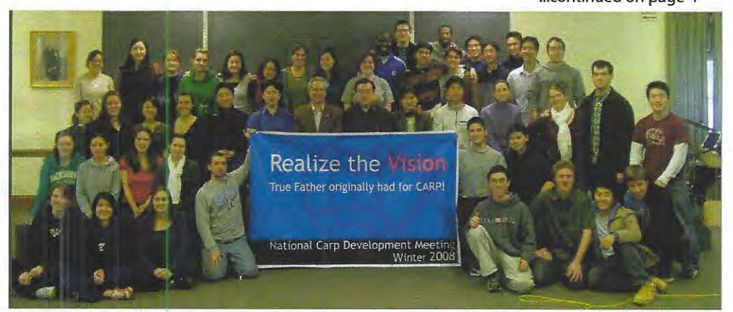
Student leaders from around the country gathered at UTS to discuss, develop and launch CARP into a mainstream movement across America

pants joined six Action Committees for CARP Development nationwide. With the theme "Realize the Vision True Father originally had for CARP!" students avidly engaged in discussions and responded to presentations on what CARP was doing in the ...continued on page 4