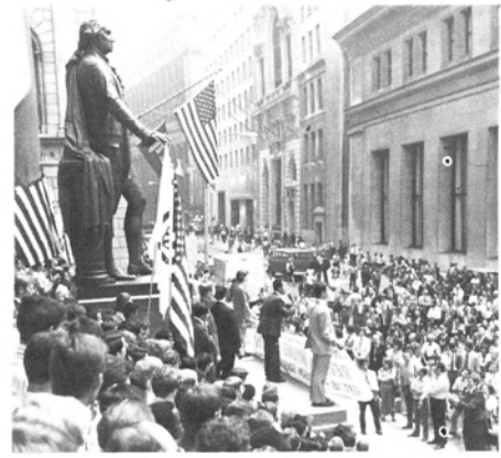
Wall Street Rally for God and America.

The Christian tradition in America is a most beautiful thing for foreigners to behold when they come to this country. When I first came to America, I went to New York and stood on Fifth Avenue during the rush hour. Suddenly tears began pouring down my face. I looked at the wonder of the Empire State Building and the magnificence of the new Trade Center—the tallest buildings in the world. But I asked myself, "Does God dwell in those buildings?"