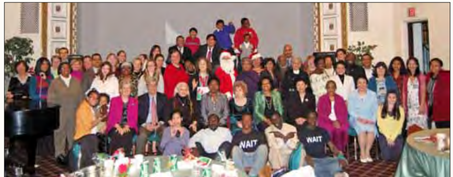
Benefit for the Schools of Africa, WFWP Chapter in Washington DC