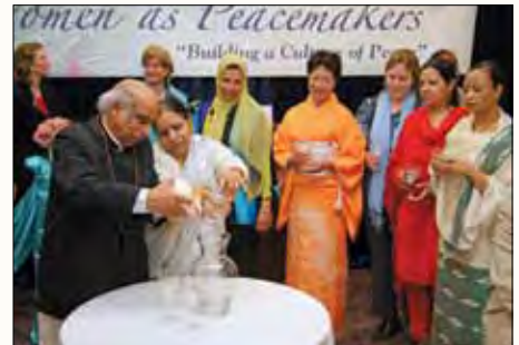
International Women's Day, Washington DC