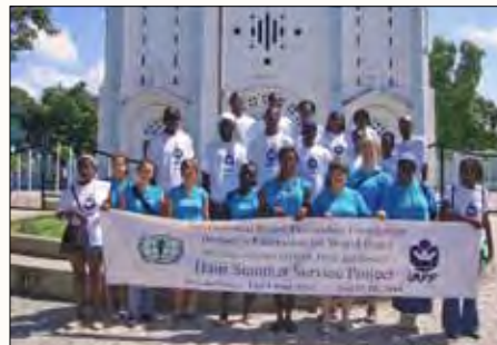
Service Trip to Haiti - June 15-29, 2009