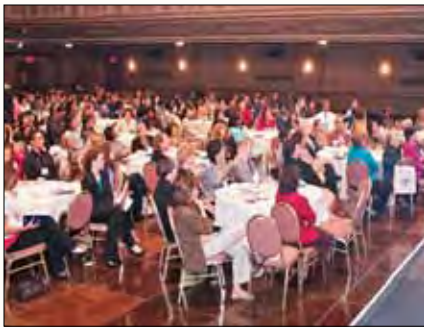
17th WFWP Anniversary National Assembly, September 18-20, 2009 - New York City