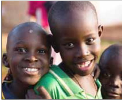
WFWPI is a 501(c)3 Non-Profit Organization

For more information about projects, see Biennial Reports at www.wfwp.org