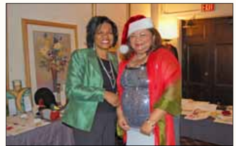
Benefit for the Schools of Africa, Silent Auction in DC