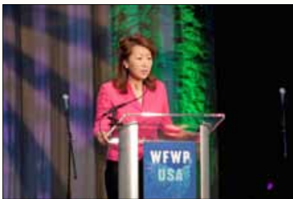
Rev. In Jin Moon addressing WFWP National Assembly