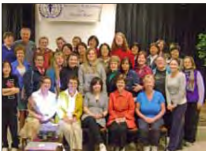
Monthly Meetings of Chapters Nationwide, Seattle