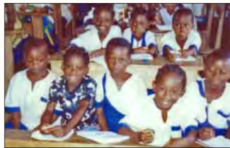
WFWP Sponsored School in Equatorial Guinea