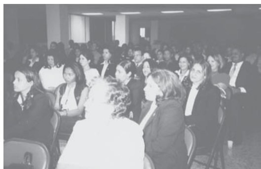
Aids Seminar for 150 employees of the Popular Savings and Loan Association

Clothing Distribution - Received donation (Jan 02) of 585 boxes of used clothing from Japanese NGO called AAA and distributed it (Mar 02) to 5 charitable organizations serving the handicapped.