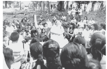
Gathering the women in front of a health center.

Ongoing Service Projects - outreach mainly to the women in remote villages to supply them with basic necessities like soap, school supplies, milk and toys for their families and through the care and contact to uplift these women's lives.