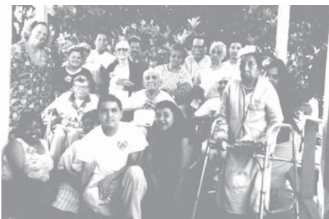
WFWP Representatives visit patients in a Lepra Hospital.