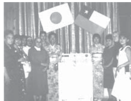
WFWP Japan donates Commercial Clothes Dryer to the Home of Las Rosas Foundation, March 16, 2001.