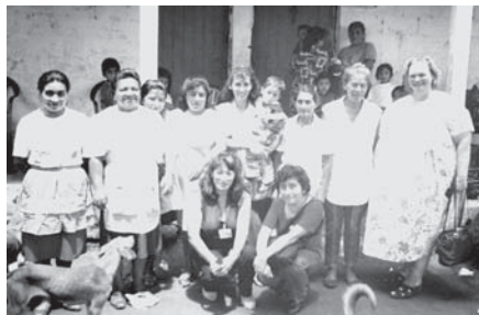
Outreach to women in Vela Minas, a tiny village in the mountains.

Fundraising Projects - most service activities are maintained through local fundraising.