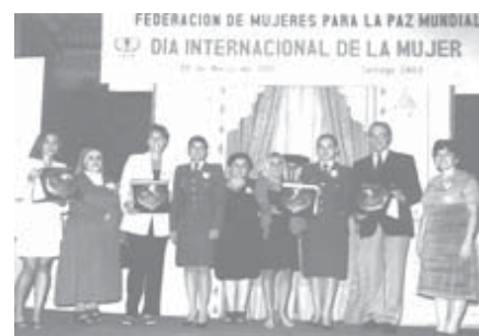
Annual WFWP Awards Celebration on March 8th, the Int'l Woman Day