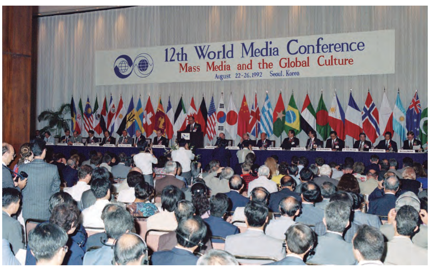
True Parents, 5th Summit Council for Peace (22-26 Aug 1992)

advocate level ideologies, are making the achievement of a standard of world peace their goal and purpose. That is the difference. Then, why have the democratic world and the communist world become separated from the wave of peace? It is because they failed to transcend nationalism and ethnocentrism. The cultural background is different. It involves not only race, but also religion. (129-232, 6 Nov 1983)