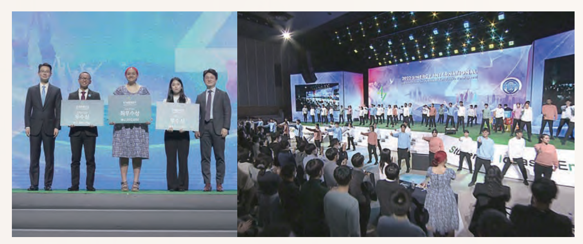
The 2022 S!NERGY International winners, The finale: "Let's Go!" by YSP

identify fair-trade green coffee beans based on key data (green bean chemical composition analysis technology) and participate in direct production (roasting). This concept of sharing technology and experience and seeking ways to help grow led to the establishment of this company."