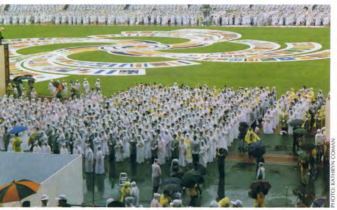
Brides and grooms, wearing raincoats, await the beginning of the 360,000 Couples' Blessing Ceremony amid the pouring rain. Couples from North America are in the foreground.

This victory of the 360,000 Couples' Blessing was not accomplished by our efforts but by God working to weave the world together and True Parents' victorious fortune and sovereignty.