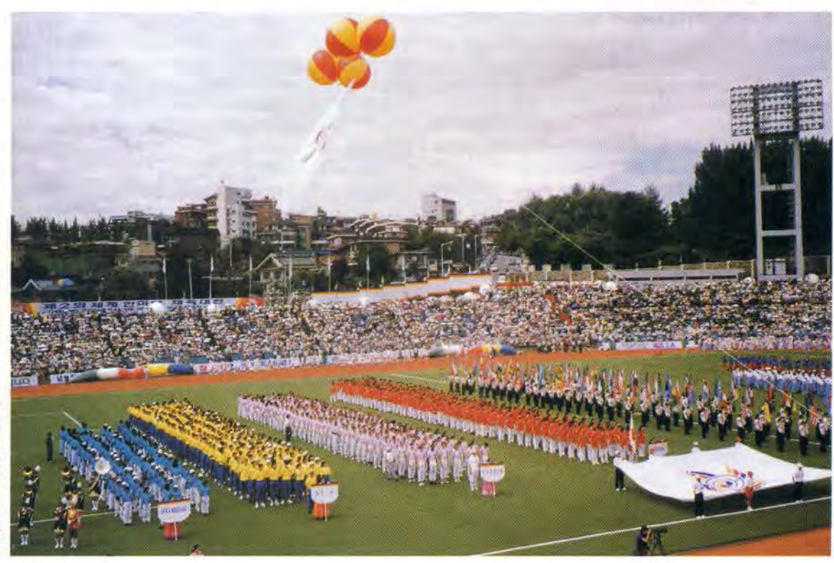
The opening ceremonies of the Hanmadang Sports Games in Hyochang Stadium, Seoul, Korea.

The exhibition hall in which a display of Father's work was set up for all to see. One of the new events in the Second World Culture and Sports Festival.