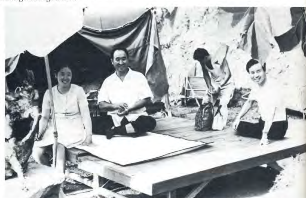
Father, Mother, and several of the early members set up camp on the shores of Chung Pyung Lake.

then I would be contrary to this law. Therefore, the woman you meet is the person whom you have been waiting and longing for, for six thousand years, and whom God looks over and parents have introduced. Isn't love reached through God and parents? That is why the path of salvation which Unification Thought is teaching is not individual salvation. If the family is not saved then nothing can be saved. It is the salvation of couples and children. If we are not able to save our children then we must wait in the spiritual world. Thus in the spirit world the educational law is established. Everyone must go to the spirit world in a single line. Do you understand? In the spirit world there is an educational system, and all the things