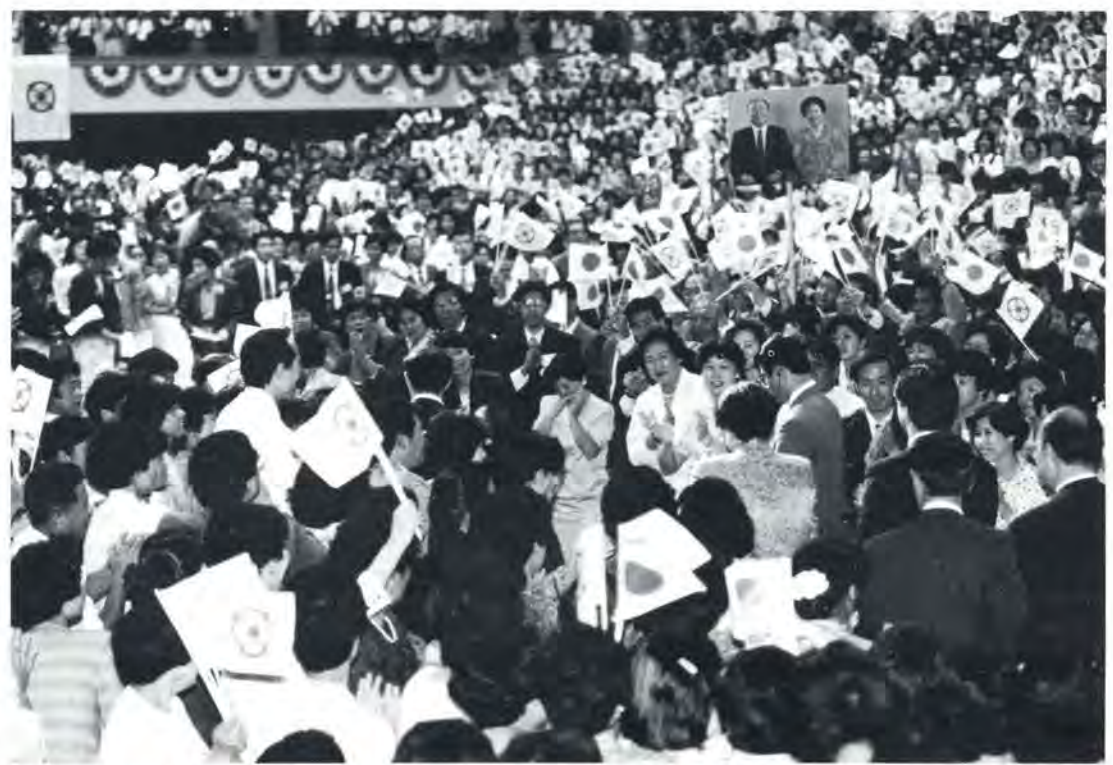
At Chubu-Kinki-Members' Conference at Gifu Memorial Center, True Mother is greeted with cheers and smile.

Due to the failure to restore the elder sonship, the religious and nonreligious worlds divided and heaven and hell emerged, and spirit world exploited the human world. But from now on, Satan's henchmen will be unable to wield power at