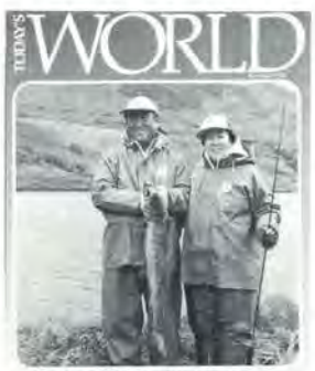
The Royal Family of True Love A Memoir—Early Days in Japan