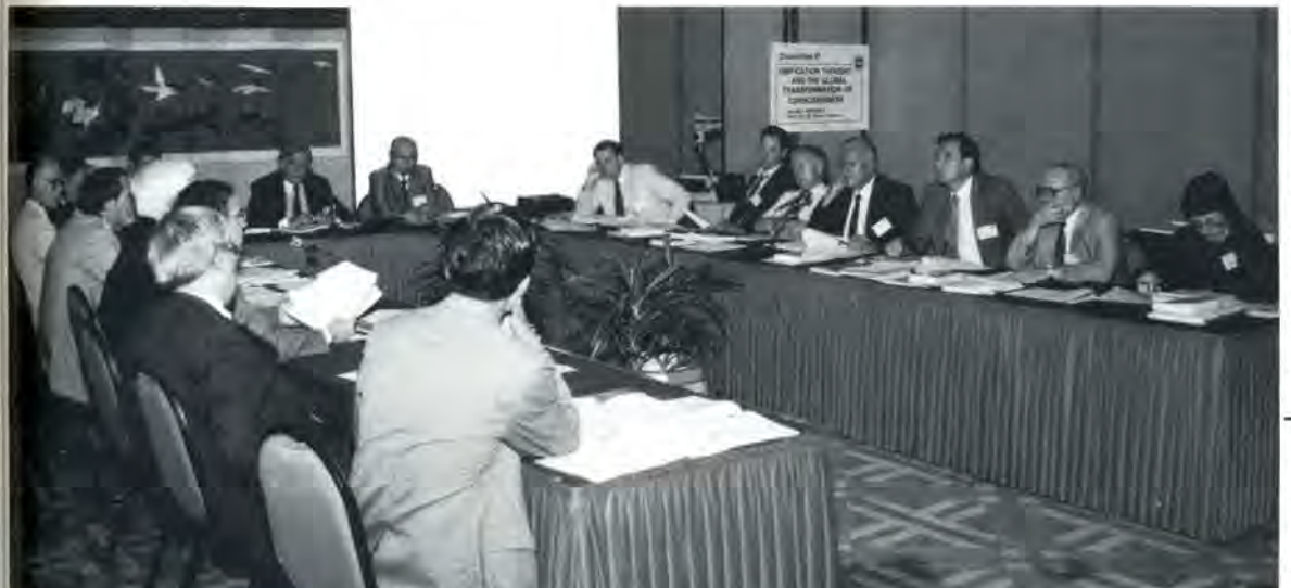
Committee VI participants enter into a lively discussion on various aspects of Unification Thought.

Rev. Moon deplores the fact that today's philosophy takes little interest in real problems, but is philosophy for the sake of philosophy. However, this view of Unification Thought does not undercut the academic value of