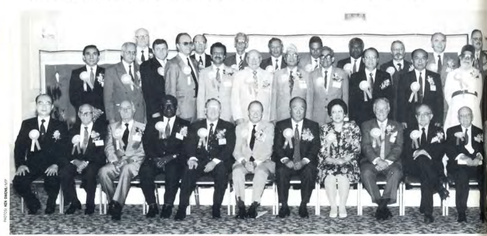
Summit Council for World Peace participants gather for a photo with True Parents.

the Summit Council program was "The Twenty-first Century and the New World Order." The focus of the forum included various themes such as the role of democratic values, methods for development, and other matters relating to preparation for the twenty-first century.