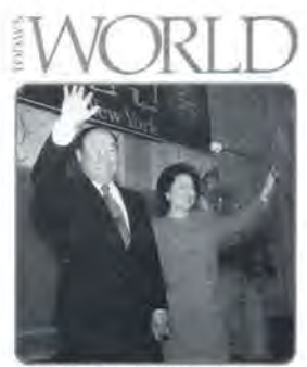
MUST IN AUTON SEMINAR - 0.15