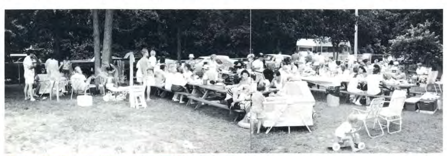
The Annual Family Reunion has created deep friendships over the years.

tioned we would be staying up late to wrap flowers for the following day, she insisted we go to bed, saying, "I don't have to work tomorrow—I'll wrap the flowers tonight." The next morning, after a nice breakfast, she would send us off with our flowers. We hadn't told her our purpose for fundraising, but on the eve of our Blessing in Korea, she had a dream about the Marriage Supper of the Lamb, and she was baking the cake! She