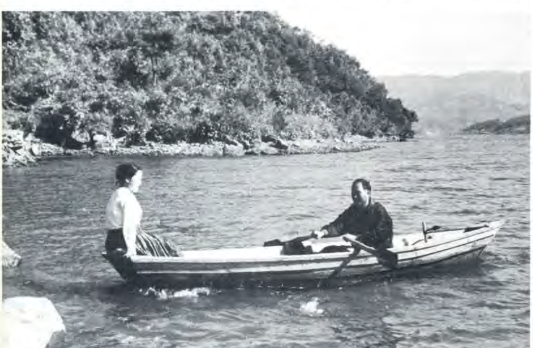
In a rare moment, Father rows Mother around Chung Pyung Lake.

In that place of attending God we must live for centuries and for a millennium. That place is the foundation for the Kingdom of Heaven. If this is realized then we can receive God's love and we can inherit God's lineage and thus are able to love everything which God possesses. Such an incredible position is the position of the blessed couple. Do you understand? One