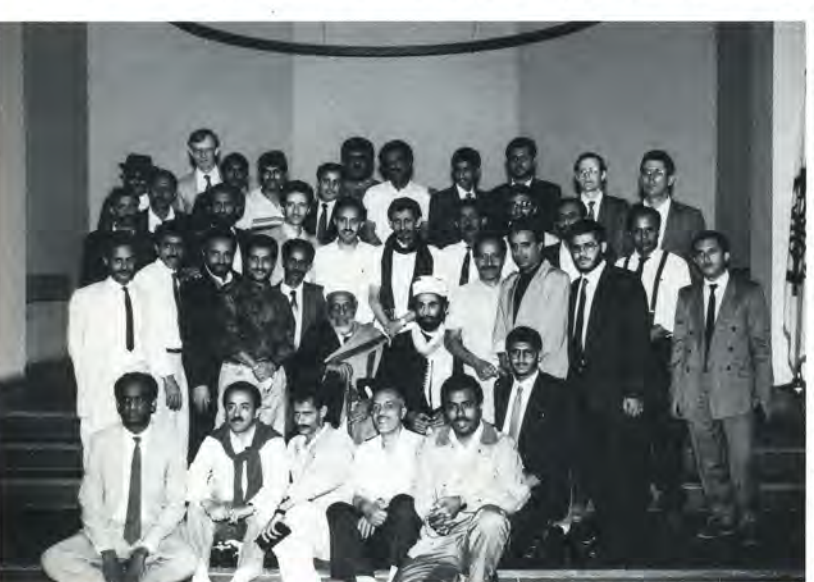
Yemeni participants of the recent 40-day Leadership Conference visit the Unification Theological Seminary in Barrytown, New York.

A: Yes, about studying Islam. There are several ways to study a religion: one can read all kinds of books or get in touch with the followers; but the best way I discovered to study a religion is to study the life story of the founder of