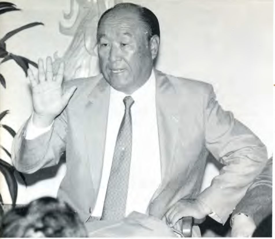
centering on God's love, God's life, God's blood lineage.