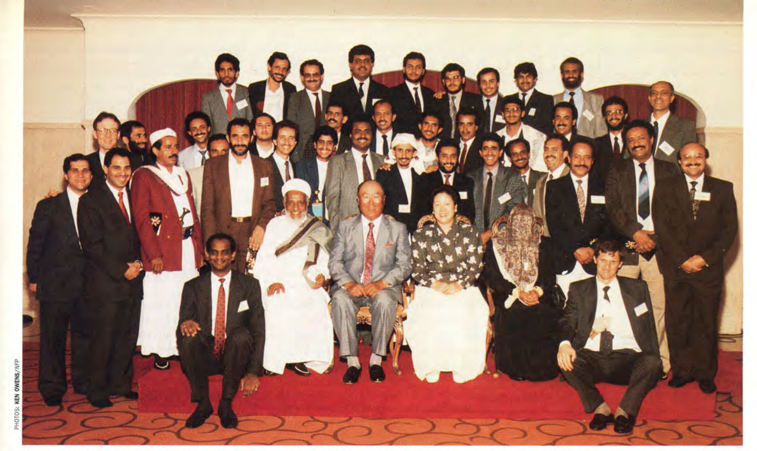
Yemeni participants of the 40-day Inter-Religious Youth Leadership Conference are invited to have their photo taken with True Parents.

from the beginning of the conference we made it clear that this was not a church per se, but the Unification Family. The participants could relate to this concept without the sensitivity involved in relating to most Christians. Arabic people are very family-oriented. Through the Unification Thought lectures they could understand how we must perfect our love in all different directions, with the family providing the base for building the Kingdom of Heaven on earth.