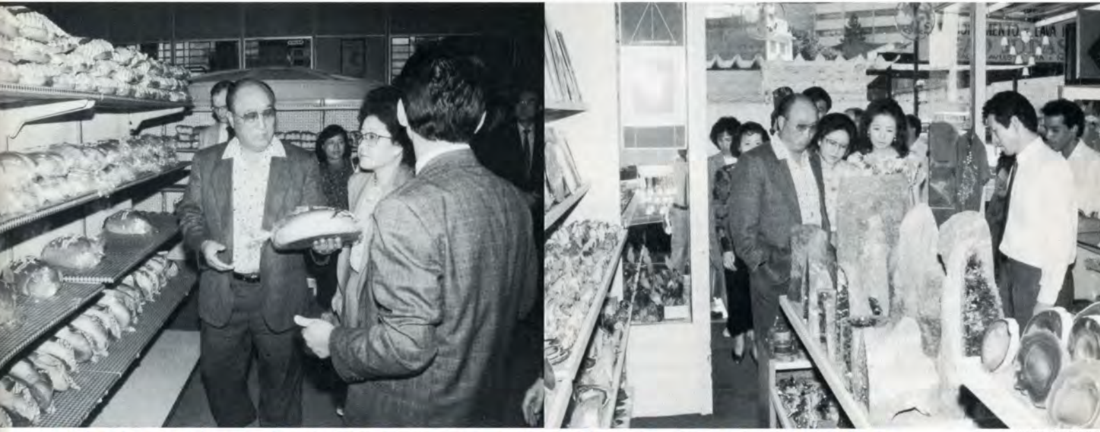
During his recent trip to Brazil, Father visited businesses owned by church members: left: a bakery, right: a gift shop.

Without God's law, how can you find true love? When a man has true love, a woman wants to give herself freely. A family system centered on true love should exist everywhere. Now you are hearing, "Yankee go home" in all the four corners of the world, but if you win true freedom, everyone will welcome you. Satan's concept of lawless freedom, of doing what you want to without regard for the whole, has undermined traditional values, morality, and religious faith, and is influencing young people all over the world. True freedom should produce good fruits, but since there are none, we know it's fake, and can never multiply goodness.