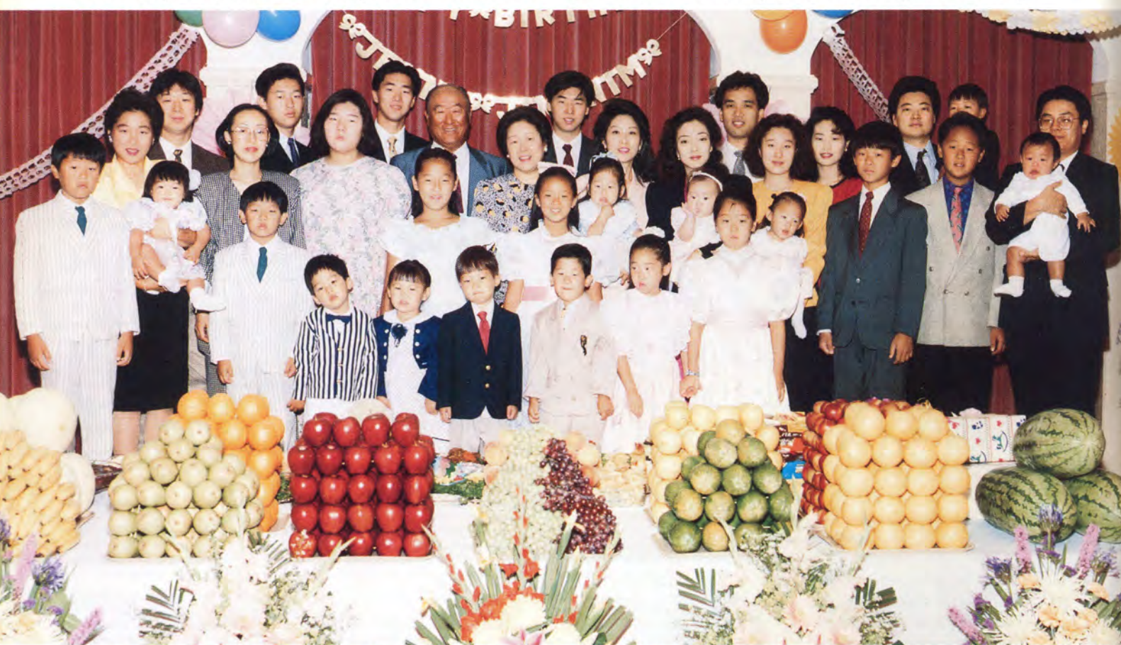
The True Family gather for a photo on the occasion of Jeung Jin Nim's 9th birthday celebration on June 13 in East Garden.

After the restoration course or recreation course centering on God, all of humanity would have recognized the comple-