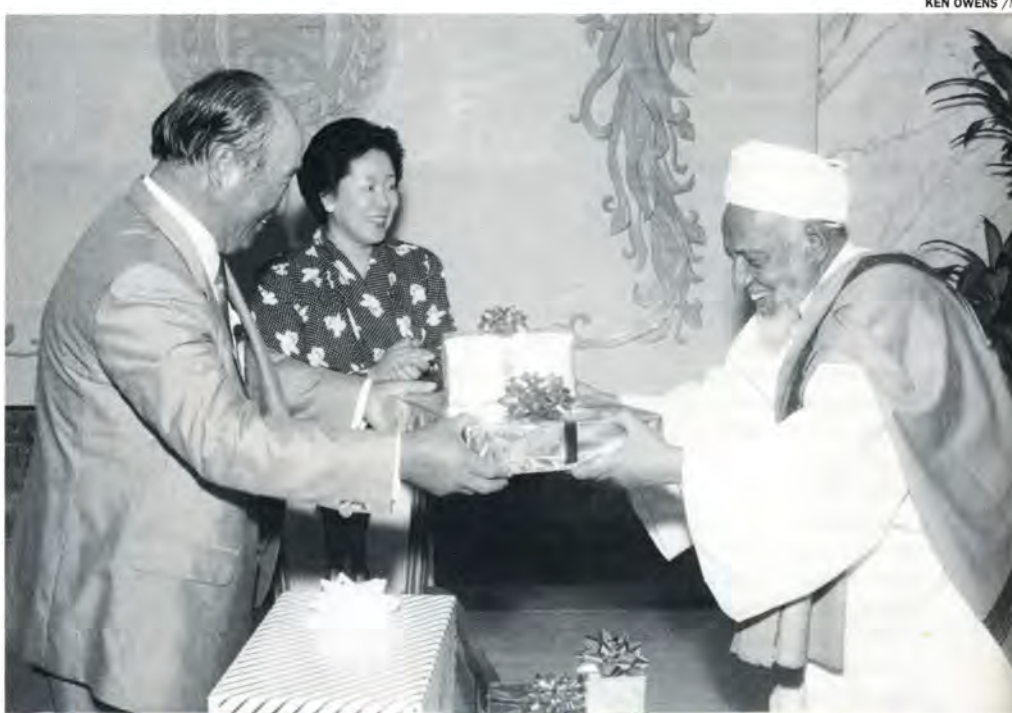
The Grand Mufti of Yemen receives lovingly prepared gifts from True Parents during a banquet at East Garden.

I remember three generations of Muslim leaders in the Soviet Uniontwo of them have already passed away. Now I am dealing with the third generation of Muslim leadership. I visited all Arabic countries of course, and again I was invited by the respective religious communities. This is how I got to know