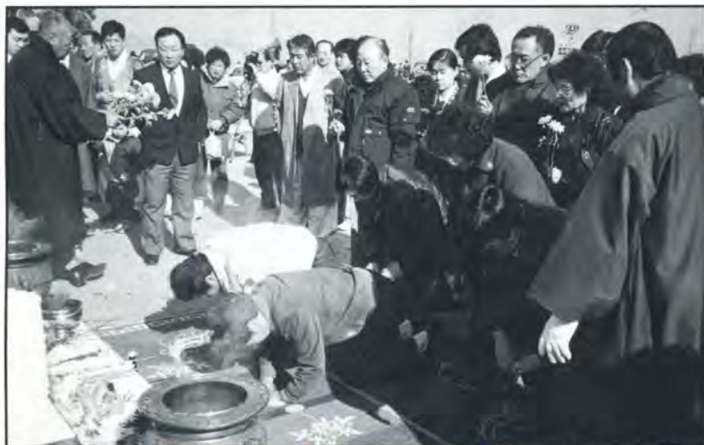
South Koreans bow to their ancestors in North Korea at the DMZ on the Lunar New Year.