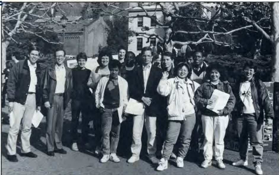
An enthusiastic team gets ready to witness in Berkeley, California. The author is on the far left.

As witnesses, you must have such a deep heart of concern that you burst into tears when you pray for the people. You must strive to make yourselves that way. Suppose one of your hard-won members goes somewhere and does not