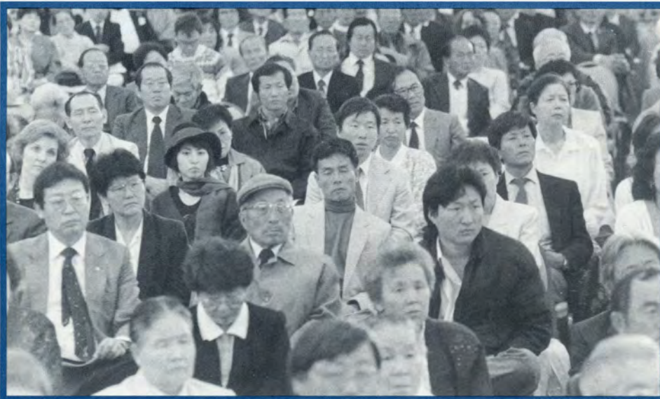
KEN OWENS / NFP