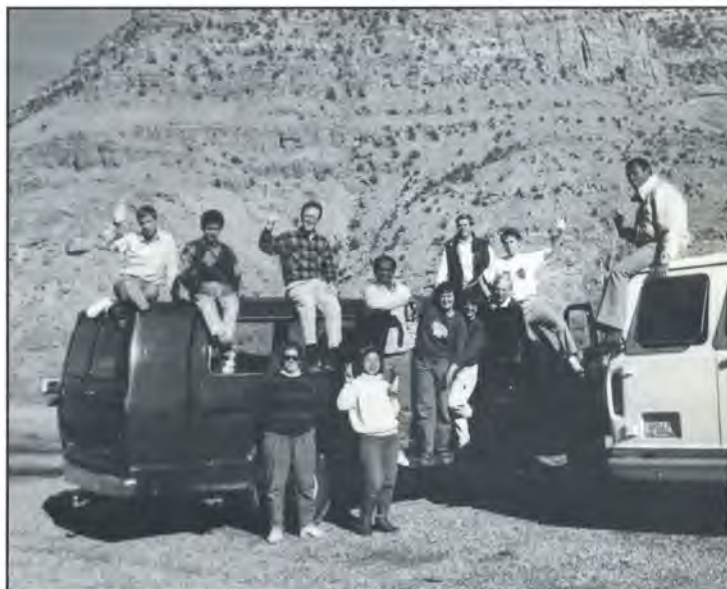
During a break in travelling, the team admires a beautiful Western landscape.

There's such a need for members to really respect and love one another—