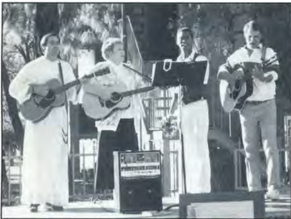
An interreligious musical presentation attracts students to our witnessing tables.

The other campus ministries did not realize how they had carried out True Parents' direction when they helped organize this week on Unity and Diversity.