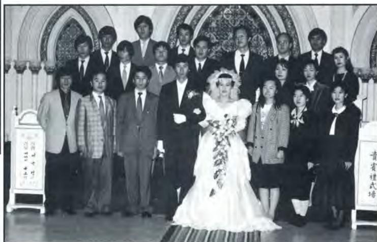
A Korean/Japanese wedding celebration in the Korean spouse's hometown.