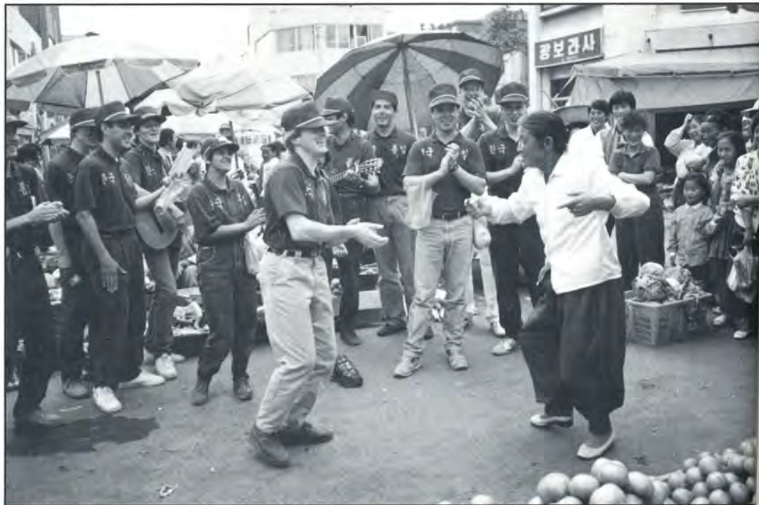
A spontaneous celebration during one of the Western mobilized members' community clean-up activities.

Our main internal activity is to absorb and be transformed by the Korean culture.