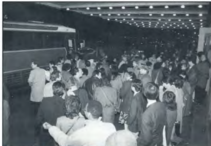
Buses arrive bringing guests to the rally.