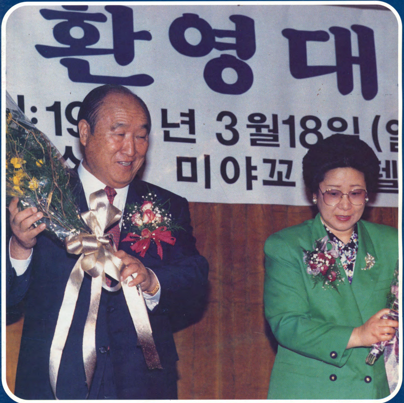
Father's Public Speaking Tour IOWC Mobilization in America