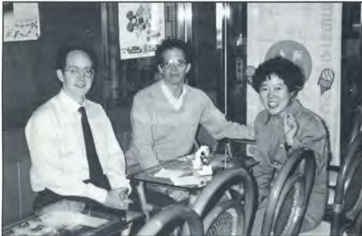
Birthday celebration for the first full-time member to join through the Western mobilization witnessing in Korea.

When I visited America many things were familiar, but now I feel so much closer to Korean people than to American tourists. It is a testimony to the change that is taking place in the brothers and sisters as we are here. □