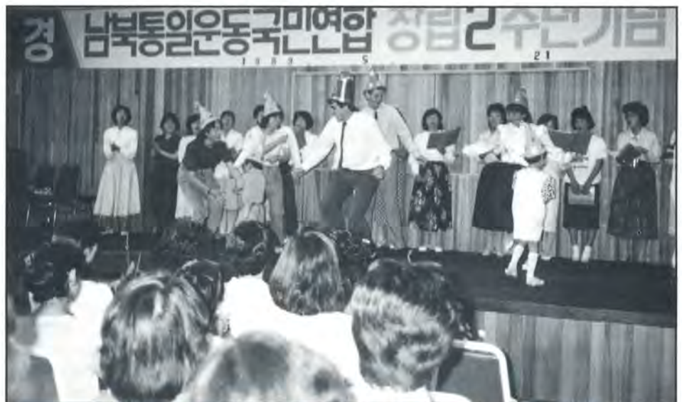
Japanese and Western entertainment on the Second Anniversary of the Citizens Federation for the Unification of North and South.

In the first year that kind of heartistic union, especially between the Koreans and Japanese, was really the major accomplishment and victory. I think the Japanese learning to relate in Korean had a major impact because historically