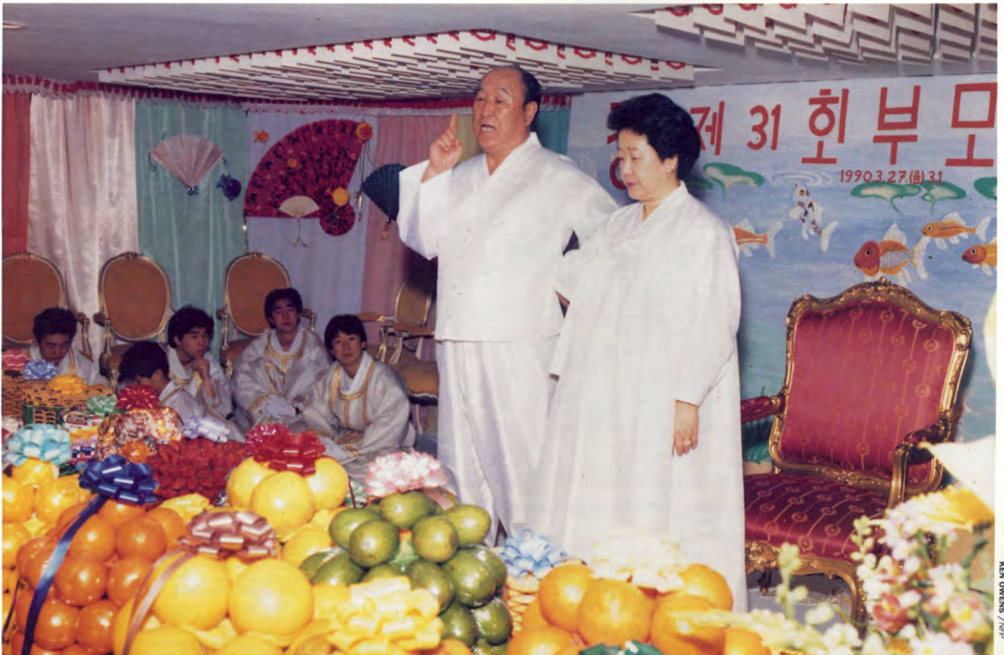
Father declares at Pledge Service that the accomplishments of True Mother, representing womanhood, have liberated all women.

You are like the fruit of that tree. Eventually you become a seed, too. In order to do that, you first have to bloom with flowers, then pollination of the male and female flowers must take place. In this way, you are the fruit of your own mother and father whose love created you. Those parents also had their own parents, who had their own parents, and so on, all the way back to the beginning. If you want to become a par-