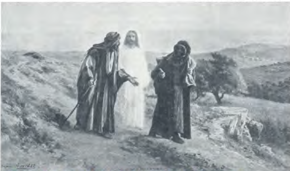
"Can Jesus talk to me as vividly as he did to his apostles after his resurrection?"

this figure: "I will give him authority over the nations." Then Jesus quotes the messianic psalm in Ps. 2:9: "He will rule them with an iron scepter; he will dash them to pieces like pottery." Jesus doesn't mean this figure will literally do that; he says this to indicate that this chosen figure on earth will receive his authority from Jesus' hand. He will be exclusively linked to Jesus in that authority.