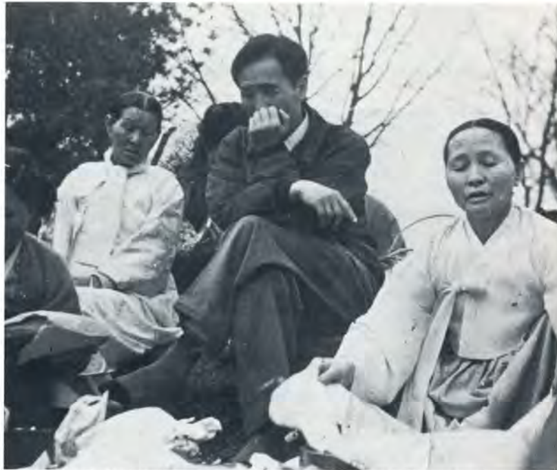
"Loving God with all your heart, all your strength, and all your soul. . . ."

Where is communism rising most? It's in those areas of the world where Christians have failed and Marxism appears as a viable alternative—especially among the third world where people are desperate for a better way of life. Unfortunately, some Christian ministers and missionaries came into these nations and gave the people the word of God with their right hand and with their left hand sent all the nation's wealth and resources back to their home nation. This happened all the time. Our missionaries have gone to places in the world where Jesus' name is