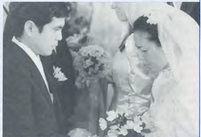
Couples exchanging rings.