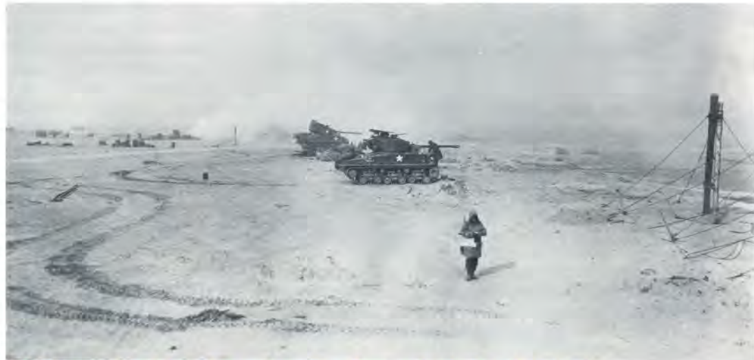
Will we repeat the failure of the past or will we change and make the right choices?

Christ will not come back for the purpose of fulfilling everyone's doctrinal agenda, but rather to establish his Kingdom. If Rev. Moon is praying more,