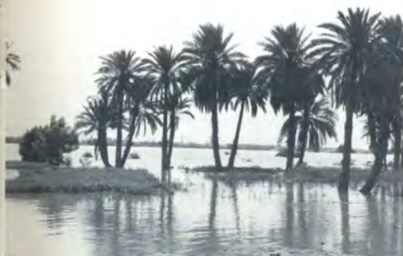
Scene of Khartoum, the capital, after the flood.

After I had been there a short while, this inspiration came to me: "Why not