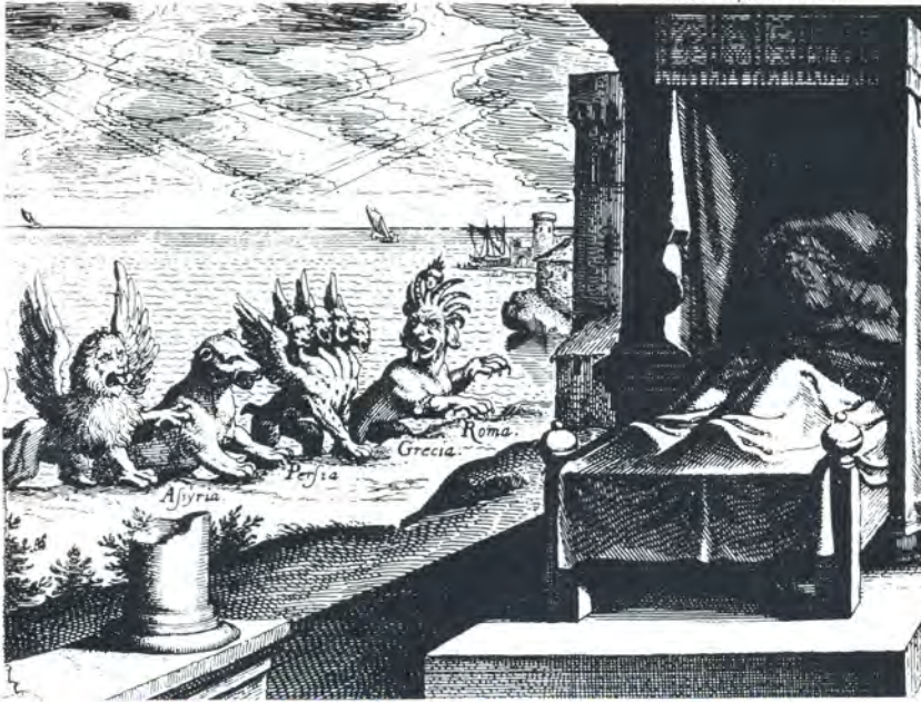
Daniel's prophetic nightmare of the four allegorical beasts that were to attack the tribes of Israel.

Christ face to face with no doubt and clear hearts. That's the age we are on the threshold of today. It will be a great blessing if we fulfill our responsibility. But it will be a terrible curse if we cast it aside.