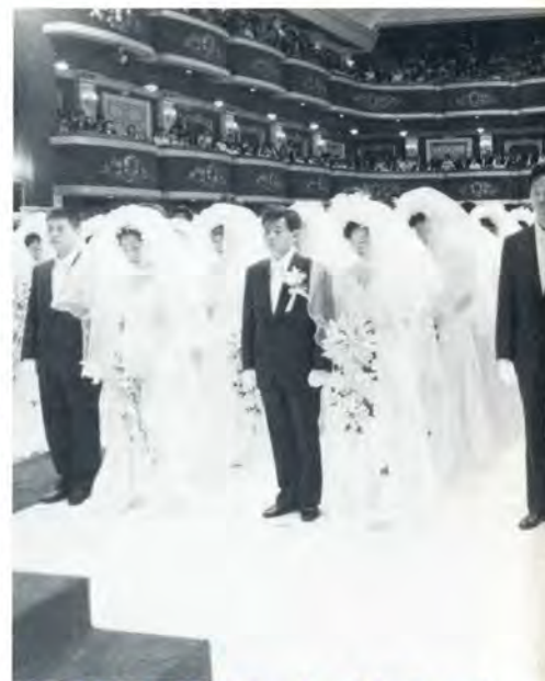
Wedding of the 72 Couples of the Second