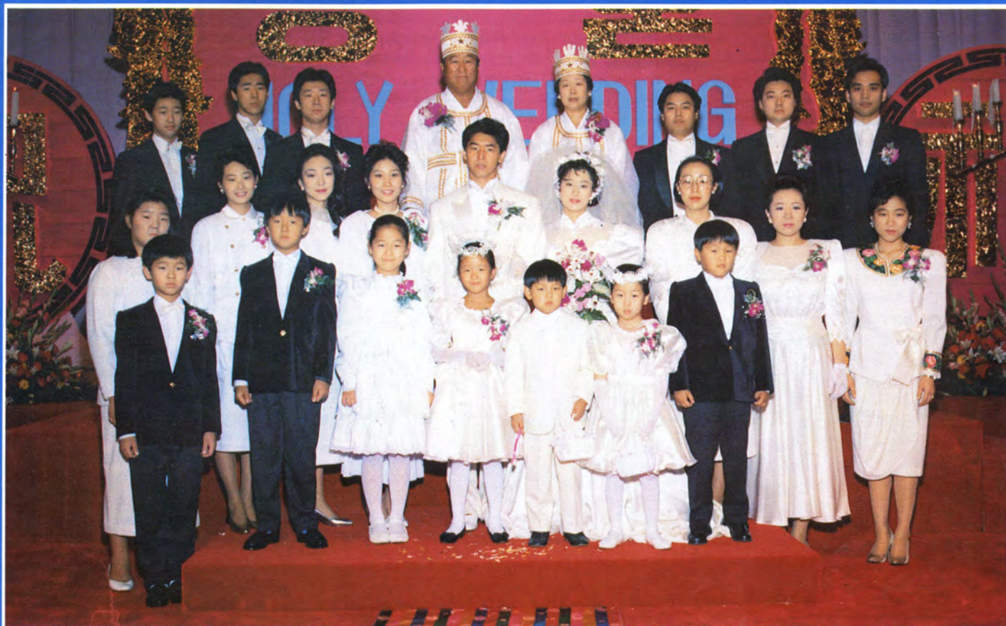
Holy Wedding Day! January 10, 1989