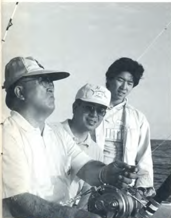
"I saw his entire heart and energy poured out."

tainous area near the ocean, saying that we should buy it sometime to make an international training center because this island is a connecting point of West and East.