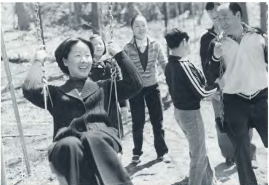
NEW FUTURE PHOTO

ally. If we have a strong spiritual life and feel close to them, then they are always with us. Often, the further people are away from them physically, like pioneer brothers and sisters, the closer they feel to them.