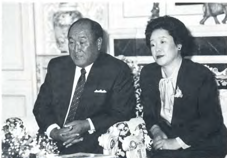
"They are always living a public life each moment."

When Father was visiting at home I would do his laundry. I saw that the undershirts and underwear were so old and so dirty. I was always crying about Father's clothes. Many times I also saw