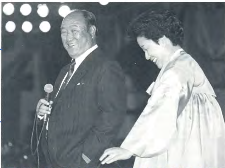
Father and Mother singing during entertainment at the October 30, 1988, Blessing in Korea.

The task of 1989 is to gather 7,000 members from around the world to love and to serve the Korean race so that they will follow God's will. Even if our own children are hungry, still we must support these 7,000 brothers and sisters so that they can serve the Korean nation. In the future we should be able to feed North Koreans. When unification of North and South Korea is achieved, then the unification of East and West Germany can be achieved in three years, and on that foundation the unification of the world also becomes possible. Without educating the people of China we cannot decisively benefit the world. Soon several thousand elite Unification Church members should serve in China. The unification