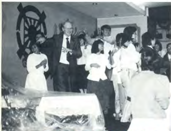
Singing and dancing at the 1,275 Couples evening entertainment.