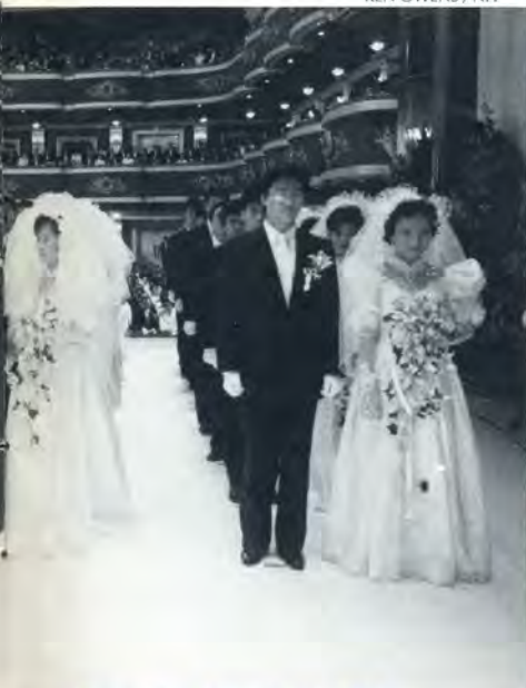
Generation, January 11, 1989.