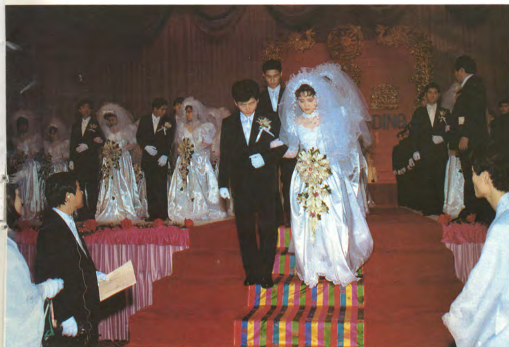
Processional march of the 72 Couples of the Second Generation.