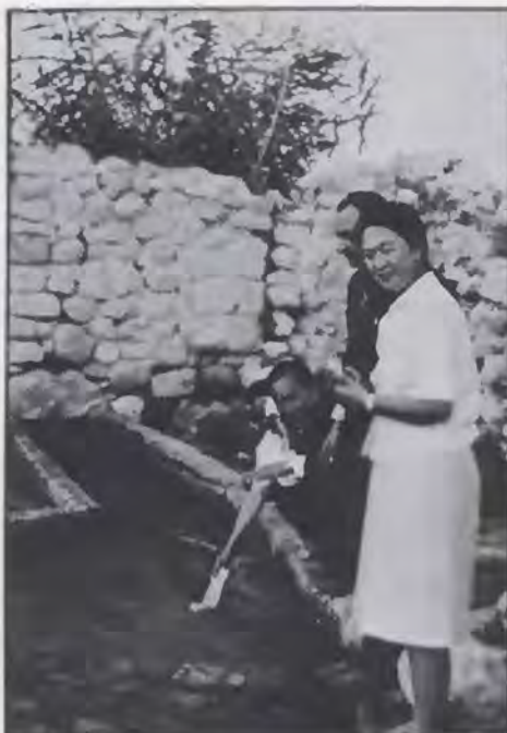
At the Sultan's Spring.