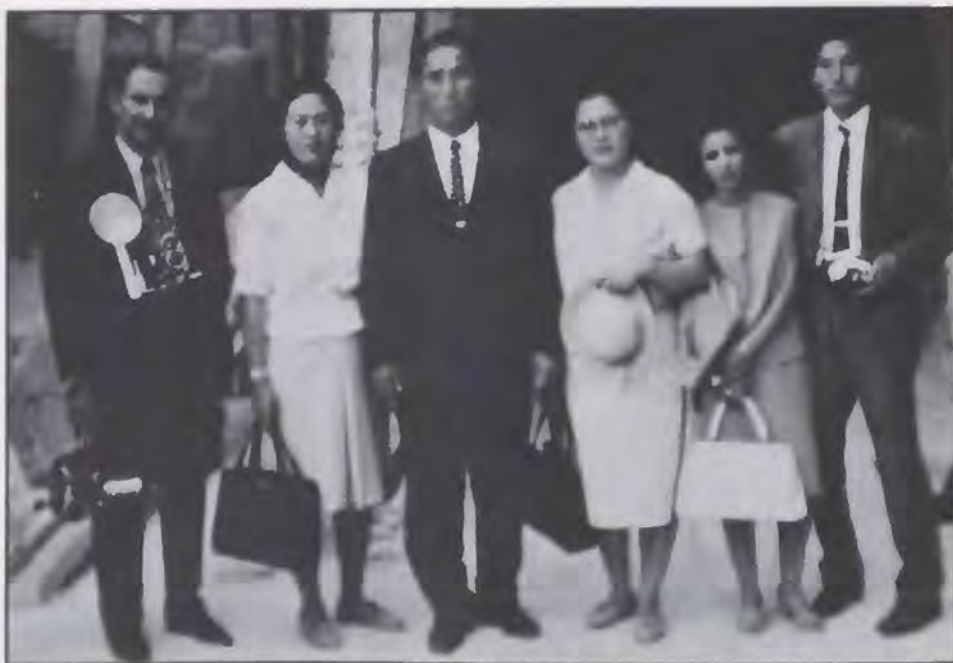
At the entrance to the Holy Sepulchre, where Jesus was buried.