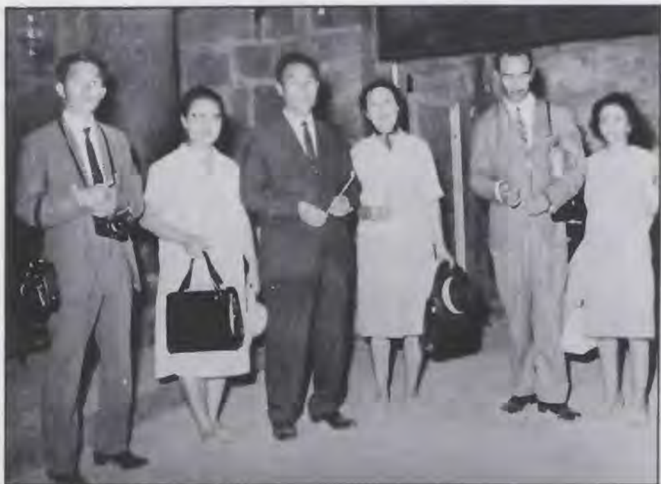
At the place where Jesus was imprisoned.

Father first wanted to visit the "Way of the Cross" (a series of sites in and around Jerusalem associated with Jesus' suffering and crucifixion). We went to the site where Jesus was held prisoner. As we made each stop along the way, I saw all the sorrow and sadness in Father's face; he prayed a lot in each of those places. One stop, the Mount of Calvary, was the place where the temple curtain was torn at the time of Jesus' death, located in what is now a Greek monastery. The monks were struck by Father and wanted to know who he was. I was so