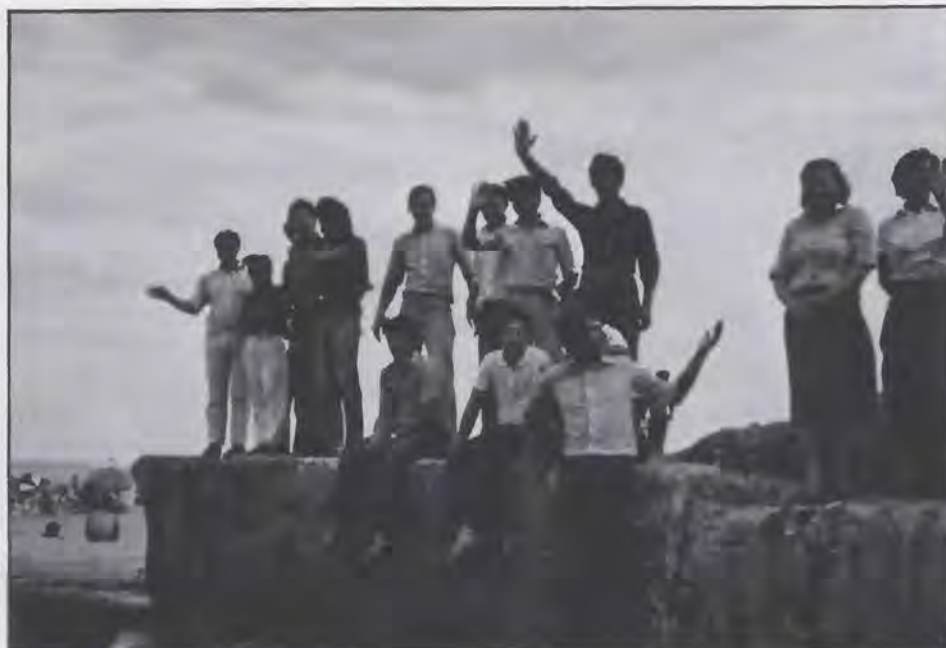
Members from four nations.