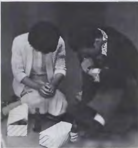
An engaged couple pray together at lunch during wedding rehearsals the day before the blessing.

needs. True Father said, "Don't have concepts of what family-life 'should' be like or you'll be hurt all the time."