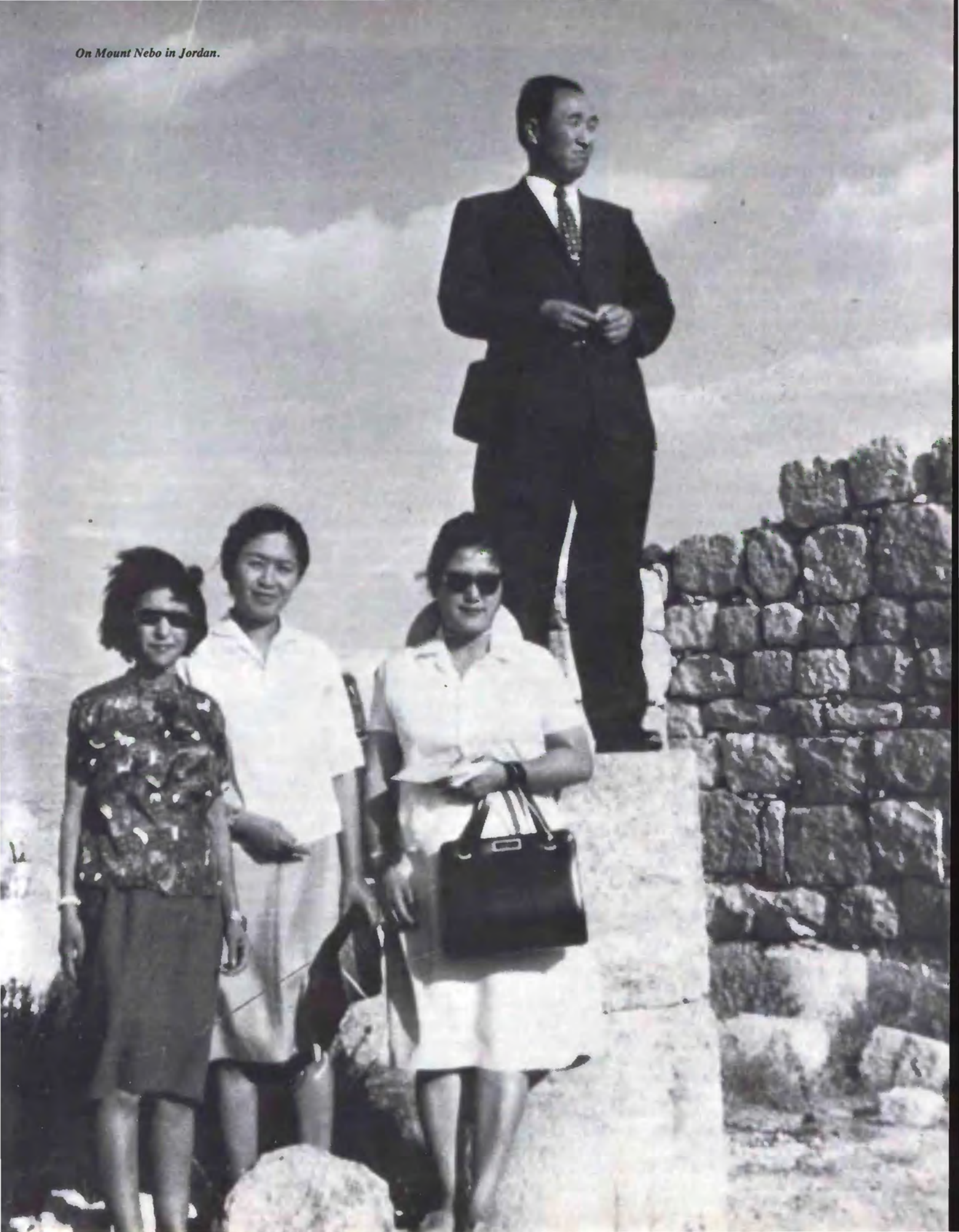
On Mount Nebo in Jordan.