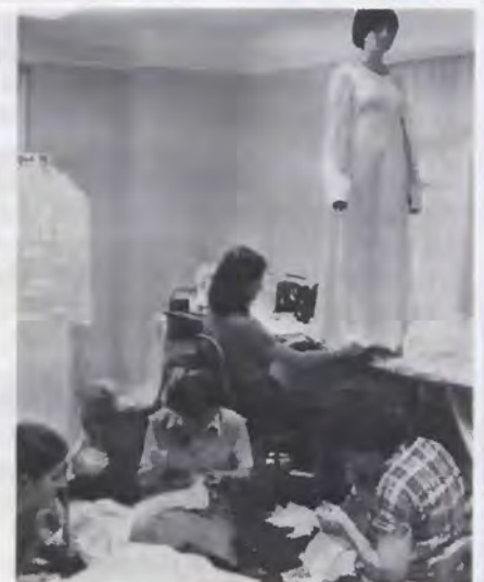
Many departments arranged sewing groups to help the sisters who had busy schedules, or no sewing skills of their own, to sew their dresses. Shown here is the sewing room of the MFT sisters.