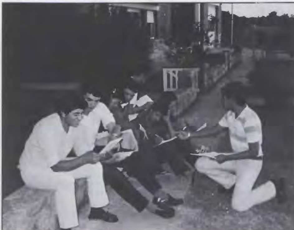
Studying for final exams.

The preoccupation which True Parents have for their children is the living example of how their love for others is what makes us love them.