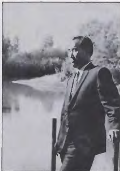
At the Jordan River.