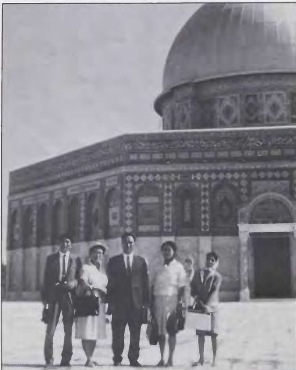
At the Dome of the Rock in Jerusalem.

they thought the teachings came from American propaganda. Just a few people whom I helped in some way came. One of them was a professor whom I was paying to tutor my son. One day he came and told me, "I am going to Australia; can you give me money to pay my way?" I gave him what I could, about $1,500, and he left without ever communicating to me again. I also started a business, hoping through it to support my efforts to spread Divine Principle throughout the Middle East. I didn't want anyone to have to help me; I wanted these efforts to be self-supporting. But I had no experience in business, and people cheated me.