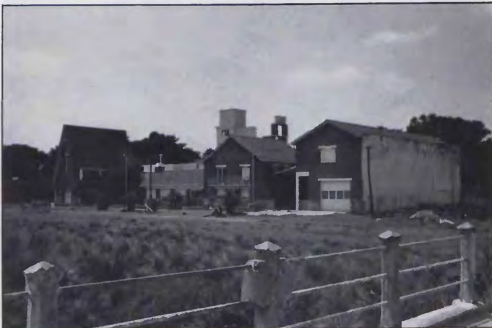
The training center site, a former Catholic youth school.

It was one of the most ideal settings I've ever seen for a training session.