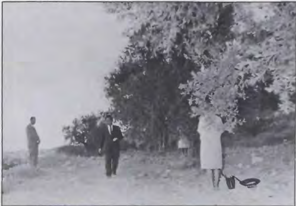
Making the holy ground at Gethsemane.

I was disappointed that nobody recognized him along the way, just as nobody recognized Jesus as the Christ.