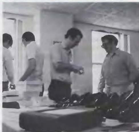
Brothers who had not yet prepared all their blessing finery had the chance to do so on the 6th floor in the New Yorker where a "blessing store" was set up. Future husbands could buy suits, shoes, and even a diamond engagement ring for their fiancée if they wanted to. This brother checks his ring size for the blessing application form as an advisor looks on.