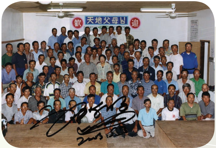
The beginnings: Japanese national messiahs with True Father on the forty-day workshop in 1999; the signature, given later, is Father's.