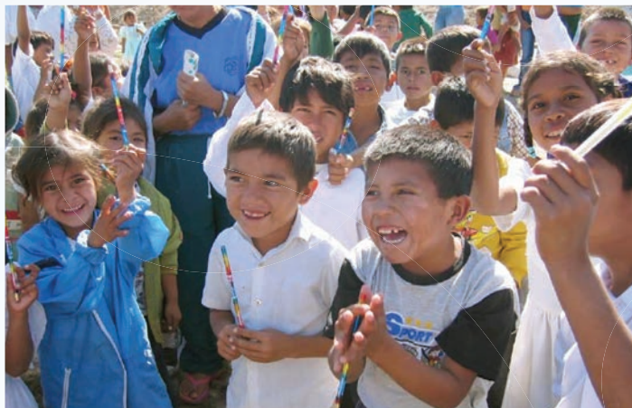
Children in a (relatively) nearby village receive gifts.

Our Leda community's efforts to voluntarily assist the local population was noticed by the Paraguayan authorities. On the project's tenth anniversary, in September 2009, the former