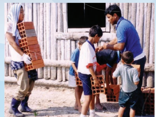
Left: The water purification system; Middle: A river naval patrol post built in Leda; Right: A school being constructed in 2003 by Religious Youth Service volunteers assisted by local children, in Diana, a village three hours by boat from Puerto Leda