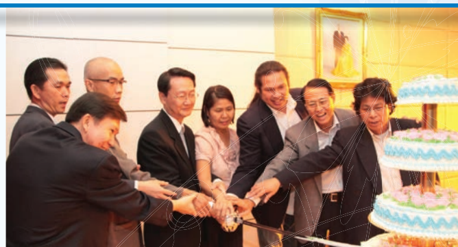
Left: The acquitted members are welcomed at the celebration; Right: Once incarcerated together, today they cut a victory cake.

seemed daunted by the task; it was twenty-one pages long. Nevertheless he started reading. Again and again he declared, "the Supreme Court agrees with the decision of the Appeal Court and the Criminal Court." False accusations were struck down, one by one: accusations against Father's teachings—struck down; accusations against the marriage blessing—struck down; accusations that members were taught to hate their parents—struck down; accusations that fund raising was deceptive—struck down; accusations that the members were trying to create rebellion in Thailand—struck down... Exasperated, the judge finally declared, "This is too long to read. The decisions of the Appeal Court and Criminal Court stand."