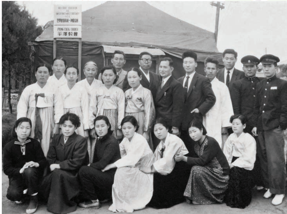
Members in Pyongtaek take a photograph with an itinerant Unificationist evangelist who is visiting their community during a campaign to double church membership.

The time has come when the young brother, Abel, can meet the older brother, Cain. That means it has become possible for