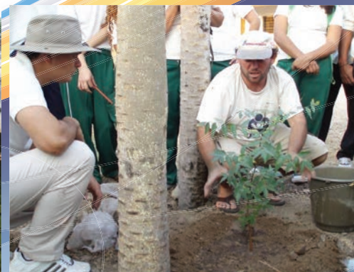
Products of their fish farm and (650-head) cattle ranch, and efforts to find profit-producing trees that will grow in Leda's inhospitable soil; they also grow rice and a variety of vegetables and fruits.