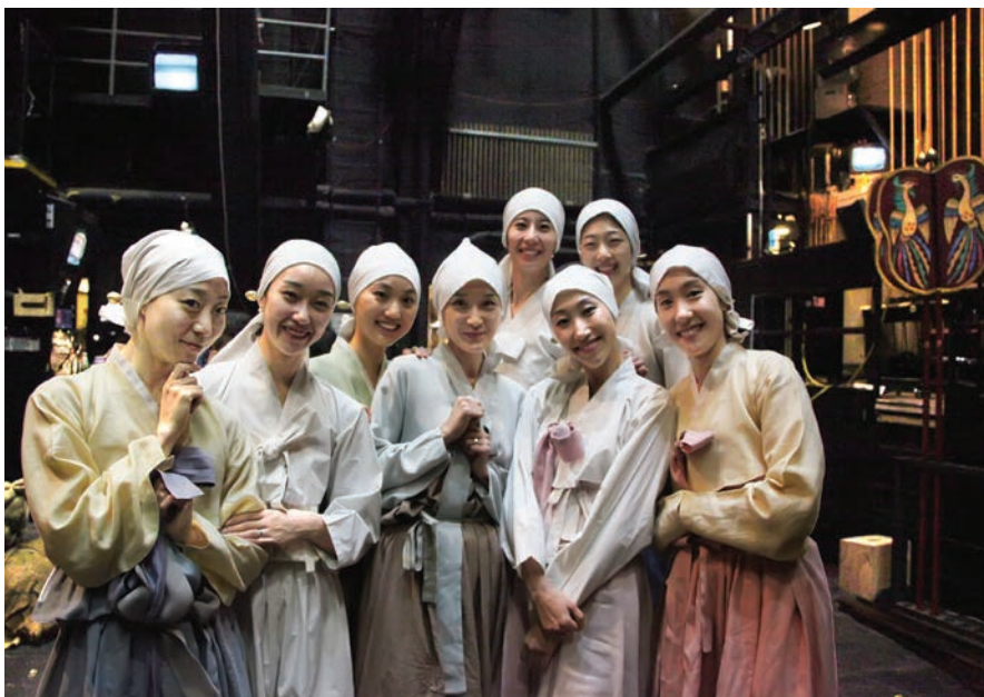
Ballerinas who portray village women, backstage before a performance of Shim Chung