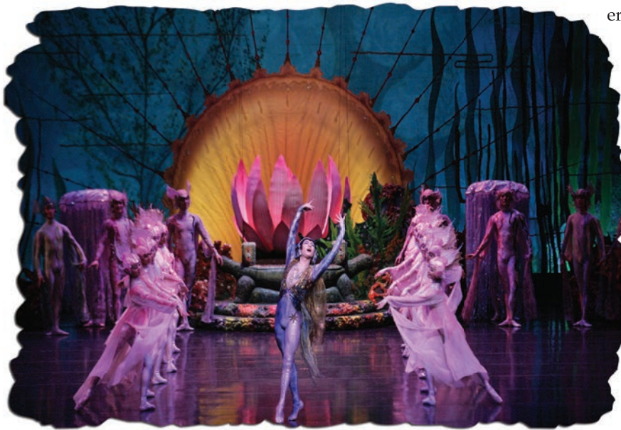
Shim Chung: The undersea palace of the Sea Dragon King

things may be going on that make you confused, or make you question or even shake your faith to its roots. Things will always happen, but that doesn't change the root, the essence of what Father has given us. If you always go back to the basics, the simple teachings that Father has given us, they will always guide you in the right direction.