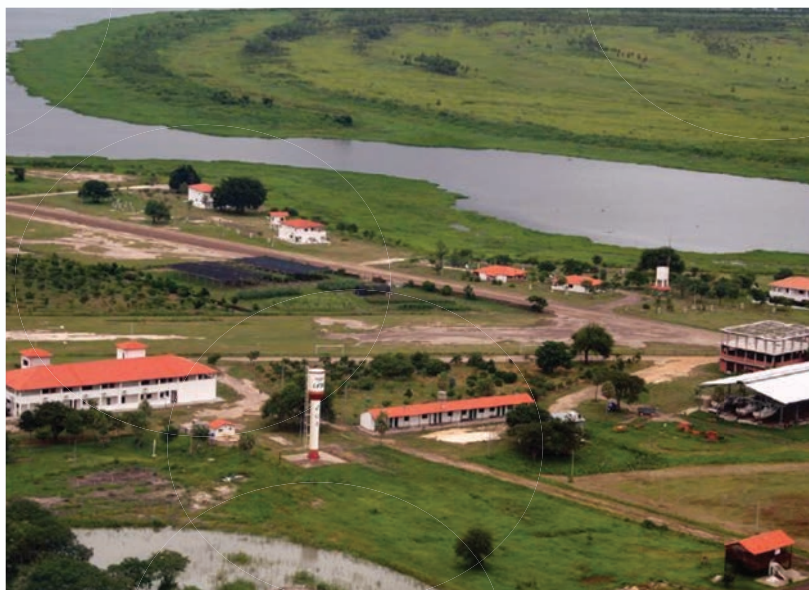
Panoramic view of Leda today

minister of education and the current vice-minister personally visited Leda from Asuncion, to express their gratitude and encouragement for the visionary work.