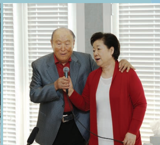
On August 6 (7.7 by the heavenly calendar) True Parents celebrated the holy days Declaration of God's Eternal Blessing ( Chil Il Jeol , 1991) and Declaration of the Cosmic Sabbath for the Parents of Heaven and Earth ( Chil Pal Jeol , 1997) at Cheon Hwa Gung.