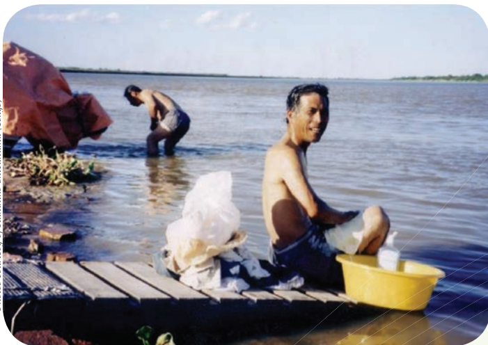
The early days of washing and doing laundry in the river

nates funding and other aspects of the project's development. He gave the following answer: "We understand that part of Father's direction for the Leda project is to be fulfilled as an internal (spiritual) dispensation, and part is to be accomplished substantially. Even if Father speaks of building a sanctuary of God's kingdom, unless the government of Paraguay were to recognize this, we of course could not create an independent sovereignty. The Japanese national messiahs' absolutely following Father's directions and resolving to build God's nation in the most difficult area of the Pantanal 2 will become the internal condition that can respond to Father's heart to build God's kingdom throughout the world."