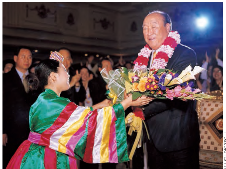
Father receives a bouquet of flowers at the entertainment for the first anniversary of the Coronation Ceremony for the Kingship of God (January 13, 2002)

Let us pledge to save the nation and the world and put that conviction into practice. That is the way of God, the way of True Parents and the way of emissaries. I am truly grateful to all of you for coming here. You should remember that you are the participants of the very first meeting of emissaries at the beginning of 2002 and you should not do anything dishonorable. Do you understand? Those of you who understand what I have said please stand up. "According to Rev. Moon's wish, God's love, life and lineage are mine. They belong to our tribe. They belong to my people!" Those of you are really deter-