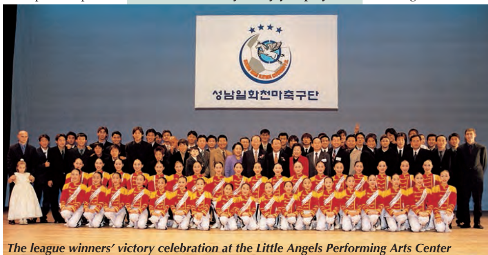
The league winners' victory celebration at the Little Angels Performing Arts Center

What have you learned about the management of a soccer