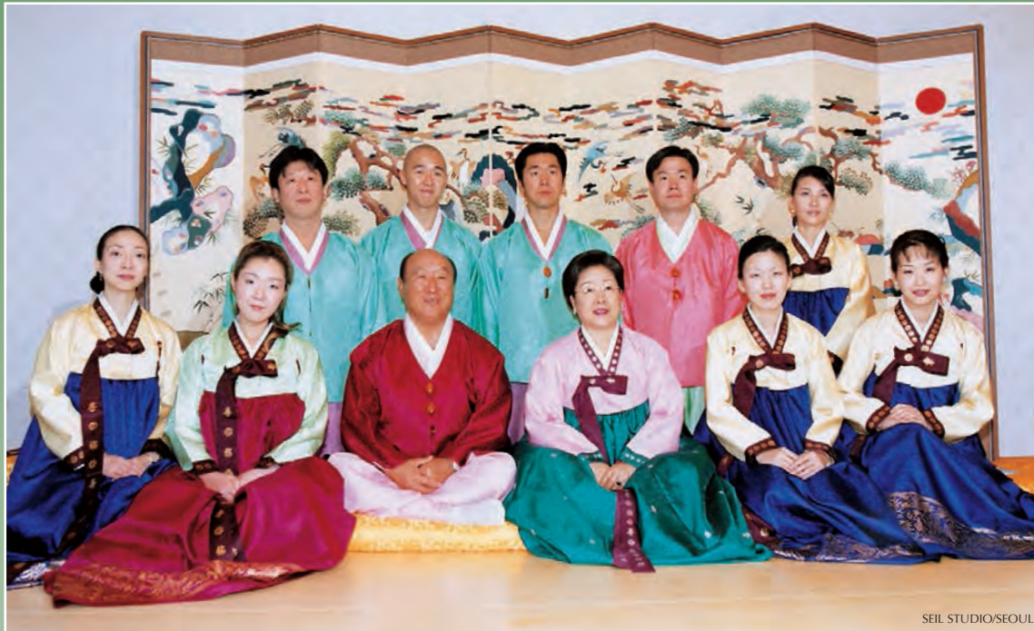
True Family Portrait, True God's Day 2002

It does not matter how many religious scriptures are extant today. The single phrase, "Exist for the sake of others," stands tall above the teachings of all the scriptures.