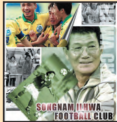
From the Ilhwa Chunma web site

I wish North Korea could have joined this World Cup as a step toward peace and unification. Through the World Cup, Korea can become better known to foreign countries, and it is important for our economic development. I had hoped the World Cup could have been a motivating factor in bringing harmony between South and North, but it didn't happen. I feel sorry for that. In February of 1996, I visited South America