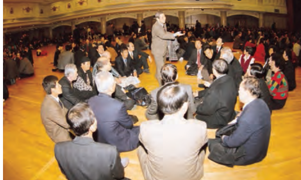
Groups of Ambassadors meet according to clan at the end of the second seminar at Cheong Pyeong

Read TODAY'S WORLD for a global view of the movement and insight into God's providence as it unfolds. Subscription information and contact details on page 3.