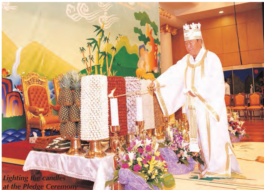
Lighting the candles at the Pledge Ceremony

We lost the tradition of becoming filial children and patri-