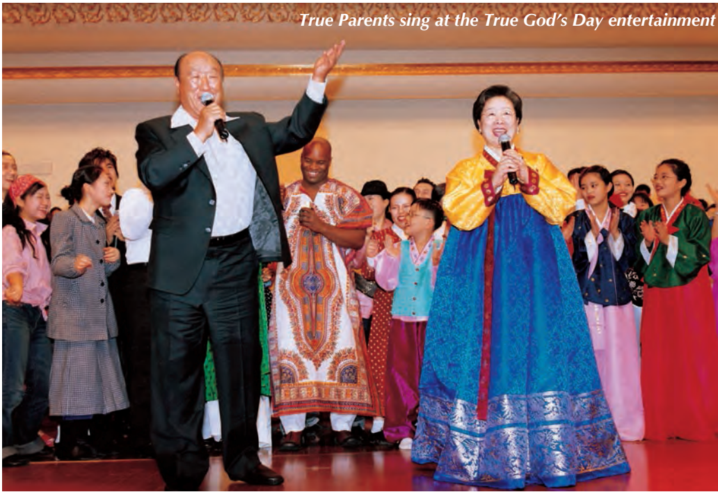
True Parents sing at the True God's Day entertainment

front of the sun. Your couples and your families must settle like that.