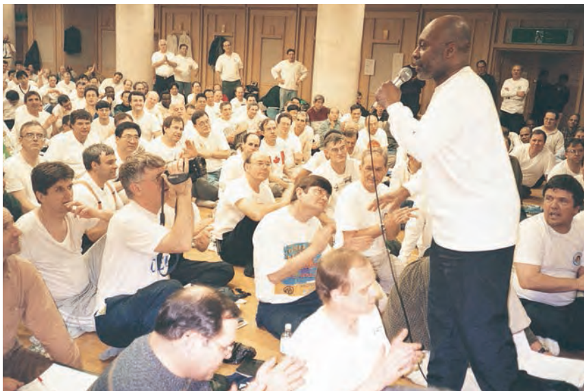
STEAN DIS LAURIERS

In the place of God, Satan took charge of the eternal foundation for human well-being, and became the king of thieves. I collared Satan and kicked him into hell. Wherever I go, whether to nations or to the world, everything has been burnt away and nothing is left. There, I am planting the seed that