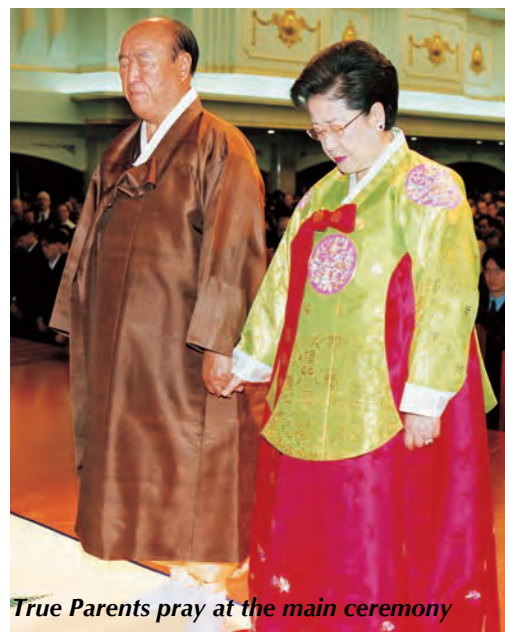
True Parents pray at the main ceremony