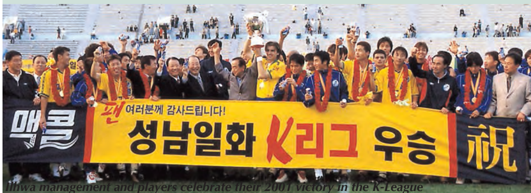
Ilhwa management and players celebrate their 2001 victory in the K-League