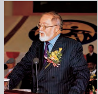
Sir James Mancham Congratulatory Speech