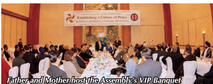
Father and Mother host the Assembly's VIP Banquet