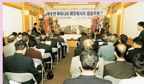
HISTORY COMMITTEE ARCHIVES