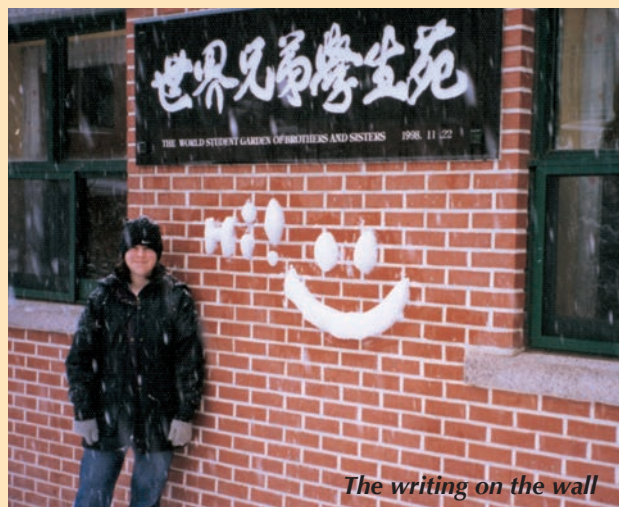
The writing on the wall