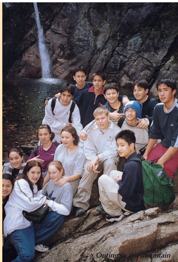
Outing to the mountain