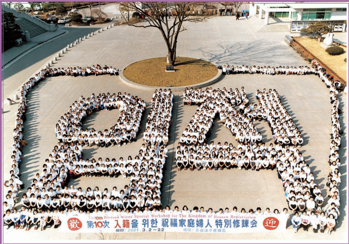
The graduates from the tenth registration 21-day workshop spell out the word “ipjeok” (registration of the family). Registration workshops are scheduled to continue at Cheong Pyeong until the summer.

Just prior to this We Will Stand rally, on an inspiration from God, I fasted for three days. Since the conclusion of the rally, I’m more persuaded than ever of the fact that Father and Mother Moon are indeed the True Parents of all humanity. As Father Moon addressed the audience this time, I was so moved by the conviction he has, and I so enjoyed the humor he displayed. After his speech, as he and Mother Moon stood side by side on the stage, their position as the True Parents was so clear to me. I was overwhelmed by a strong feeling of contentment.