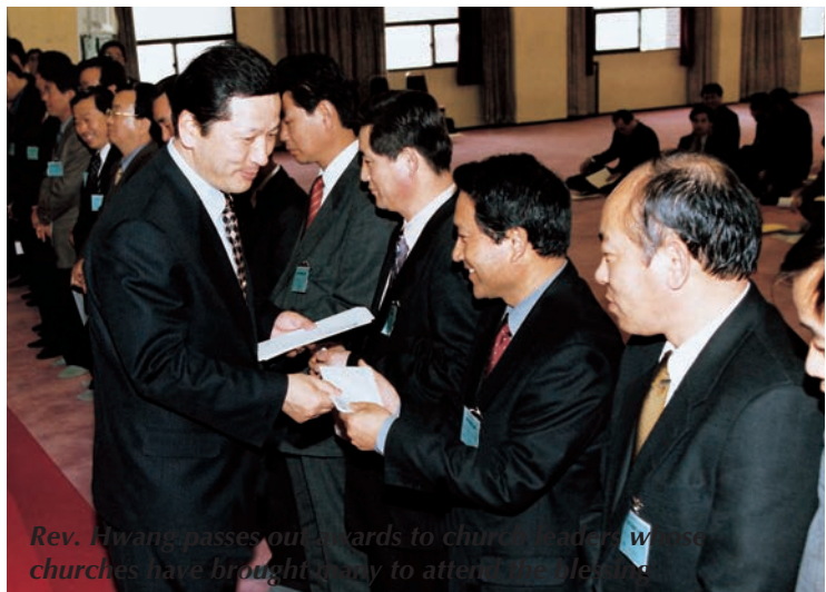
Rev. Hwang passes out cards to church leaders whose churches have brought a way to attend the settlement age.

True Parents are asking us to do exactly the same. As Jesus asked his disciples to make disciples of all nations, True Parents also have asked us to make children of our nations. As Jesus asked his disciples to baptize their disciples, True Parents have asked us