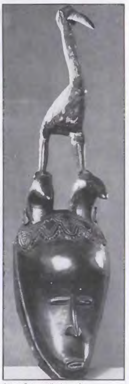
Ivory Coast tribal mask.