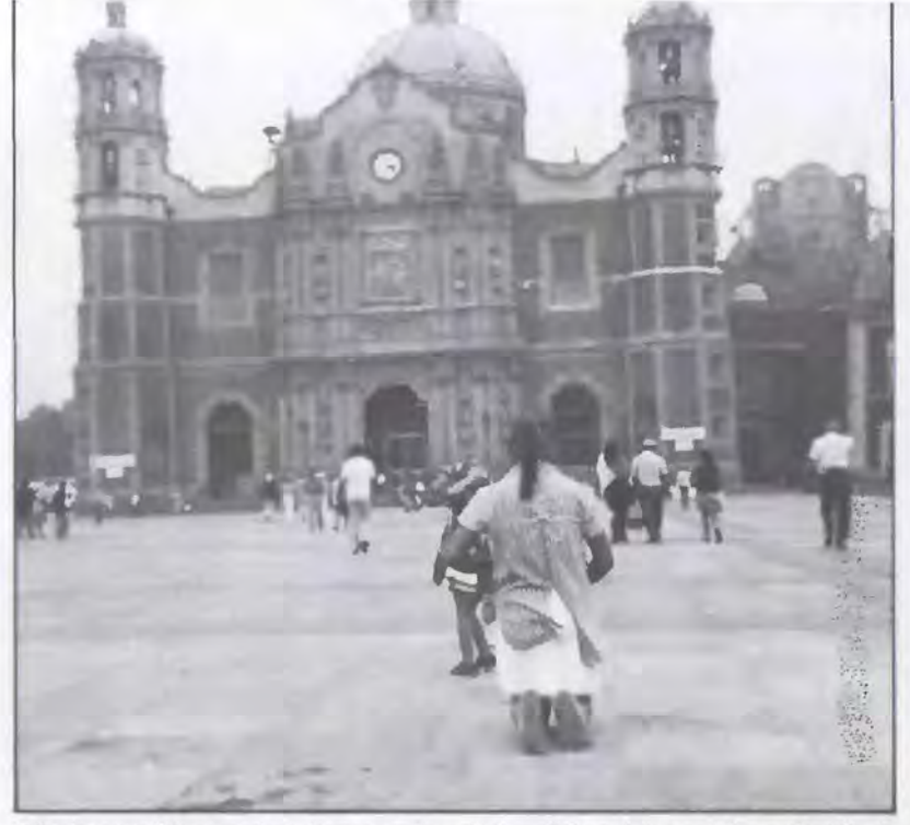
Pilgrims walking on their knees to the shrine of Guadalupe, where the Virgin Mary appeared.

always lush green. The hills are conical, volcanic in origin, with lots of cattle of Brahmin descent. Intermingled with the corn fields are banana plants and coconut palms. Instead of constructing fences, the people plant rows of trees close together and string barbed wire along the trees. The food is better than in Mexico City, where it is so polluted.