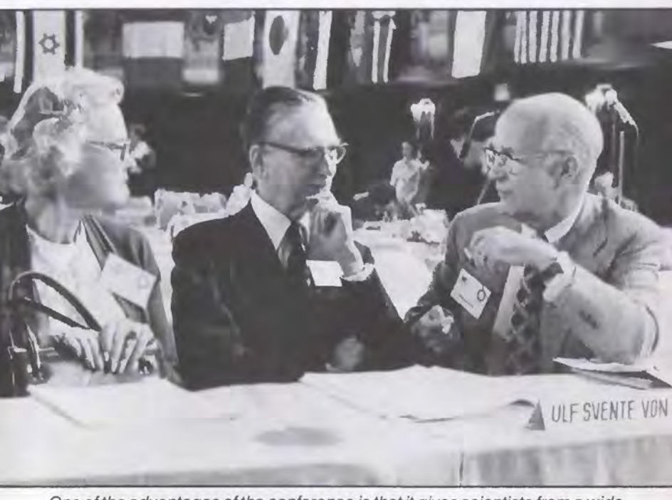
One of the advantages of the conference is that it gives scientists from a wide variety of fields an opportunity to exchange ideas.

the needs of society. The society being problem-oriented is interdisciplinary. The university, in becoming more valid must tend to unify its disciplines, particularly in its sciences."