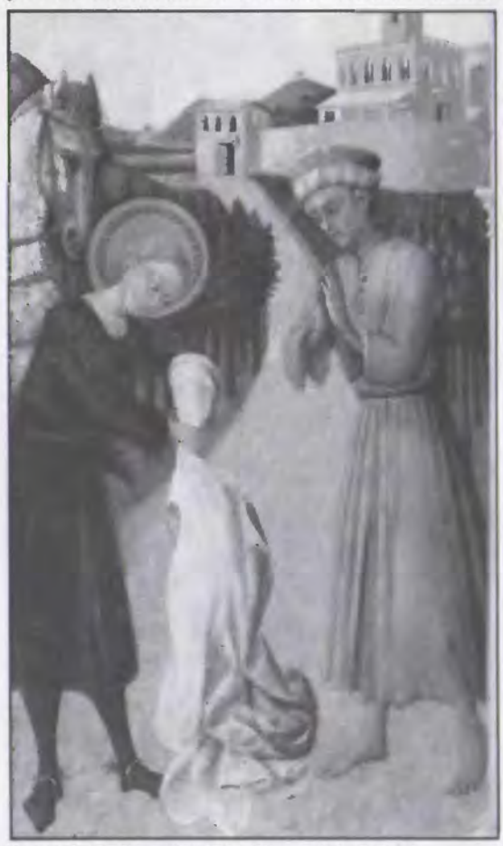
If you serve other people at the cost of your life, this is the secret of unifying yourself.

way? (Serving others.) This is because Satan is always getting hold of our body. It is a universal principle that when you serve other people, you are in a position of being far better off than Satan, so he must leave you alone. This is because Satan is self-centered. Satan is already guiding and undermining you on your fleshly side. So, if you want to leave him or have him separated from you, just be nonchalant to him and become faithful to