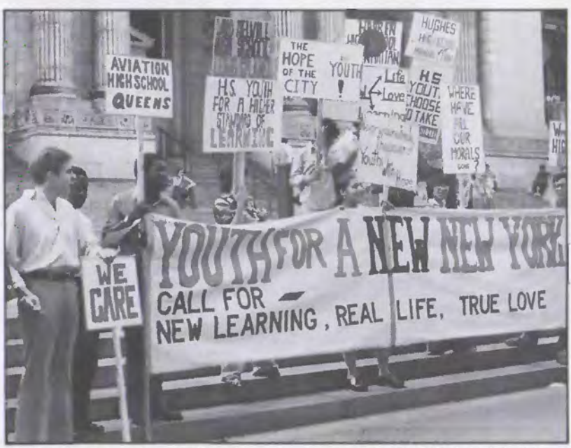
High school members held rally on the steps of the New York Public Library last summer and drew many supporters.