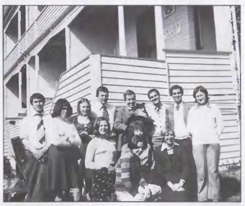
Auckland Family in front of their home.

Much activity has been going on in Auckland this month. We have established a fulltime selling team there of 15 members. The team has been selling small bags of peanuts and raisins with church fliers attached. It has been tremendous fun because it has been a real pioneer mission for New Zealand. When we heard about our selling mission in Auckland we put our heads down and charged. From early in the morning until sometimes midnight we sold to the people. Through this life we came very close to each other. In selling you really learn what dying for each other means. It is only when