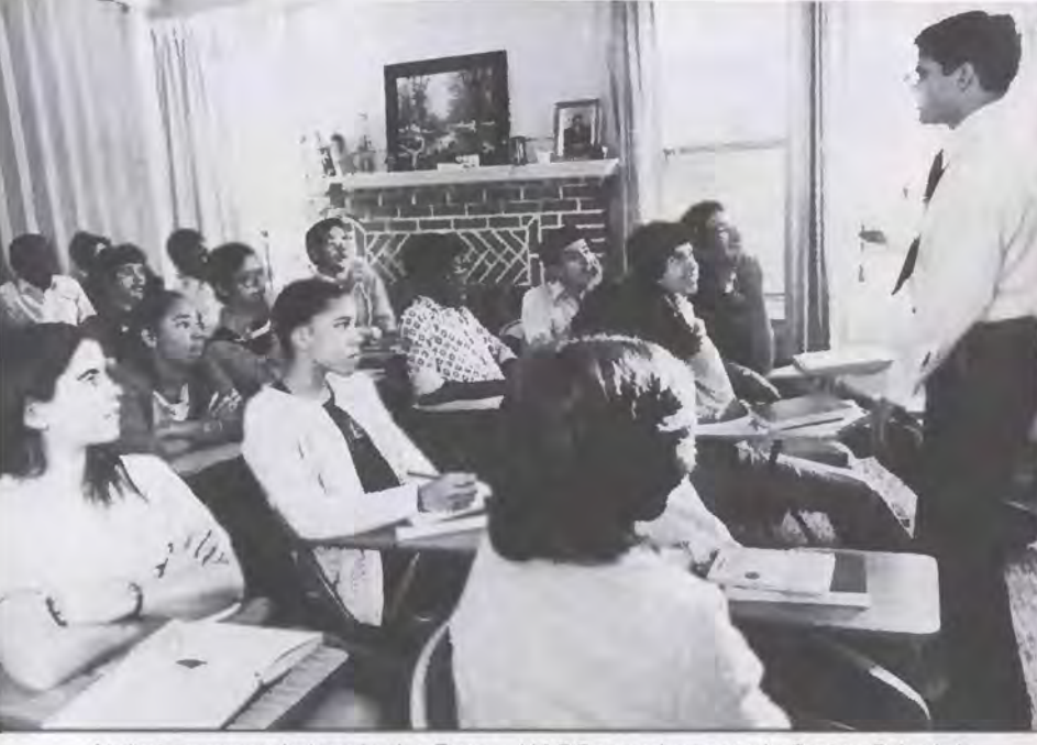
At their own workshop in the Bronx, HARP members study Divine Principle and its application in their lives.

time for a guest speaker, for studying the Divine Principle or Korean (one member is half-Korean), planning weekend activities or formation of HARP chapters.