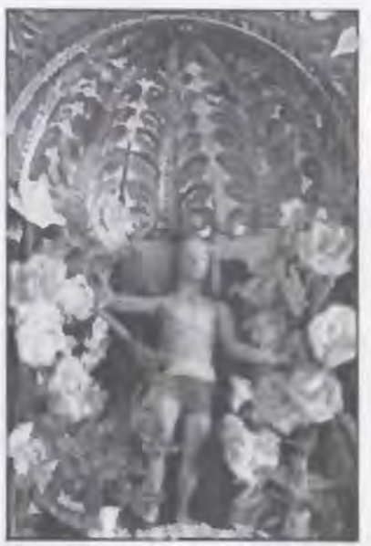
The Catholic Church in El Salvador has become a symbol of decadence and prohibition, so the people are seeking something in which to place their hope.

We've begun a home program of two or three introductory sessions, stressing the ideas of service, sacrifice, and urgency. There are so many pure and innocent people here. The Catholic Church has become nothing more than a white-washed sepulchre and symbol of convention and prohibition. Since it is no longer a tool of God