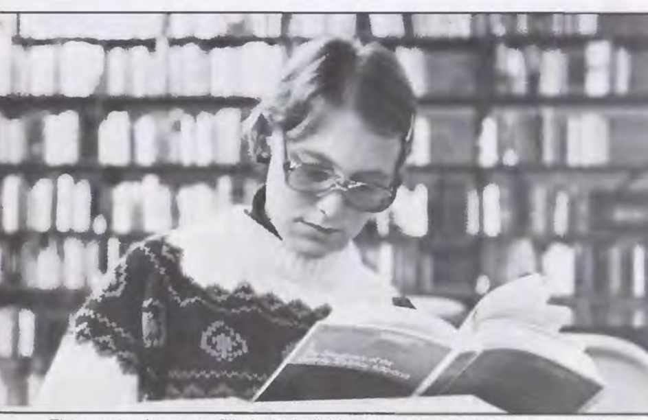
The evening hours are filled with individual and group study sessions in the library, student lounge, or dormitory rooms.