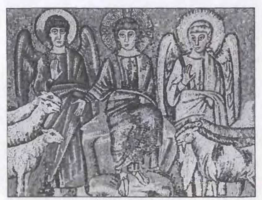
Sixth century mosaic depicts Christ in judgment separating the sheep from the goats.

Christ's message, but no one has been able to provide a complete explanation of the contradiction between Christ's teachings concerning the imminence of the kingdom and the failure of such a kingdom to materialize.