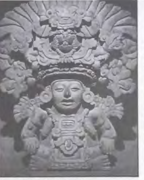
Mayan maize god.

We visited the famous Museum of Anthropology here. The museum shows the external developments of the Aztecs, Teotihuacans, Mayans, Chichimecas, Mexicans, etc., but does not show the development of heart. This was the mission of Catholicism.