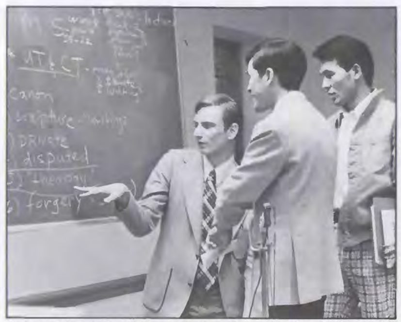
Unification Theological Seminary students linger after class to discuss that day's lecture on the canonization of the Bible.

in the Bible? What are the merits of limiting the canon or broadening it? To what extent are religious movements defined by what they accept into their canon?