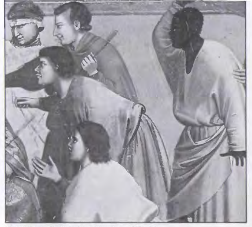
Detail from Giotto's The Mocking of Christ.

lieved that Christ would come in a supernatural way from the sky. Thus, when Jesus, a humble man, appeared in the flesh few could believe in him and all but a few rejected him.