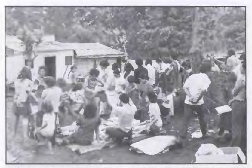
Rummage sale held to help the people of the turgurio. Items are sold to discourage them from being resold.