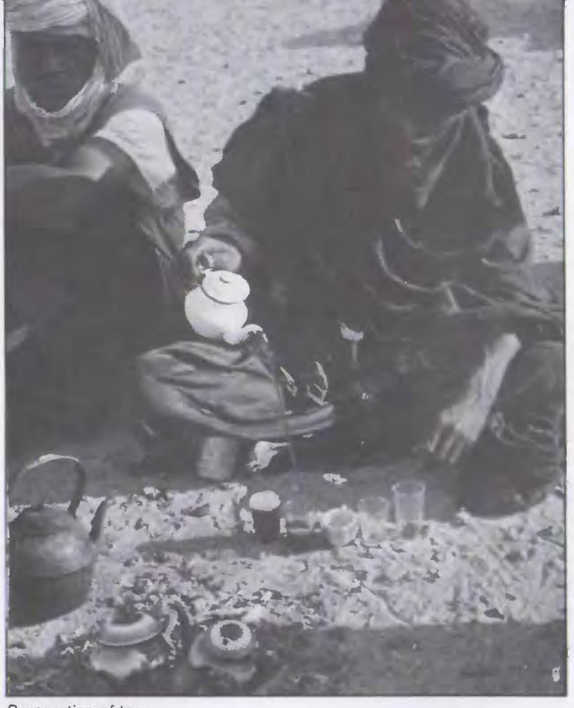
Preparation of tea.

"boom town" effect of cramming a country from the twelfth century into the twentieth. Like the Indians (or some of them) in the West, they become drunkards on the firewater of progress, when they could partake of it in degrees that would benefit all. The result is a vast gap in Mauritanian society.