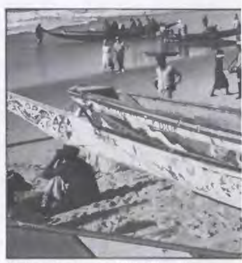
Fishing is a source of livelihood on the West African coast.

The workshops with the bishop went fine. Nine elders plus the bishop attended most of the sessions and received everything favorably. We're now planning a 21-day seminar for February which