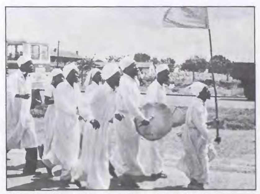
African Israel Church Ninevah on way to worship in Kenya.

There is a wide spectrum of religious belief and practice represented here, including Islam, all forms of Christianity, Hinduism, and the Hare Krishna movement, and there is an official policy of religious freedom.