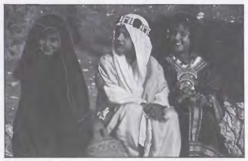
Children of the desert.

The medical doctor has totally accepted Principle. He is really a special person, so deeply prepared by Heavenly Father for many years. Spirit world is working here in the most amazing of ways. Every person we are seriously working with has a common phenomenon—after hearing even the first chapter they can't sleep all