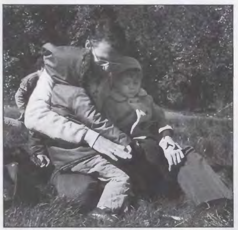
Did you know God from the day you were born? Why do we need the Messiah, Christ, if not to teach us about God? We are born into ignorance and pass it on to our children.