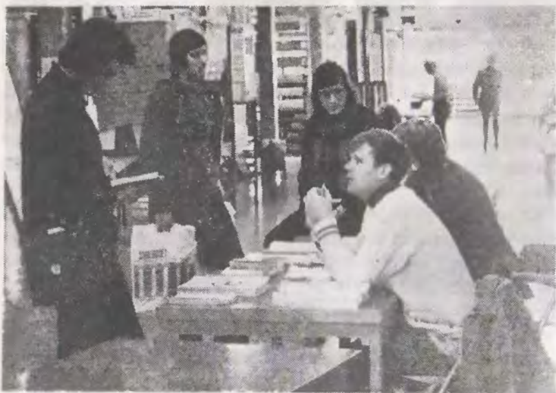
Norway Family table on Campus.

We hope and pray that we will succeed to use all these wonderful possibilities to speed up the restoration work in this country and with this to give joy to our Heavenly Father.