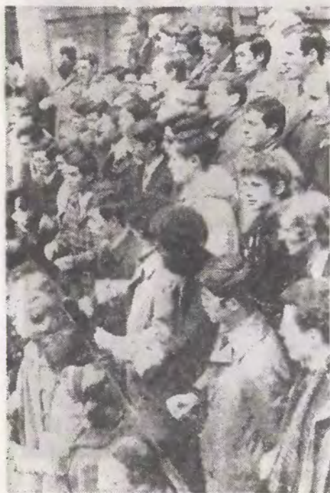
Japanese, European, and American Family members at New York rally.