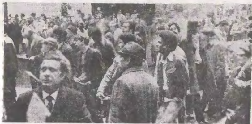
New Yorkers watching the rally. An estimated 10,000 stopped to listen.