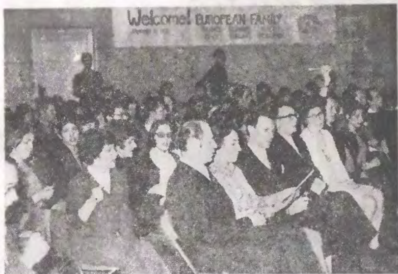
European trainees at Belvedere.