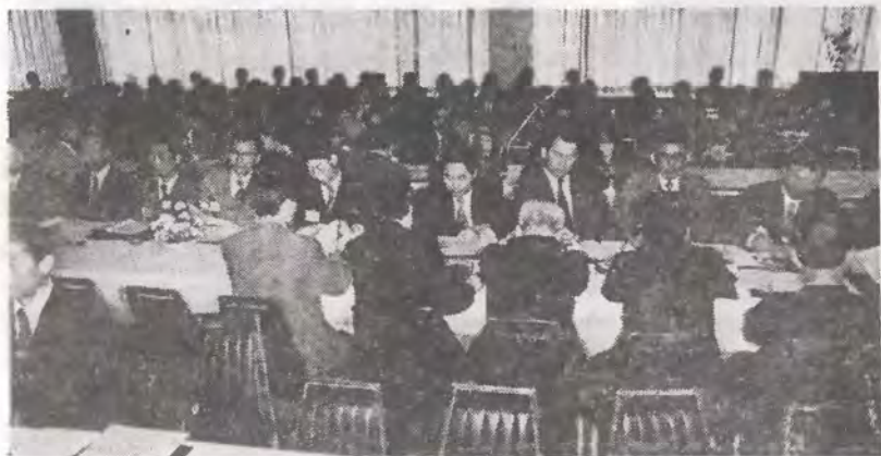
Professors study text of PWPA constitution and prospectus.