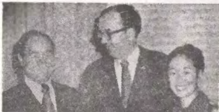
With Senator Jesse Helms.