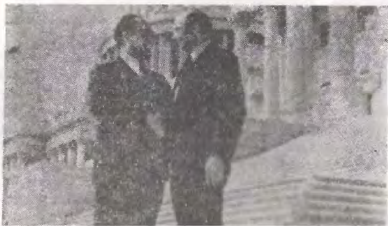
On Capitol steps with Sen. Strom Thurmond. S. Carolina.