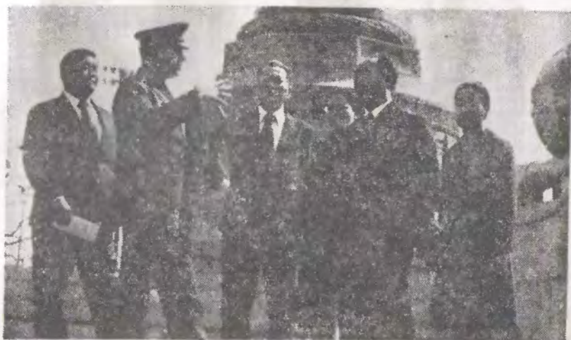
Our Leader and his party on a tour of the West Point Military Academy near Belvedere.