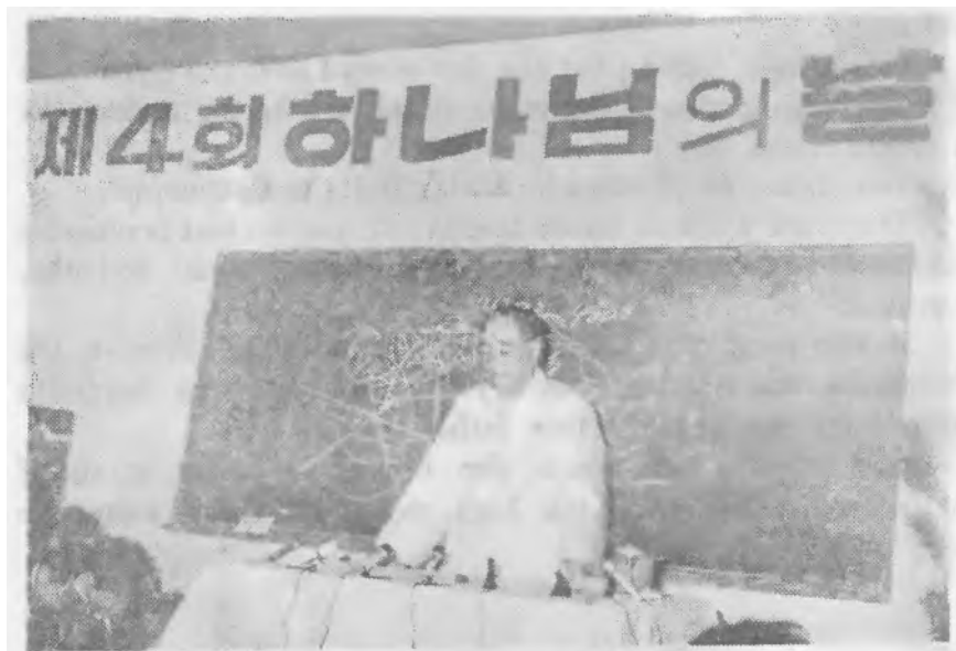
Master's prayer for The God's Day at Seoul Church

At the beginning of the New Year, I sincerely hope and advise you to do your best in following the way to loyalty and filial piety to God and God be with you.