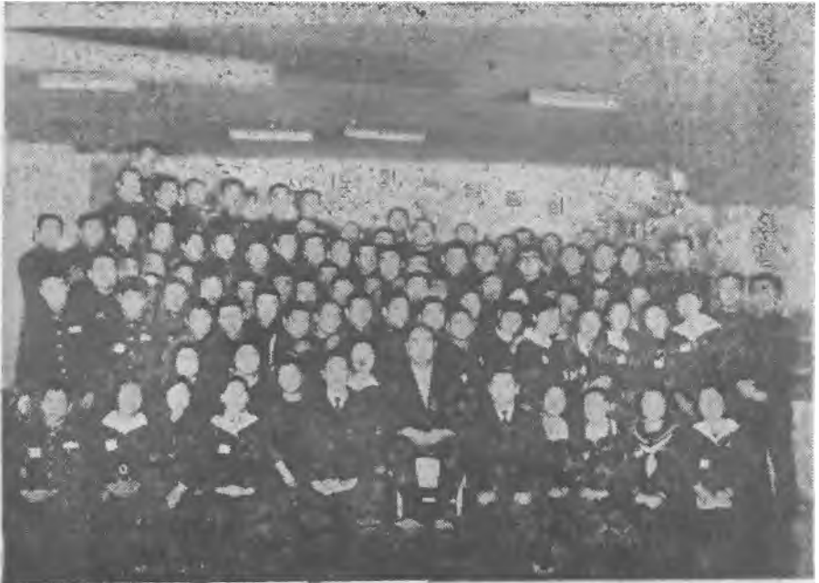
16th Sung Who Student members

They had all night recreation after the ceremony.