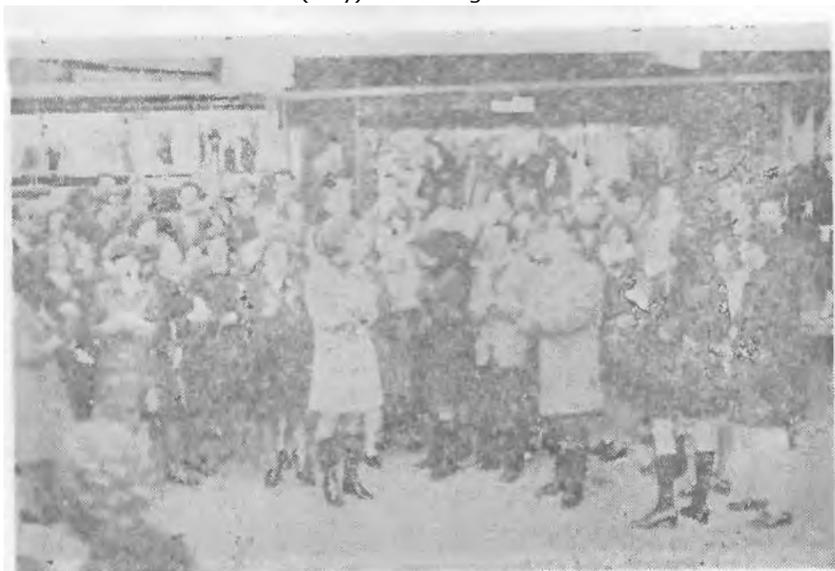
International Witnessing Ketwigstrasse "A Cloud of Witnesses"