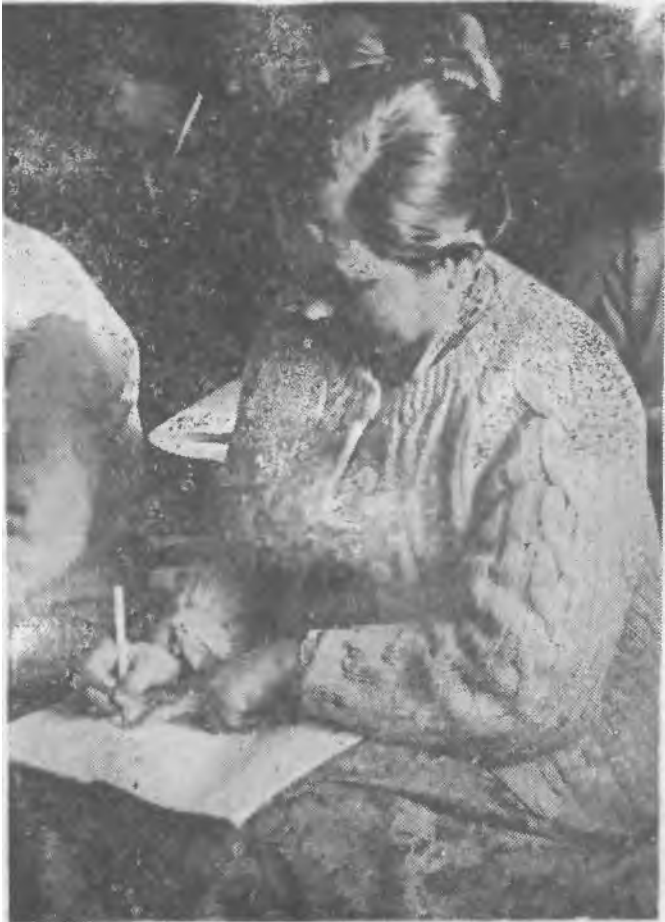
A mobilized woman member of blessed family

During the period between December 20th, 1970 and January 30th, 1971, All other family members, than blessed family members already mobilized for propagation till the end of 1970 started for propagation into the country, at all hazards.