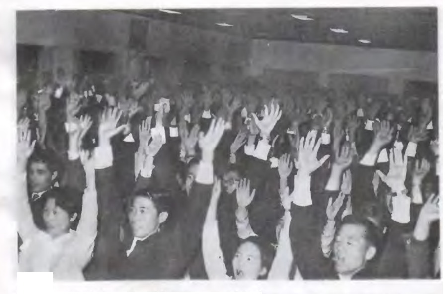
Cheering of "Mansei" (Japanes. members)