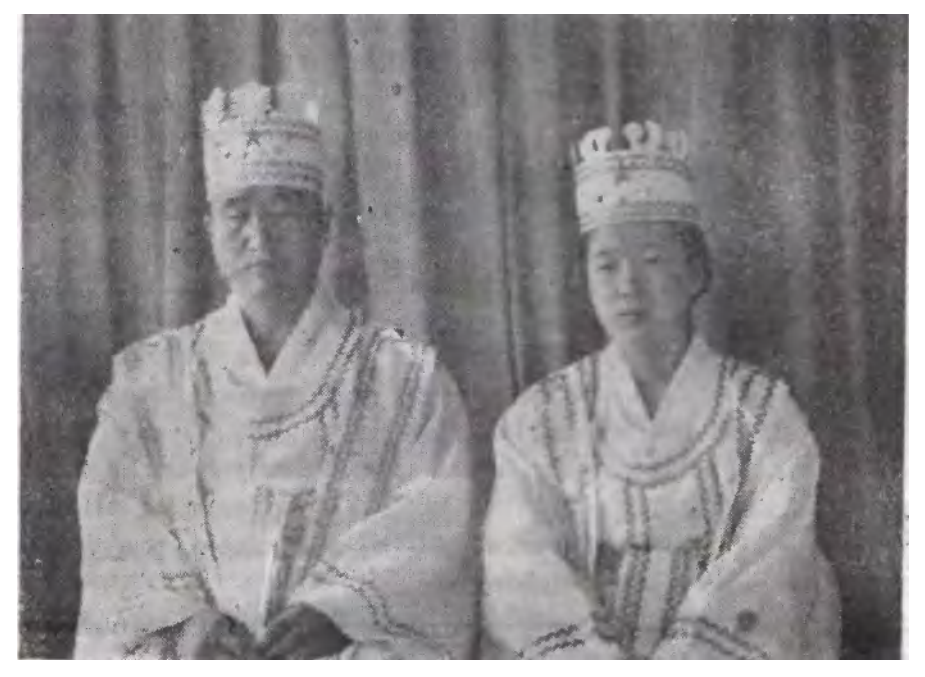
True Parents in Children's Day

At 7:00 a.m. on October lst(in lunar calendar), 1970 there was an observance of 11th Children's Day at Seoul Church with the presence of district leaders, blessed families and other family members from the entire country.