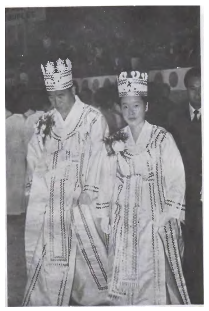
Entering of officiators (True Parents) for the ceremony.