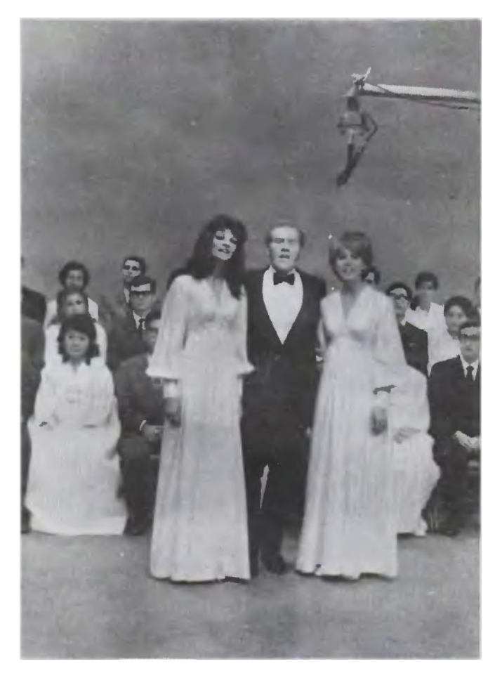
Three singers from Las Vegas Unified Church (MBC TV).