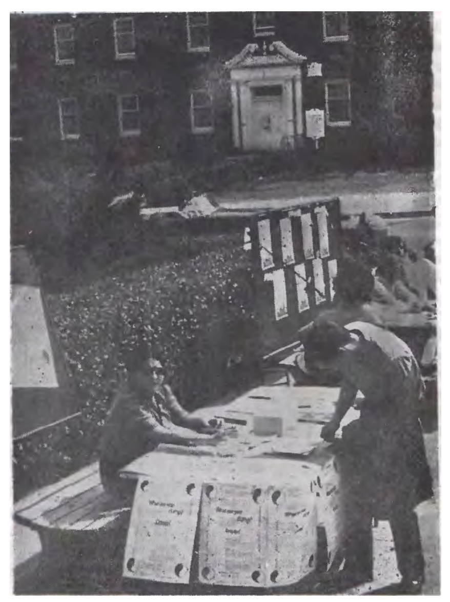
Contacting students in campus