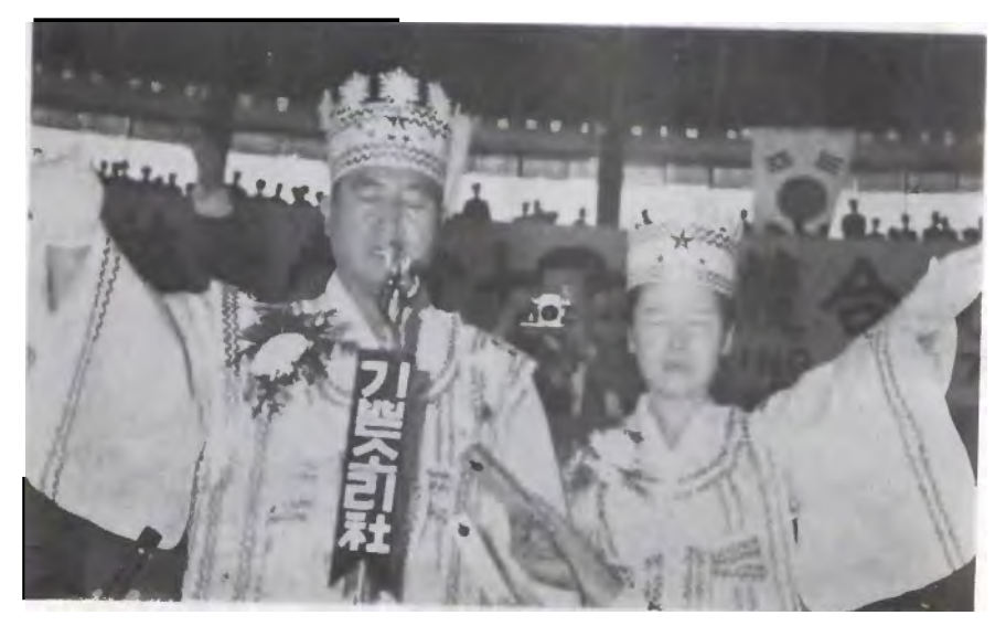
Celebrating prayer o the Officiators (True Parents)