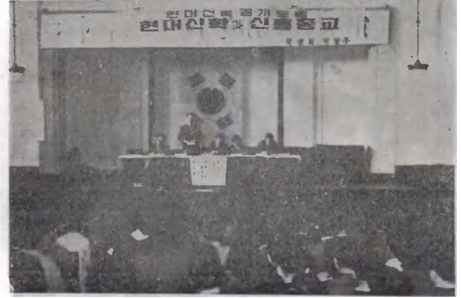
A scene of theoretical forum at Seoul National University

At 4:p.m. on October 28th, 1970 there opened a theoretical forum on the subject "Modern theology and new religions" at the auditorium of the college of science and five arts, Seoul National University as a part of autumnal school festival, of the University under the joint auspieces of the Catholic's Studc:.ts Association, the society for comparative Religious Studies and Korean Collegiate Association for Research of Principles.