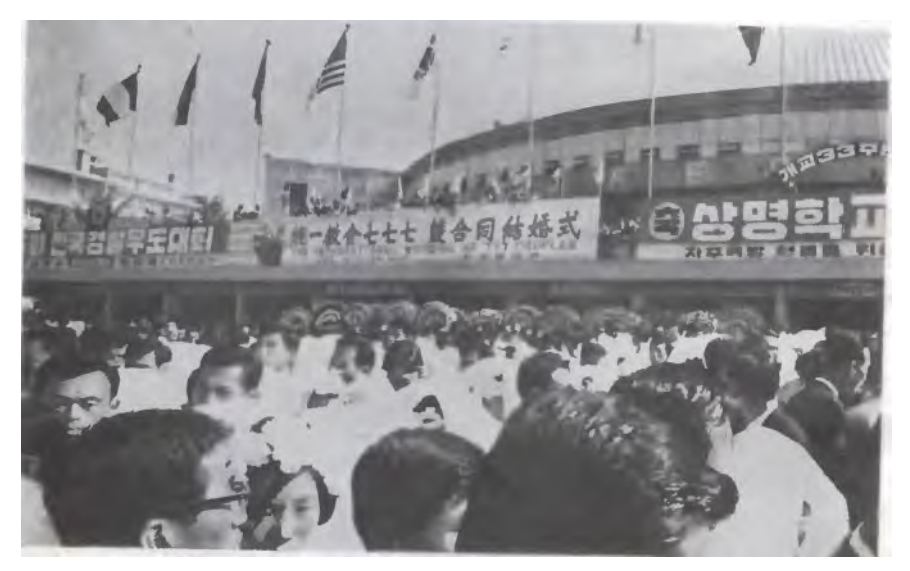
Couples leaving after the ceremony.