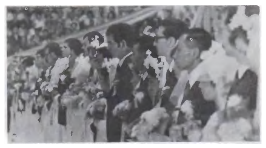
The first rank couples of the International Wedding of 777 Couples.