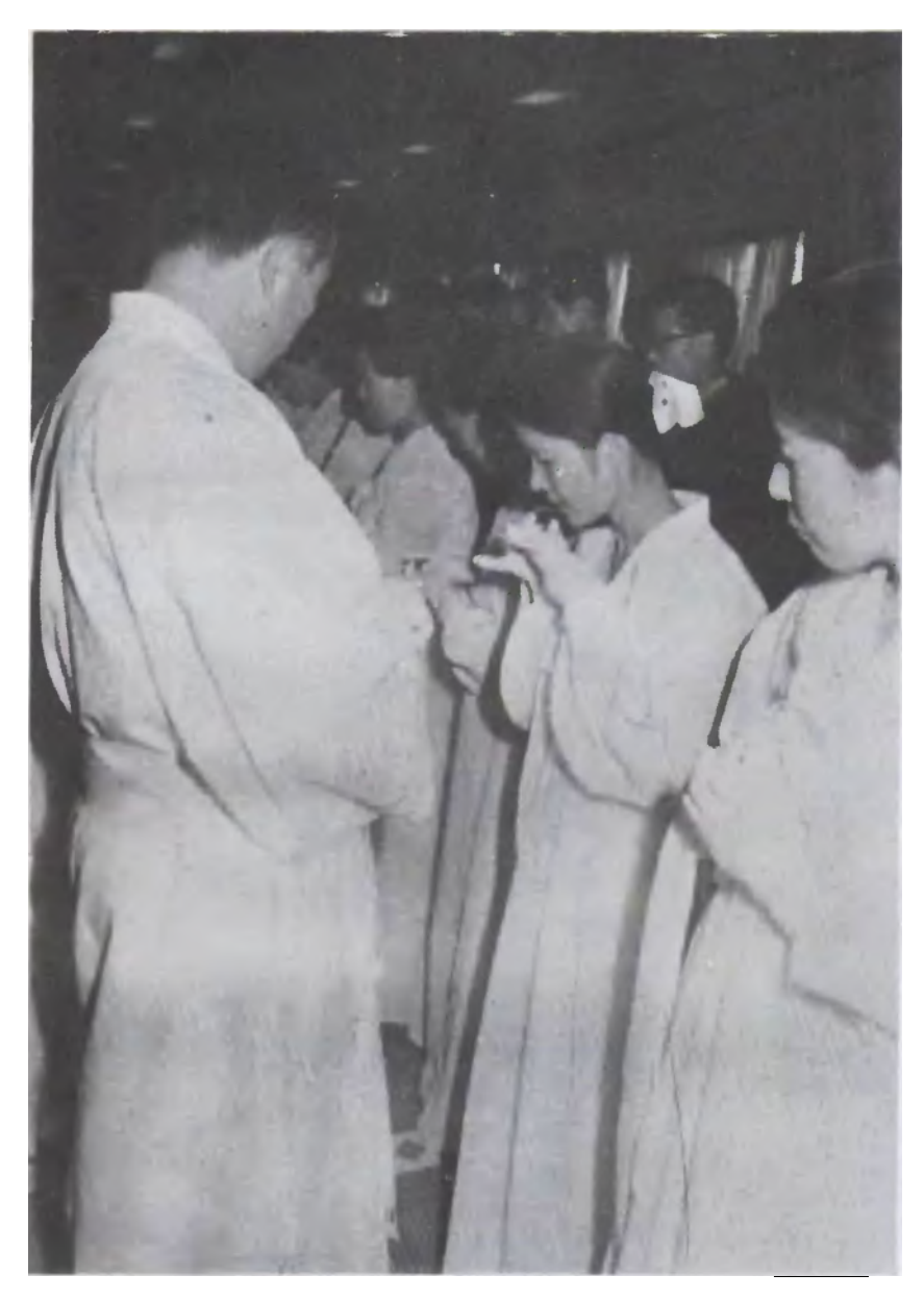
Holy Wine ceremony for Japanese members.