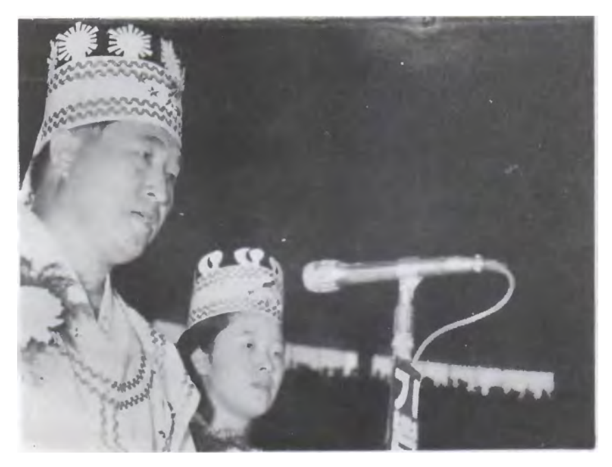
A scene of "qustions and answers"