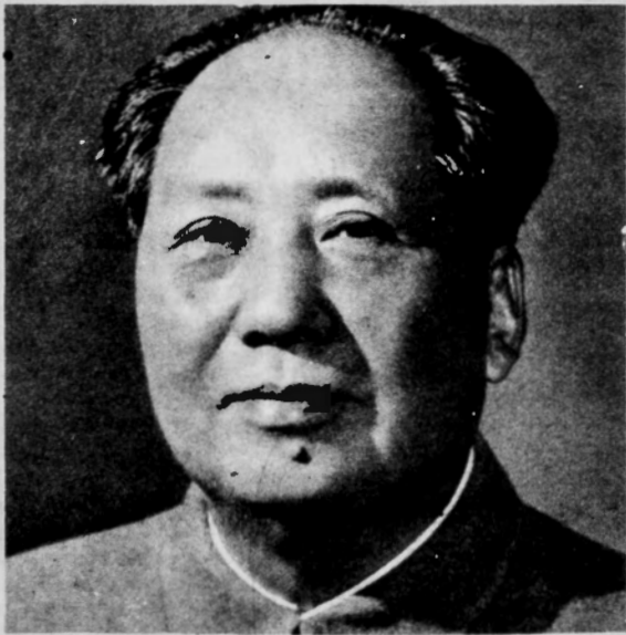
MAO... "Without contradiction, nothing would exist."

Secondly, we must ask why is it necessary for Mao to deceive (either himself or others). If we realize that Mao and all Marxist-