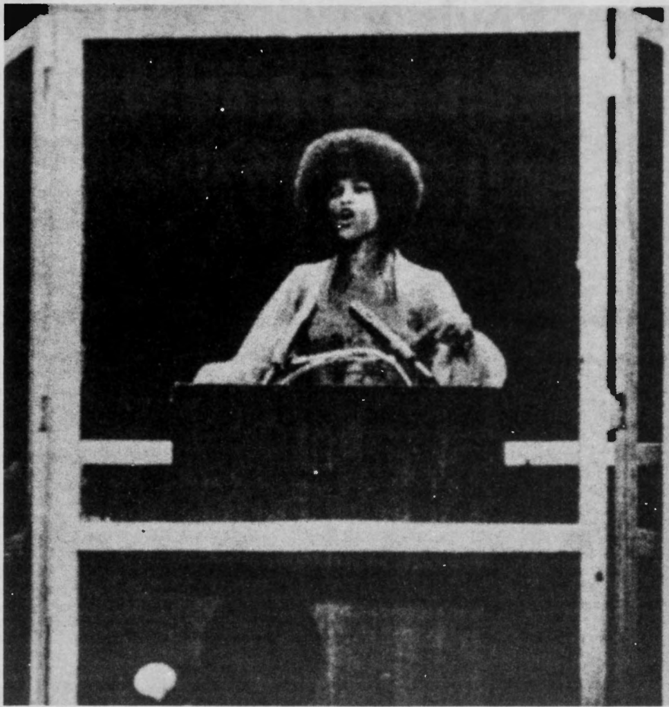
Angela Davis speaking from protective cage in New York.

From our perspective, such parapsychological research SHOULD be conducted, but NOT with a view towards controlling men's minds. Rather, its goal should be to prove and understand scientifically the spiritual nature of man, thus exposing the bankruptcy of the outdated Marxist-materialist dogma. It is ironic that the field of psychic research - already well accepted in the Soviet Union - - still must overcome great skepticism in the U.S. If the Communists successfully pioneer the field and apply their discoveries to a strategy of conquest, we will not only face the possibility of our own enslavement - - we will have missed a chance to liberate the enslaved peoples of the world through the truth we may have discovered.