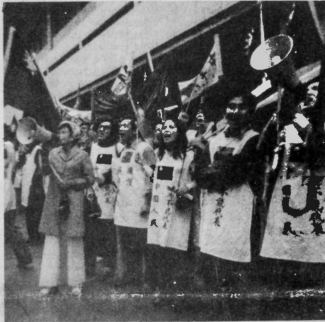
Chinese students and FLF members (left) demonstrate in front of Communist Chinese U.N. Mission. Press gave the event minimal coverage.

NEW YORK. More than 2,000 Chinese and American people of all ages rallied here September 30 to urge the reinstatement of Nationalist China in the U.N. and to protest the recent Japan-Red China agreement in which Japanese Prime Minister Tanaka said his country "understands and respects" the Communist claim over Taiwan. Beginning a block from the U.N. Building on New York's East 42 Street, the rally moved first to the Japanese Consulate and then to the Red Chinese mission to the U.S., where demonstrators made a plea to families of Red Chinese diplomats to defect. Though the rally was filmed extensively by several network TV film crews, coverage was not carried outside of the New York area.