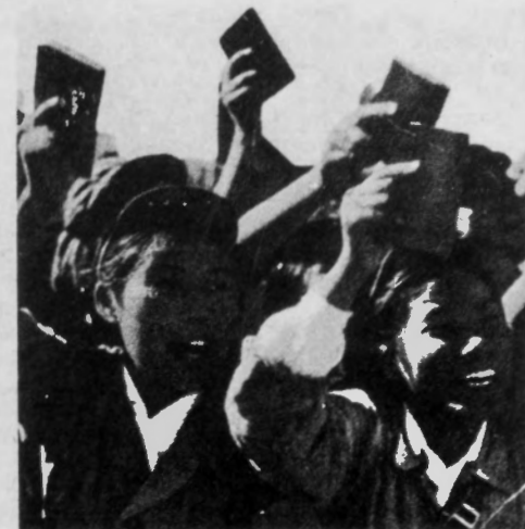
Waving Mao's thoughts. The superficial unity enforced after the Cultural Revolution is already beginning to crumble.

However these dissatisfied young people are doing more than just fleeing Mao's "paradise." Reports from the mainland indicate that