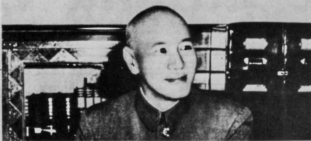
CHIANG KAI-SHEK. He knew the Communists too well to trust them.

Had Chiang listened to President Truman his fate