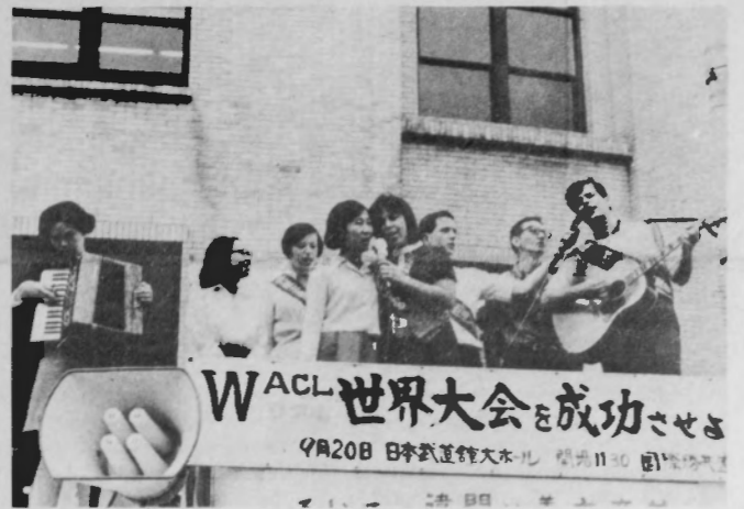
FLF, IFVC members mobilize for 1970 WACL Rally. "Let's join our hands, friends of the earth."

In Japan, where Communism has become much more widespread, the IFVC has launched (see page 7, column 3)