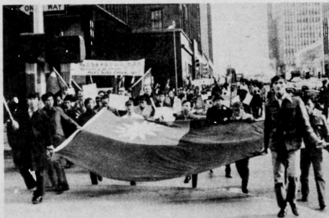
Chinese students march on U.N.