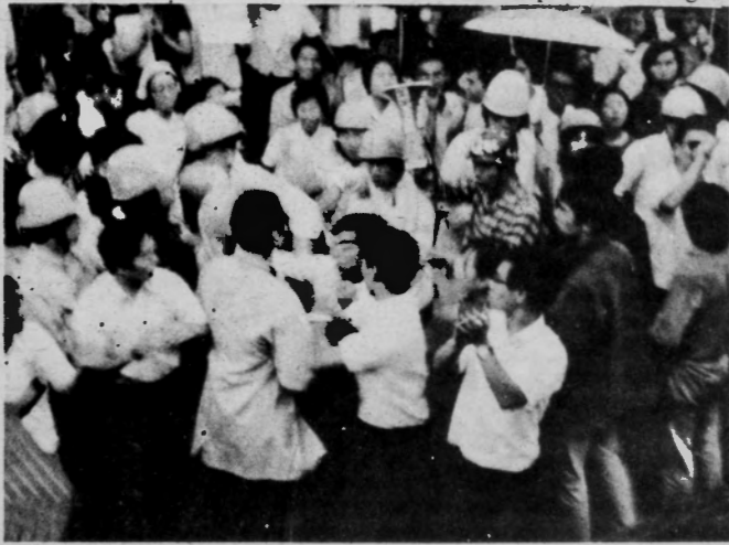
Helmetted Zengakuren respond by attacking IFVC members and bystanders in the crowd.