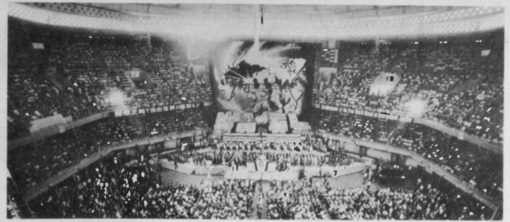
IFVC-organized WACL Rally, Tokyo, 1970. 25,000 attended.

The U.S. Communist Party intends to play a major role in the 1972 elections. "From now until next November," Hall notified members attending the Party's national convention, "this election campaign is the heart of press circulation — of industrial concentration — of Party education and training... Because this campaign is on the front burner, let every member, every leading comrade rearrange all schedules and appointments so that he or she will be on call for the election campaign 24 hours a day."