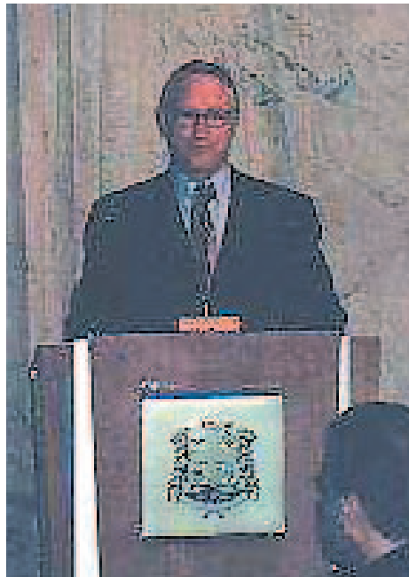
Mr. Gerald Tremblay, Mayor of Montreal, speaking to over 100 religious leaders at Montreal City Hall.