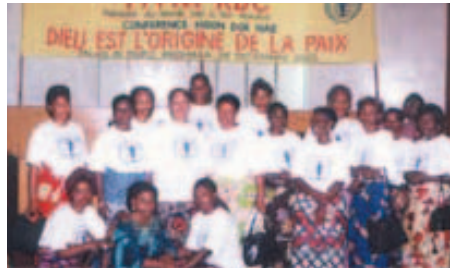
WFWP participated in the conference, "Women's Contribution to the Peace Process in the Great Lakes Region."

July 29-August 7: A 7-day workshop was held in the Palais du Peuple with women agents of the National Service on the theme "Family Ethics and Women's Implication in