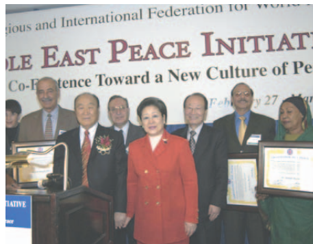
Newly appointed Ambassadors for Peace with the Founders.