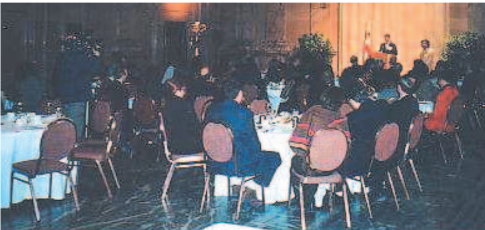
The Interfaith meeting was sponsored by the Union United Church and the Family Federation for World Peace and Unification of Montreal.

The gathering was a tremendous testimony to the power of God in bringing a very diverse group together in a very special church in a very special city. ❄