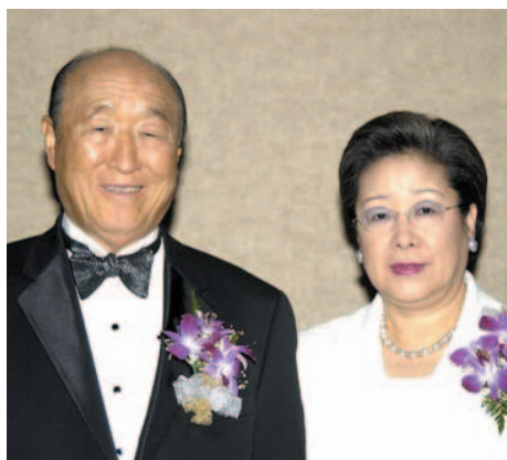
Rev. Dr. & Mrs. Sun Myung Moon.