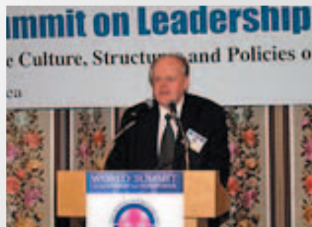
H.E. Stanislav Shushkevich, former president of Belarus.

More than 700 guests attended the Opening Plenary. The reporters interviewed