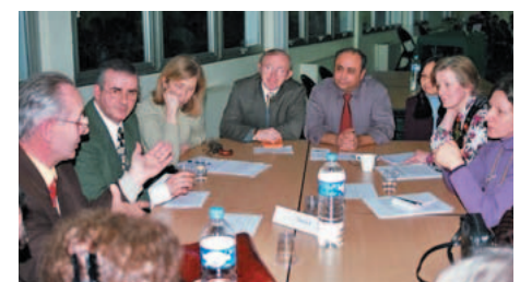
Conference participants during break-out session.

Debates followed at each table. A former Algerian ambassador advocated that France