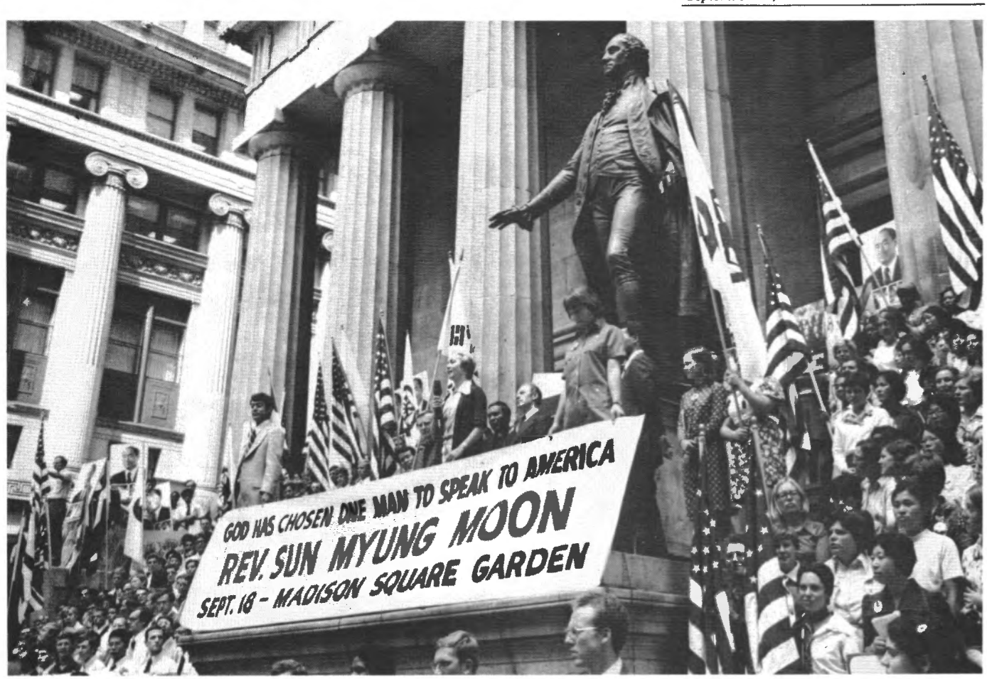
George Washington seems to give his silent blessing to the Wall Street Rally.