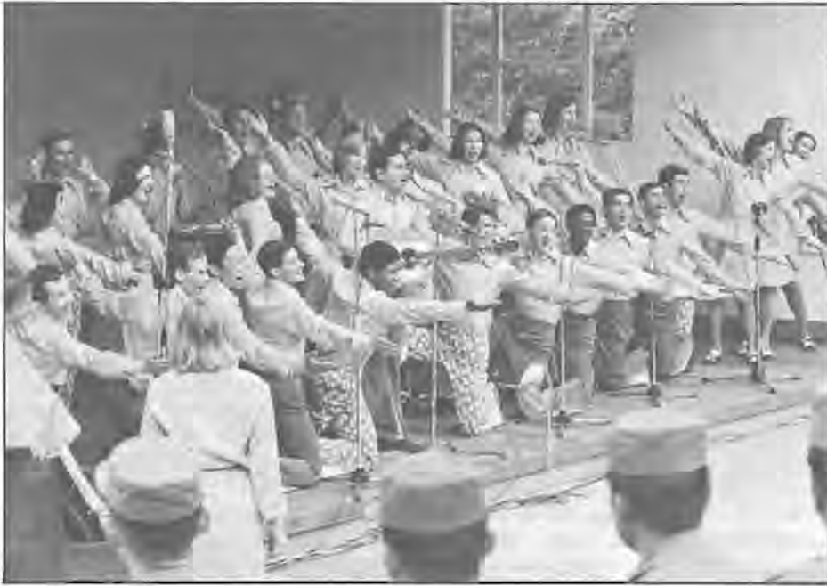
New Hope Singers perform at the DMZ.

cause the principle has been set. Once we awake and realize how we can win, then we will win. If we stand in our own name, the proud name of America, we will never win, no matter how much steel, strategy, and weapons we have. We will become strong when we bring ourselves to be the ambassadors of God.