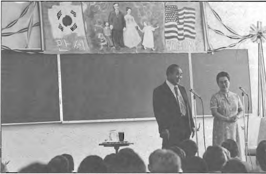
Speaking at Barrytown on the day of his return, July 1st.