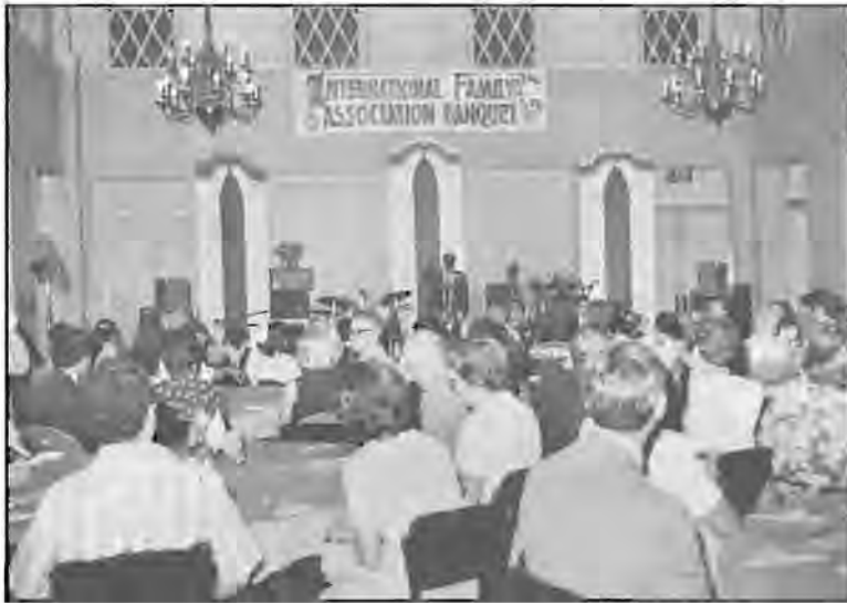
Wesley Samuel presides at IFA banquet in the ballroom of the 43rd St. building.