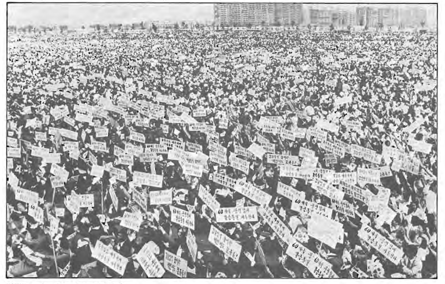
IOWC members located near the platform.

Strategy School about the strategy of Communism as follows: "Communism cannot coexist with capitalism. It is too early to attack (1931), our time will come in 20 or 30 years. We can gain victory only through surprise attack. Let the capitalist world eat well and sleep well by all means. The best way to do this is to initate an absolute peace policy. Knowing nothing, they will enjoy peace and will respond to peace negotiations. In this way the capitalist countries will stupidly cooperate in digging a trap for themselves. We pretend to be their friends and gain time. And while they are relaxing we will deliver a decisive fist of iron. . . . "