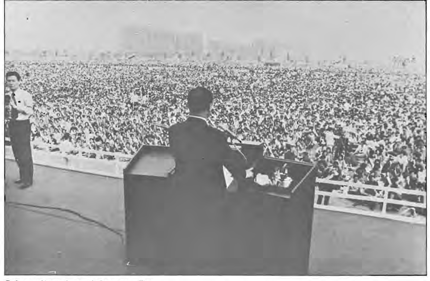
Father speaking to the crowd of over one million.

battlefield of these two worldwide ideologies which are against each other. The protection of Korean freedom is not only for the sake of Korea, but for the sake of the whole free world, and for the defense of eternal freedom, and for bringing to God a final victory. This is the reason why all freedom-loving people of the world should rise up in order to defend Korean freedom.