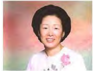
True Mother Hak Ja Han Moon: An Anthology 1 Global Unity through

Beloved world leaders of the Women's Federation for World Peace! I would like to extend my warmest welcome to the leaders and members who have come from various parts of the world to attend the 20th anniversary celebrations of the founding of the Women's Federation for World Peace held in this beautiful Muchangpo, situated on the west coast of Korea. I would also like to return my deepest gratitude and glory to God and Reverend Sun Myung Moon, who is the co-founder of WFWP together with me. The Women's Federation for World Peace was founded in April of 1992 as a central organization of the women's peace movement at the Seoul Olympic Stadium in Jamsil, along with a declaration of the advent of the global era of women, with women representatives from more than 70 nations and 150,000 Korean women leaders attending. It is truly inspiring that this year marks the 20th anniversary of the founding of WFWP.