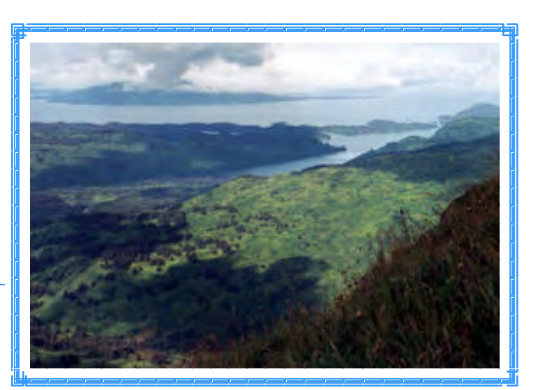
More pictures available online at www.worldcarp.org