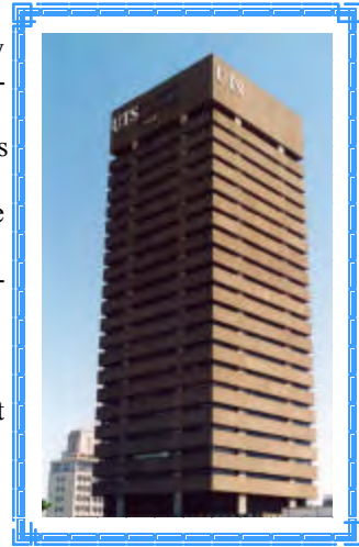
The 'other' UTS

This really encouraged us (being new on campus) and so we built up some courage and ended up with 3 or 4 clubs wan ting to work with us.