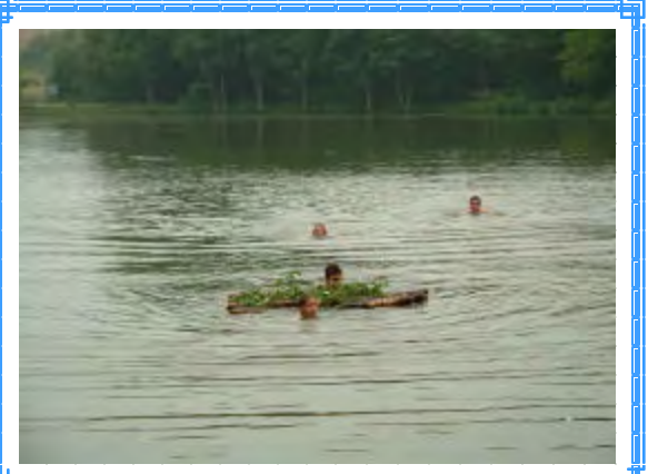
This does look kind of fun, if you survive...