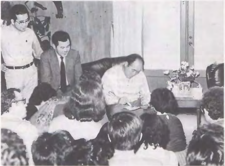
Father signs pictures for blessed wives who fulfilled the CARP condition.