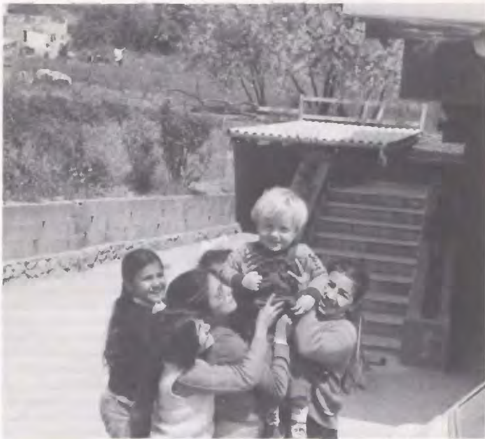
Everyone likes to have Beno play with their children. They are just amazed at this little white child, and call him "snowman."