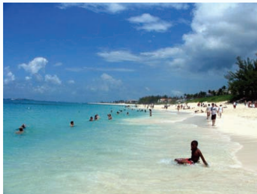
1st Prize: Bahamas 3-Day Trip