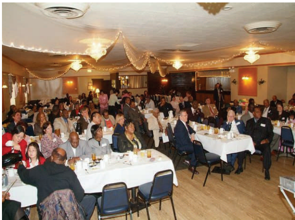
114 clergy and friends gathered at Beverly Woods restaurant at 115th and Western for this month's ACLC prayer breakfast.