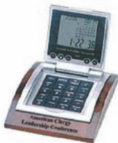
ACLC Table Clock