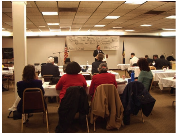
The 5 th Annual MT American Clergy Leadership Conference was sponsored in Billings, Montana at the War Bonnet Inn. 45 clergy and community leaders were in attendance.