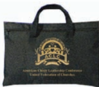
ACLC Hand-Carrying Bag

So brothers and sisters let us unite together as “One Family under God,” as we “Rebuild the Family, Restore the Community and Renew the Nation and the World.” Let us double our ACLC membership in these next 40 days from April 1- May 10.