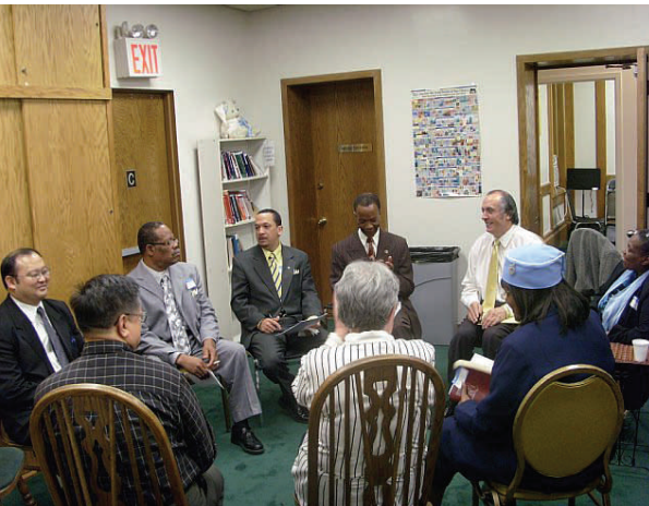
ACLC New York presented one day Divine Principle Seminar. Participants making small groups for discussion.