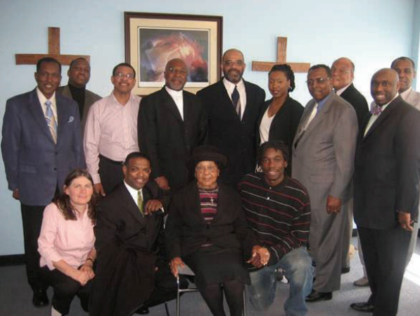
ACLC Co-President Archbishop Stallings (Center on the second line) preached at NC ACLC Prayer Breakfast meeting.