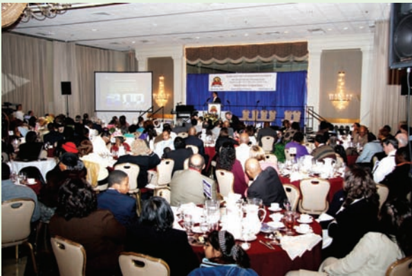
ACLCL 8th Anniversary Spring Celebration at Washington, DC (3/29/08)