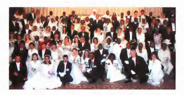
"A man shall leave his father and mother and cleave unto his wife... therefore what God has joined together let no man put asunder."