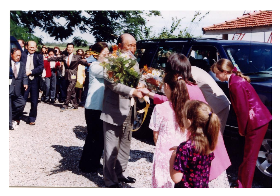
True Parents arrive in Jardim, Brazil