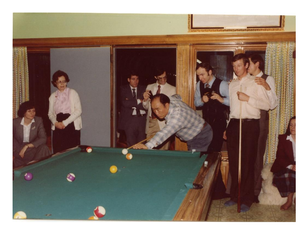
Father goes on to play pool