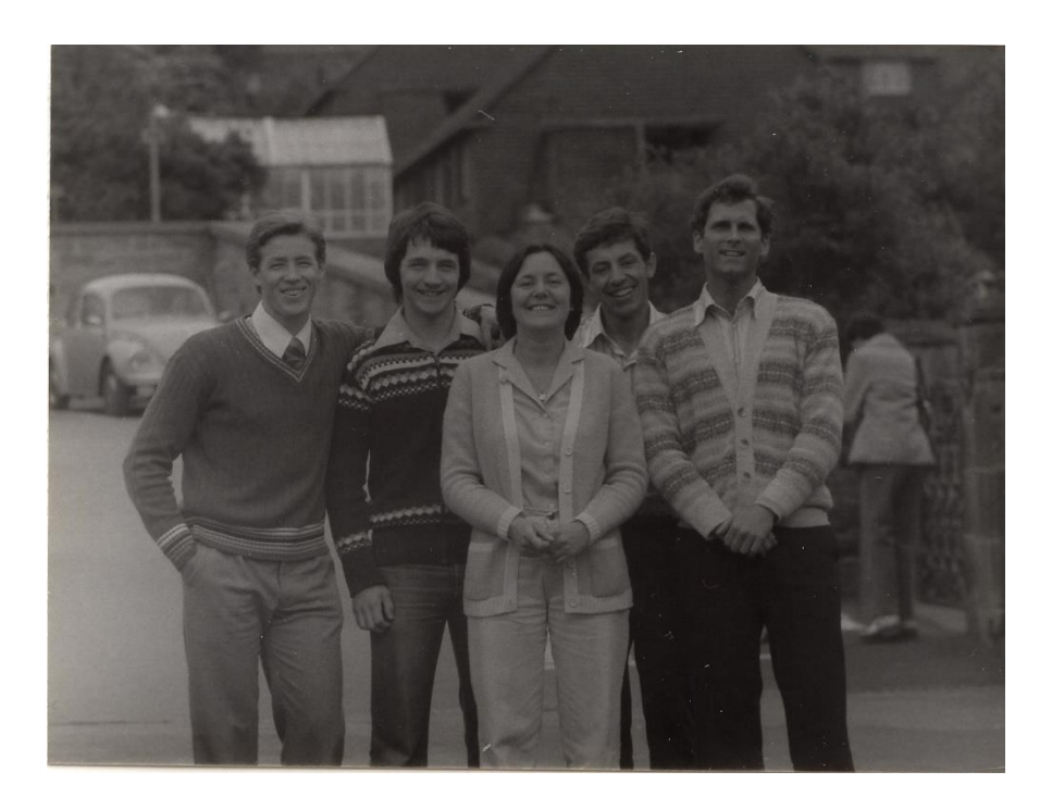
1-1-1 The goal for each person to find one new member each month. With members who joined in Aberdeen