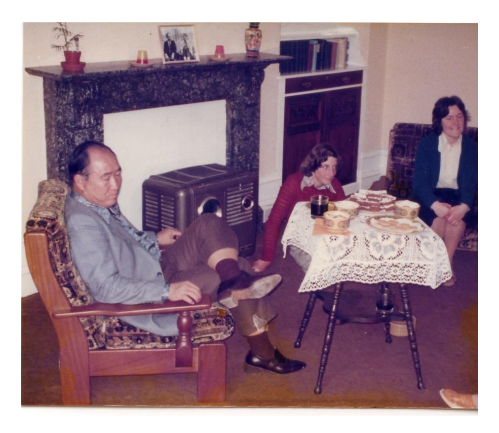
True Father visiting Affleck Street, Aberdeen