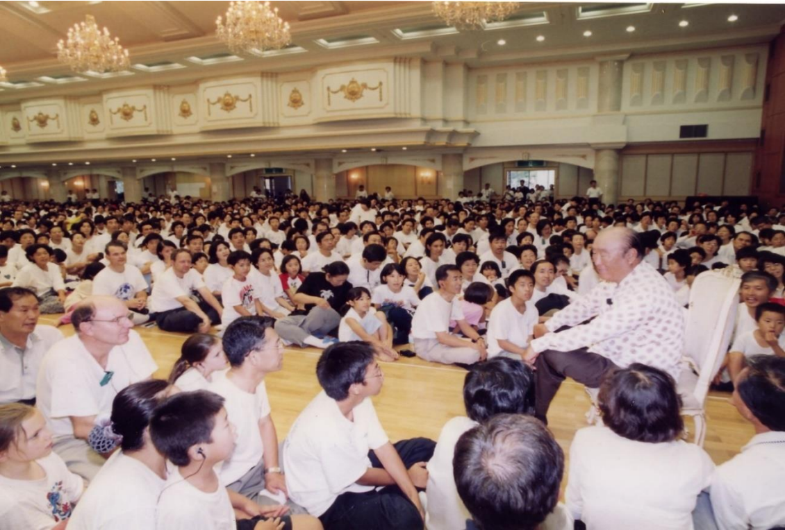
Cheong Pyeong, Korea