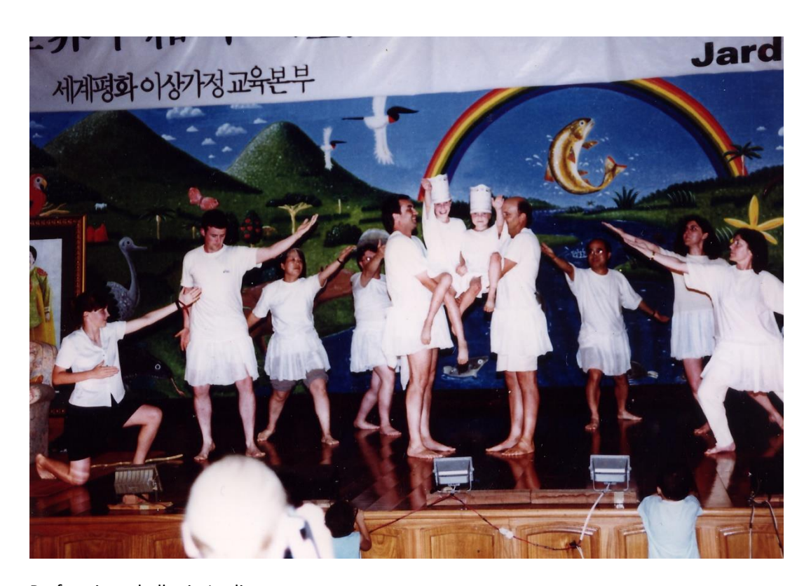
Performing a ballet in Jardim