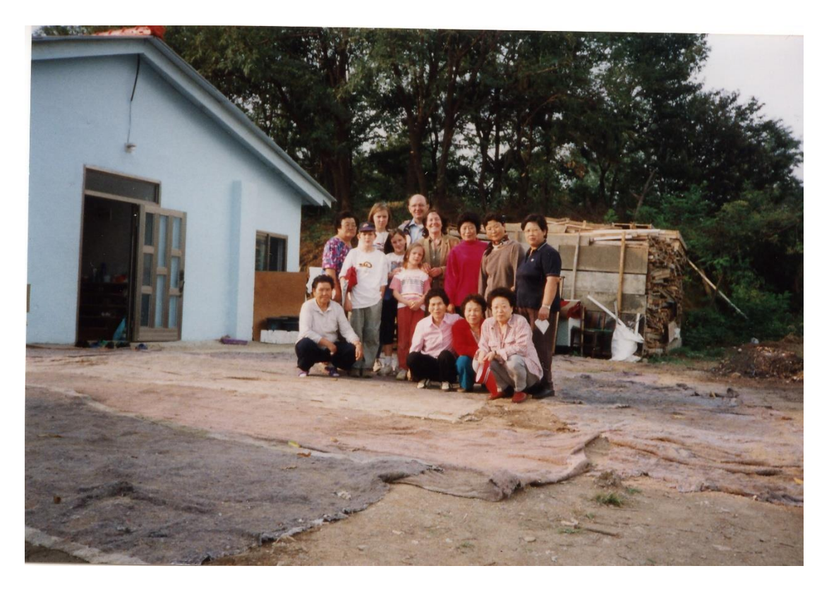
Dae Dok Dong Church