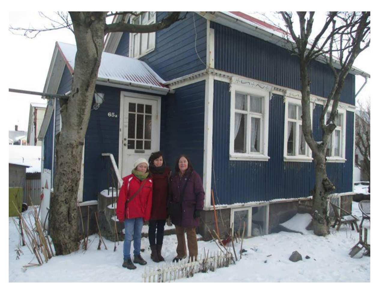
A visit to Hverfisgata 65A, Iceland in 2013. Childhood memories for our youngest daughters