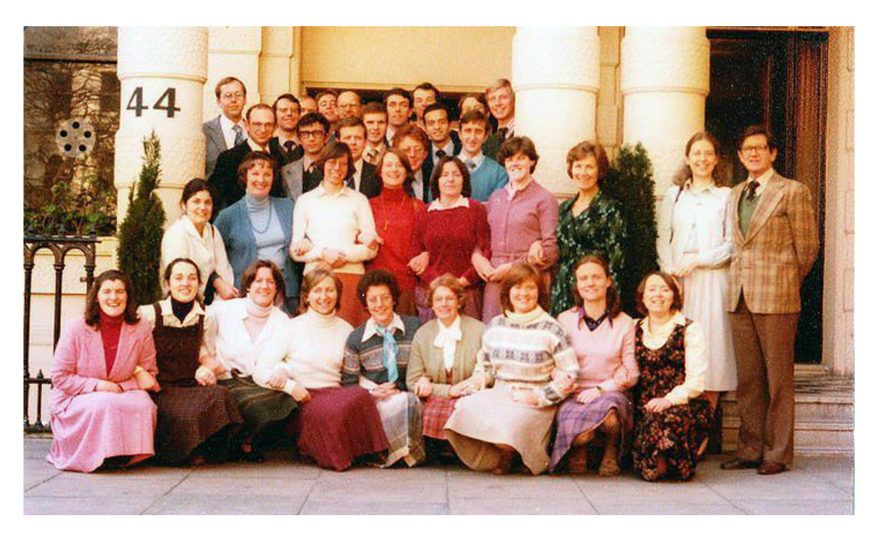
A meeting at Lancaster Gate, British Headquarters