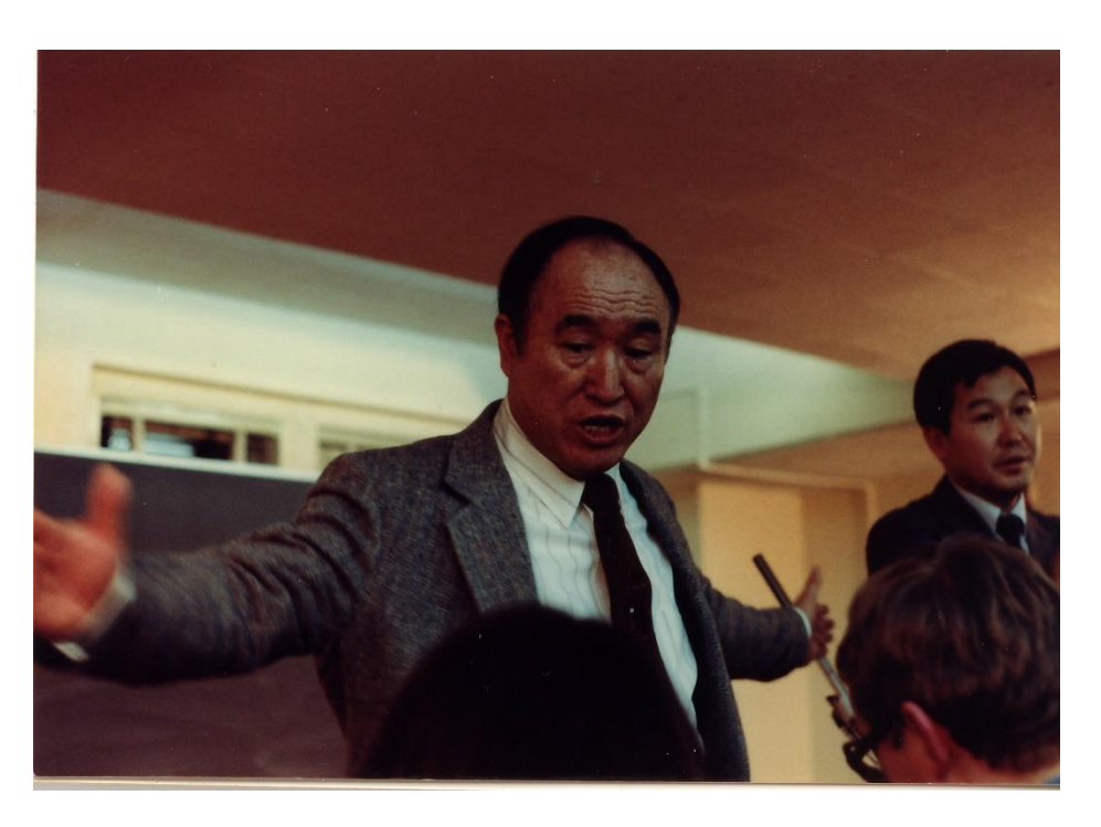
Father giving a serious talk to the leaders in New York in 1981