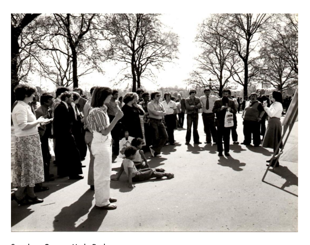
Speakers Corner, Hyde Park