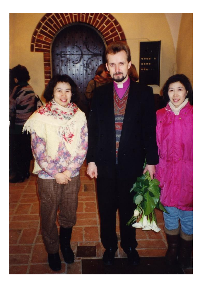
Japanese sisters visit the Dome Cathedral, Riga