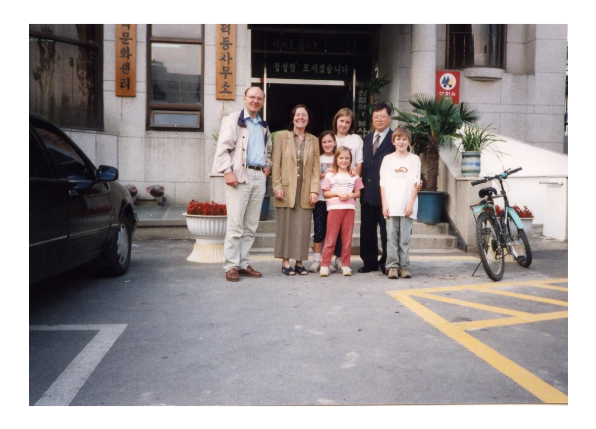
Dae Dok Dong Office