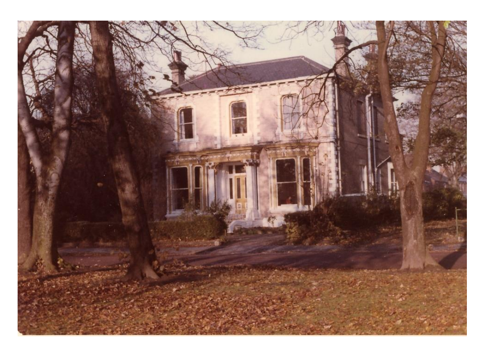
Hull Centre in Pearson Park