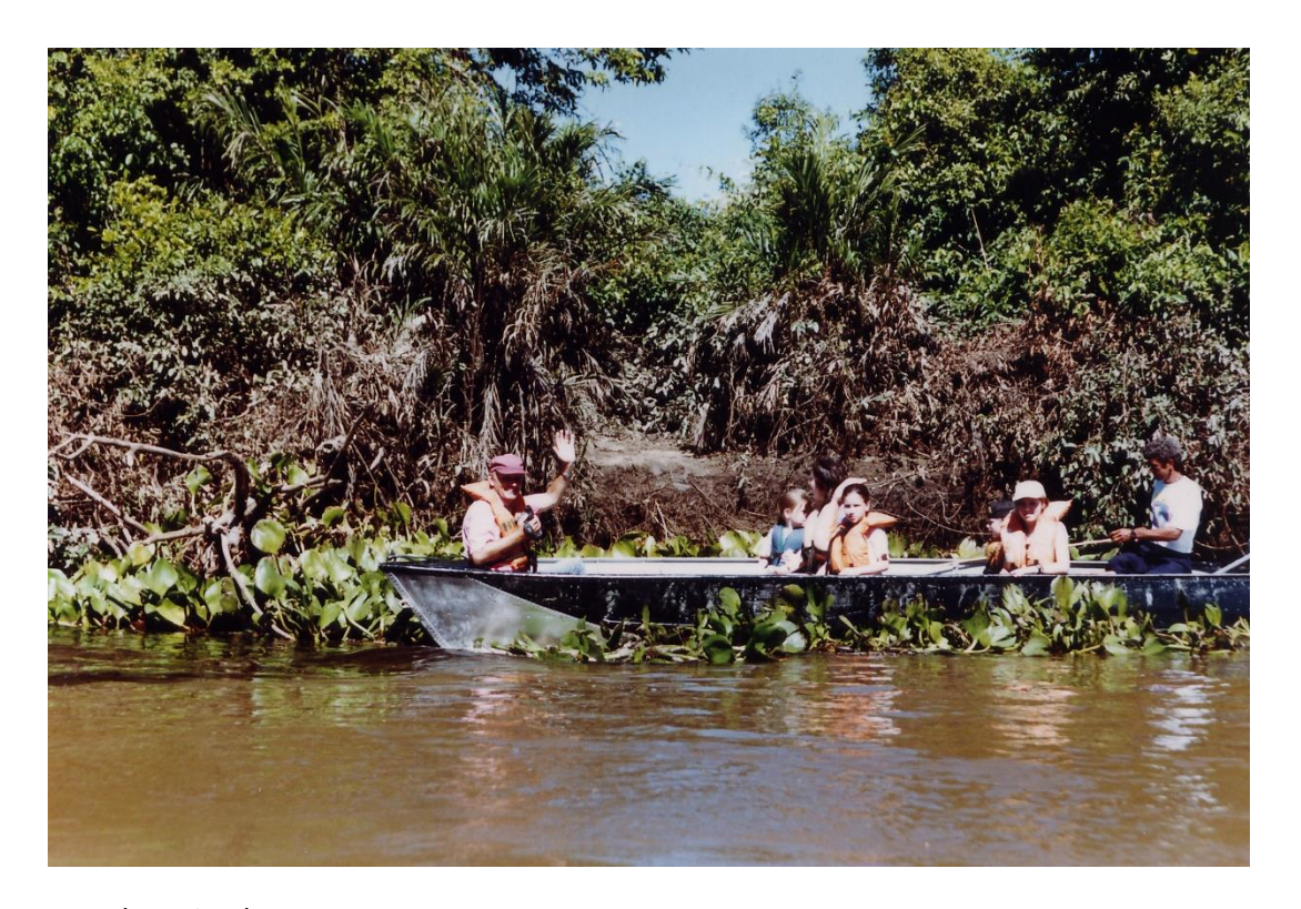
I caught a piranha