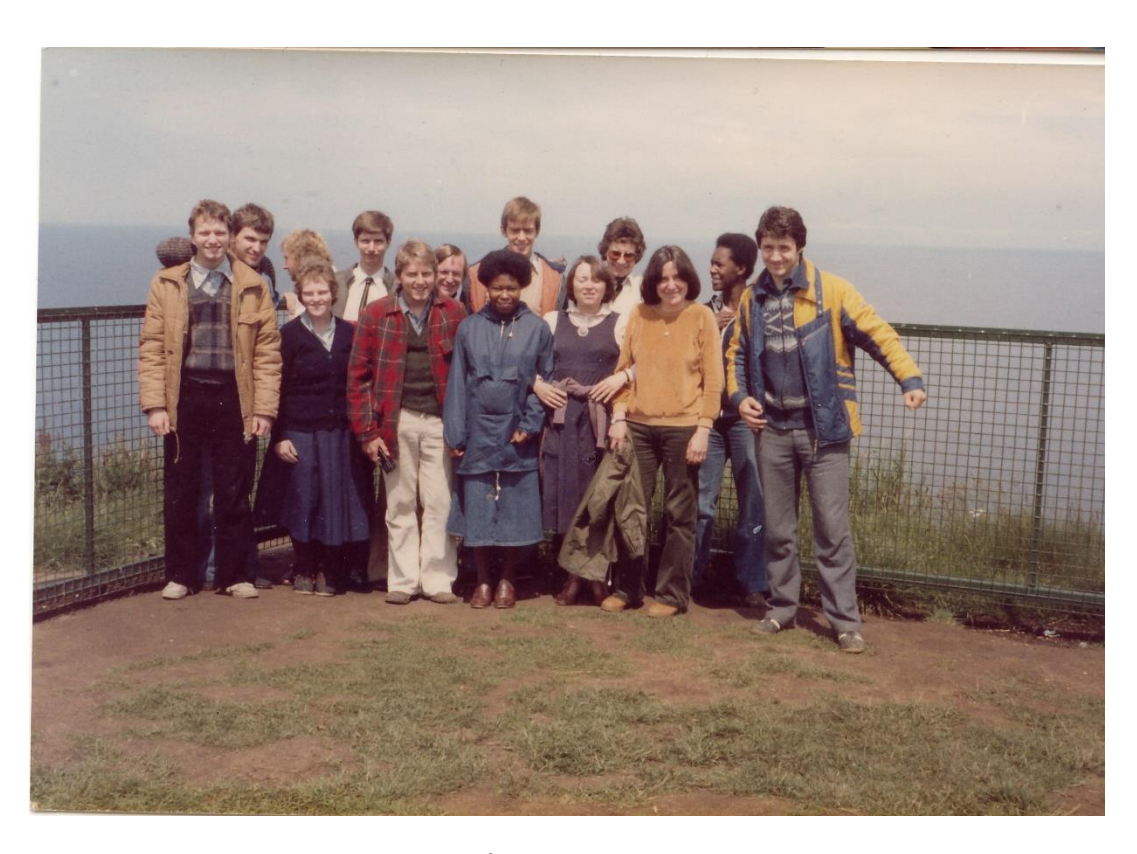
40 Day pioneering in Bridlington. A visit from the Hull New Hope team