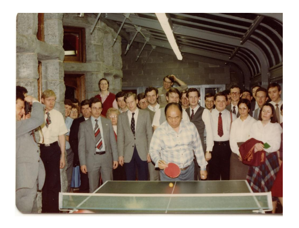
Father playing table tennis with the European and American leaders