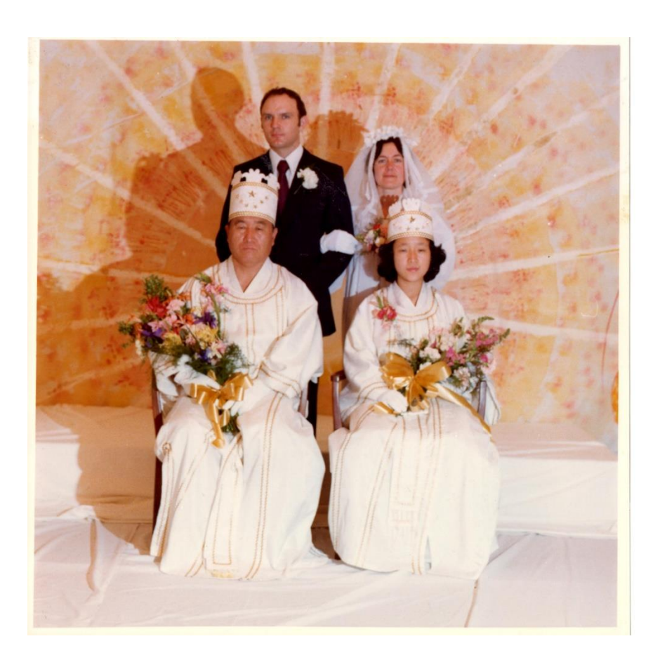
The Blessing of 118 Couples took place in Lancaster Gate, London on 21 May 1978. True Parents' eldest daughter represented Mother, who was in the late stage of pregnancy in America.