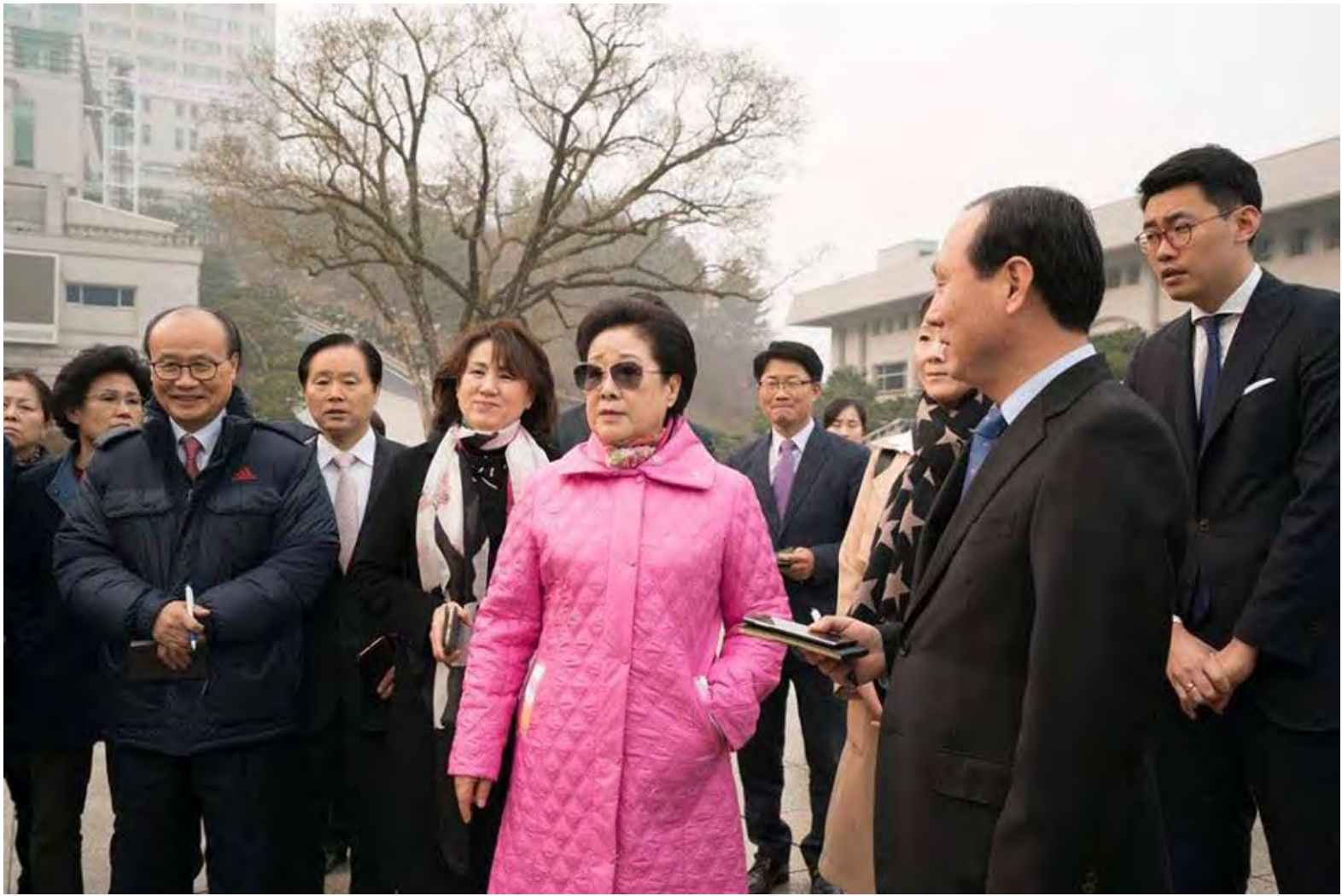
51. True Parents mentioned building the Cheong Il Guk Genealogy Center at the Tree of Love plaza, March 27, 2017.