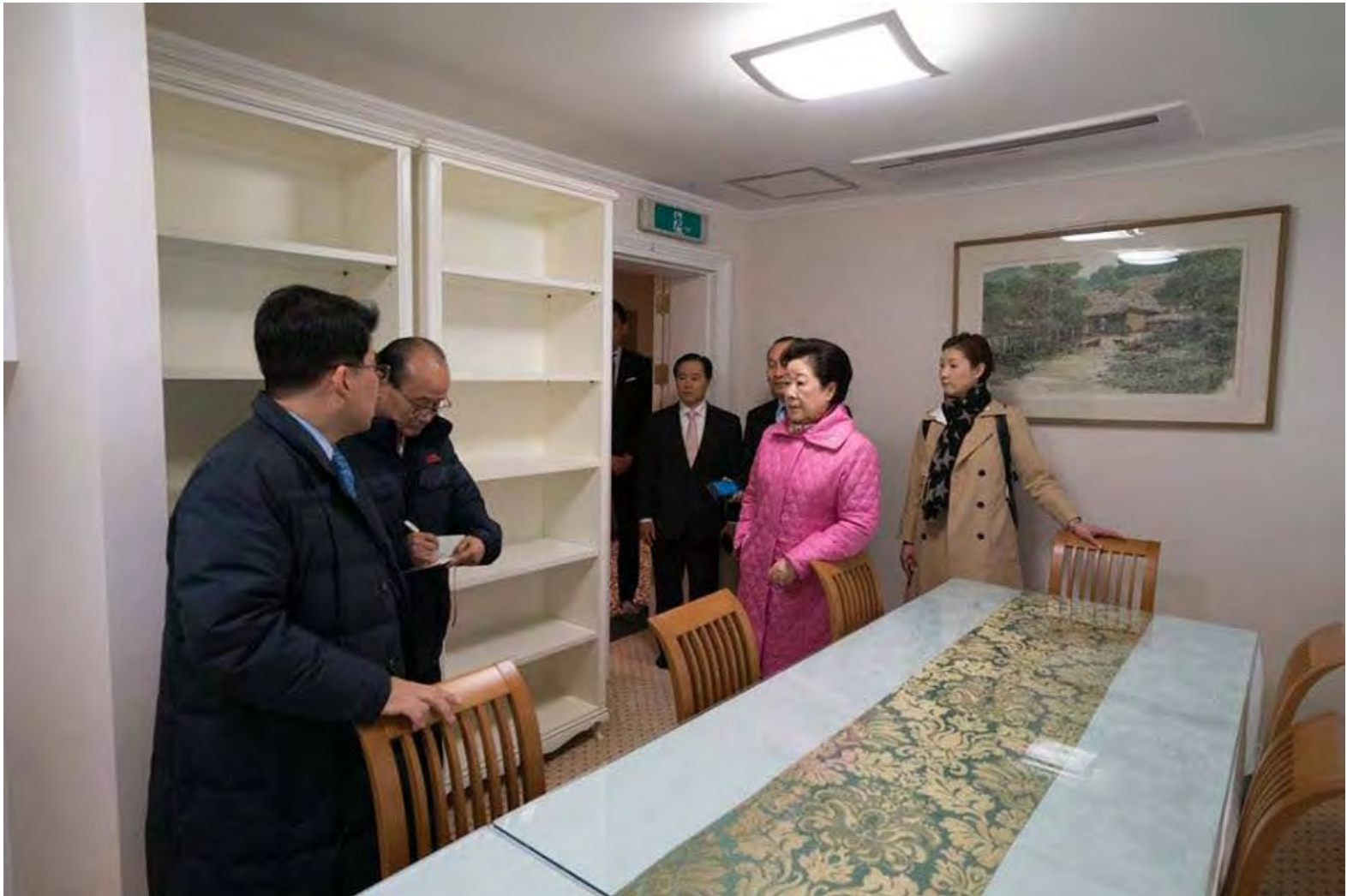
52. True Parents told them to remodel the third floor as an educational facilities for VIPs, March 27, 2017.