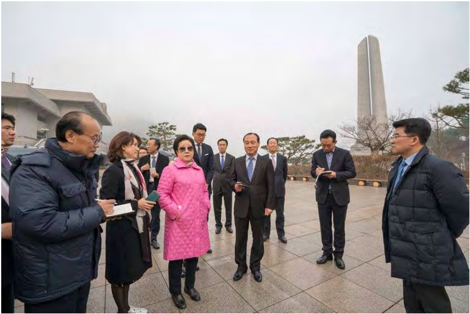
49. True Parents mentioned building the Cheong Il Guk Genealogy Center at the Tree of Love plaza, March 27, 2017.