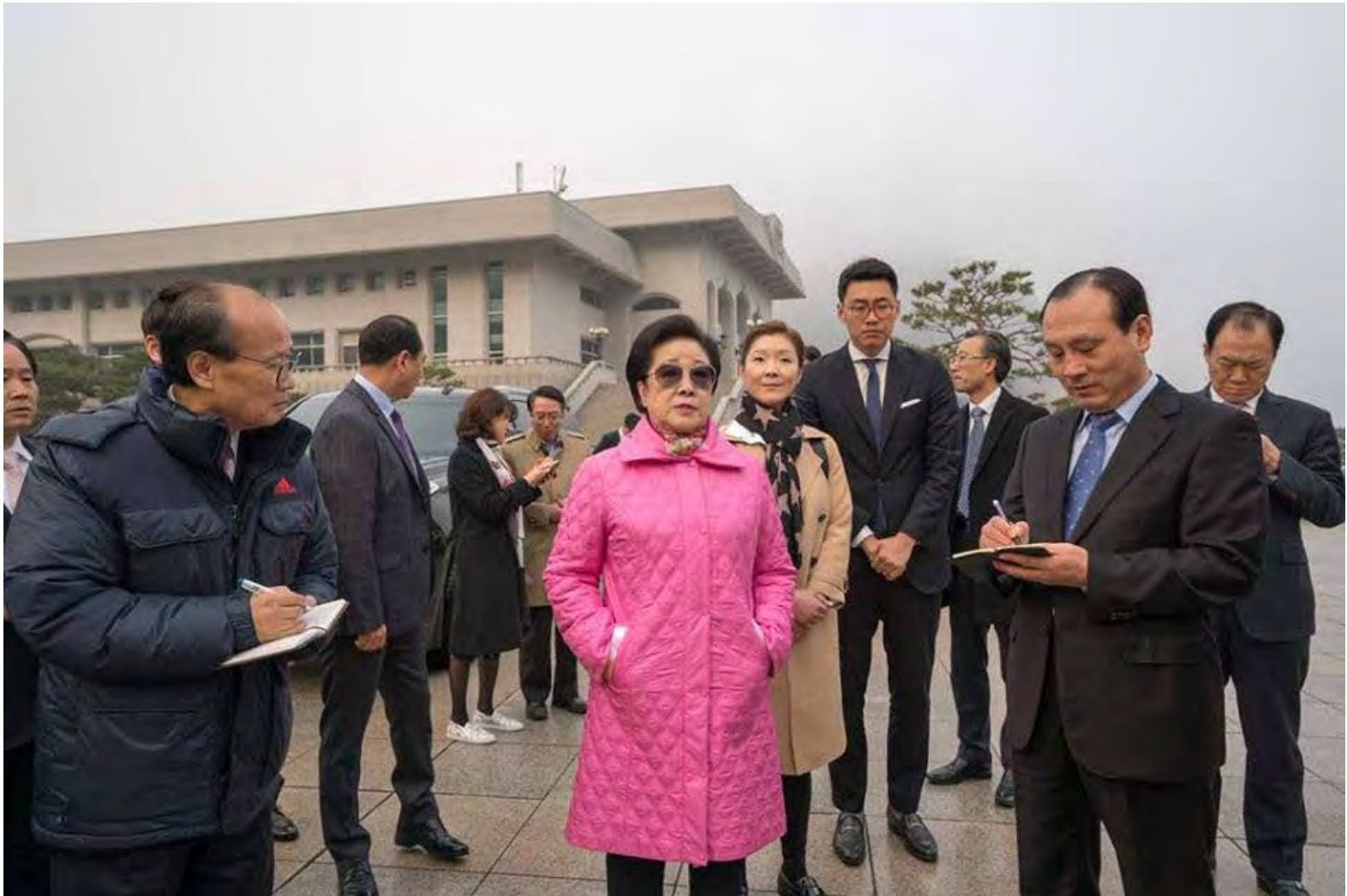
48. True Parents mentioned building the Cheong Il Guk Genealogy Center at the Tree of Love plaza, March 27, 2017.