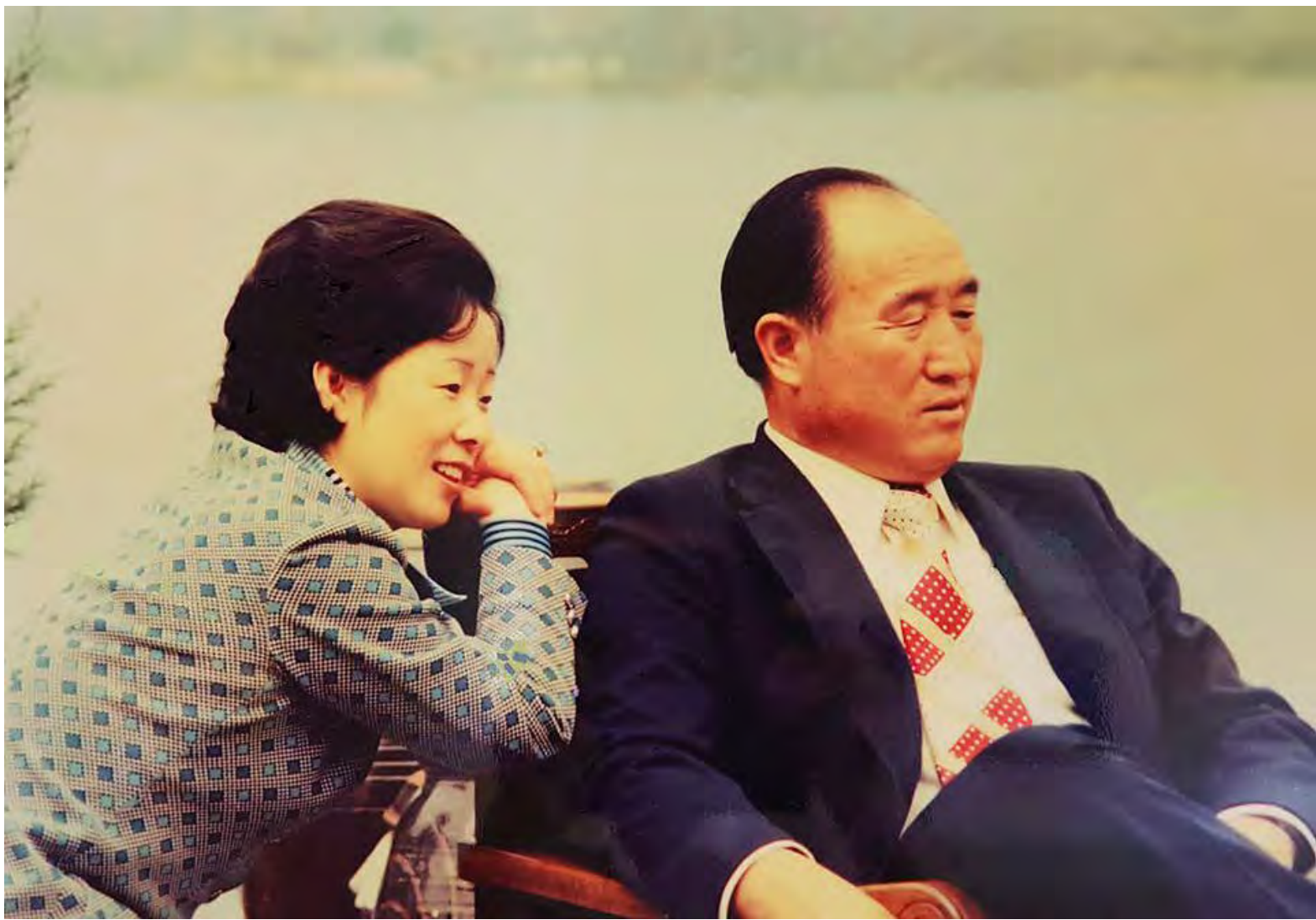
8. True Parents affectionately overlooking Cheonshim Lake from the Original Sanctuary.