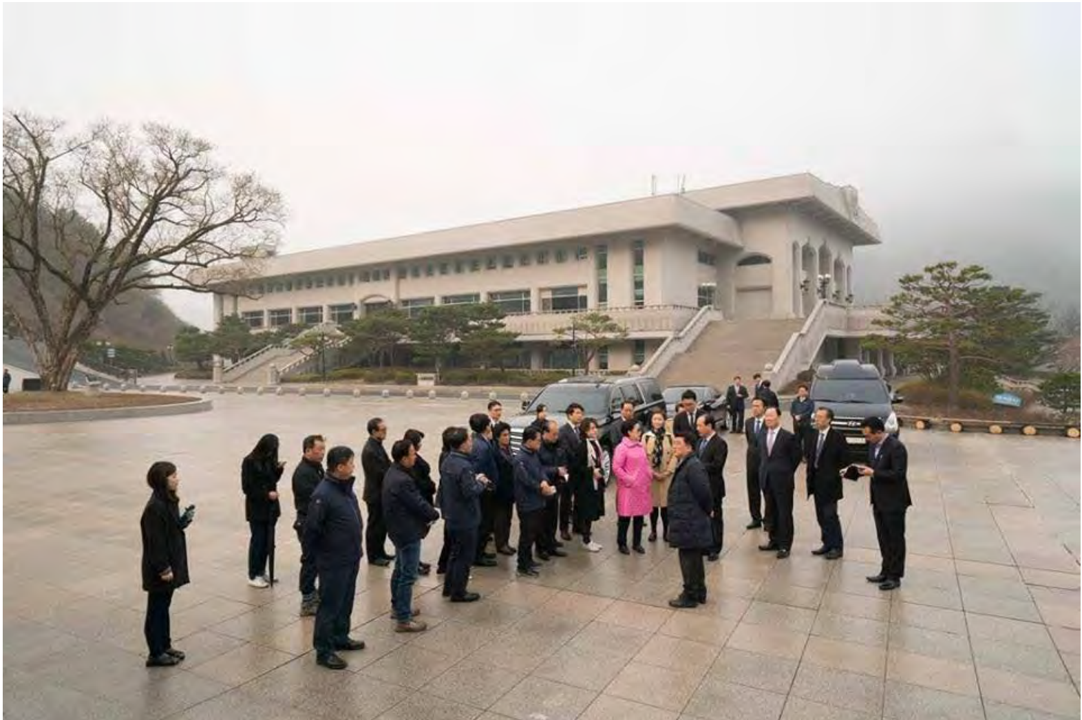
50. True Parents mentioned building the Cheong Il Guk Genealogy Center at the Tree of Love plaza, March 27, 2017.