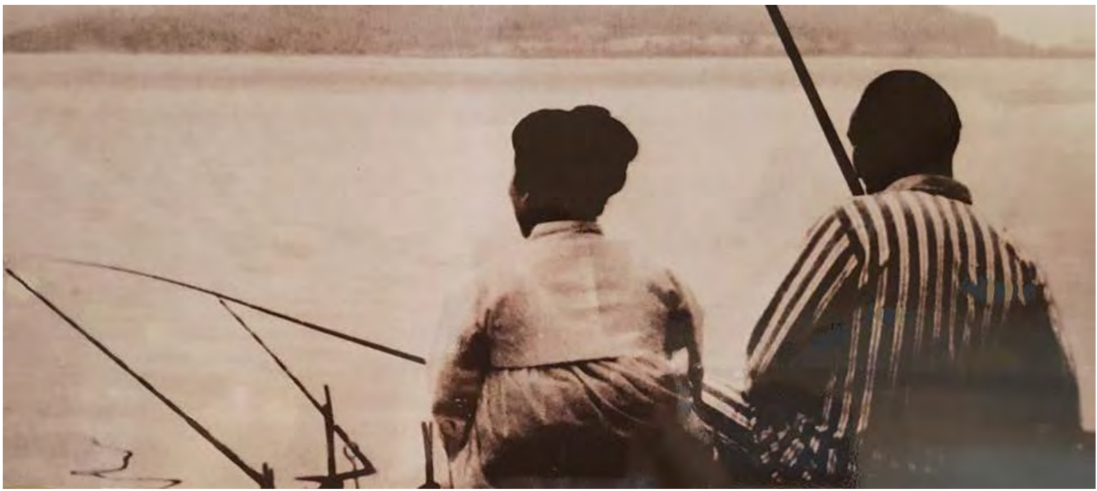
6. True Parents offering fishing conditions on Cheonshim Lake.