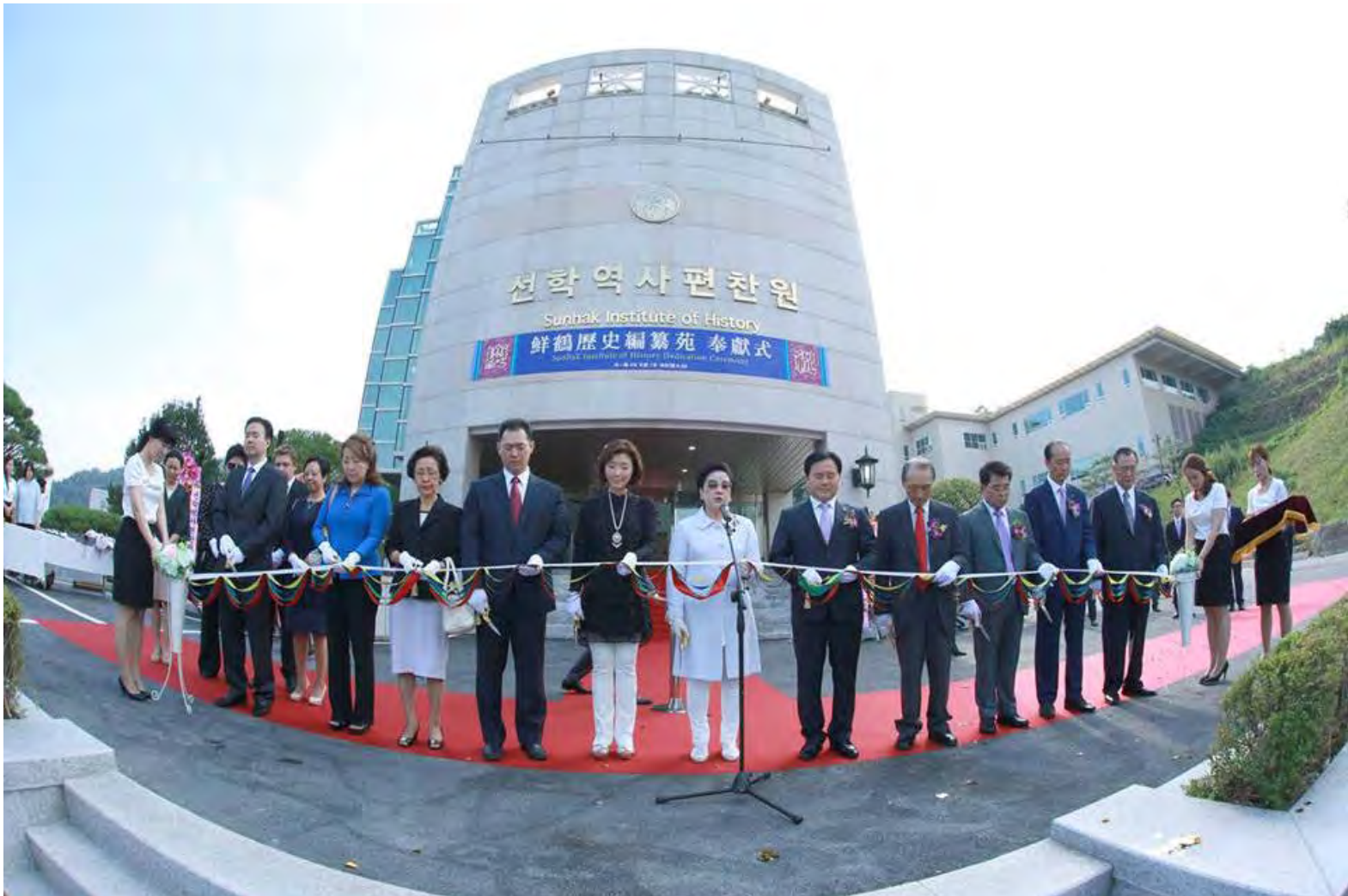
24. Opening Ceremony for the Sunhak Institute of History August 20, 2016 Cheongpyeong