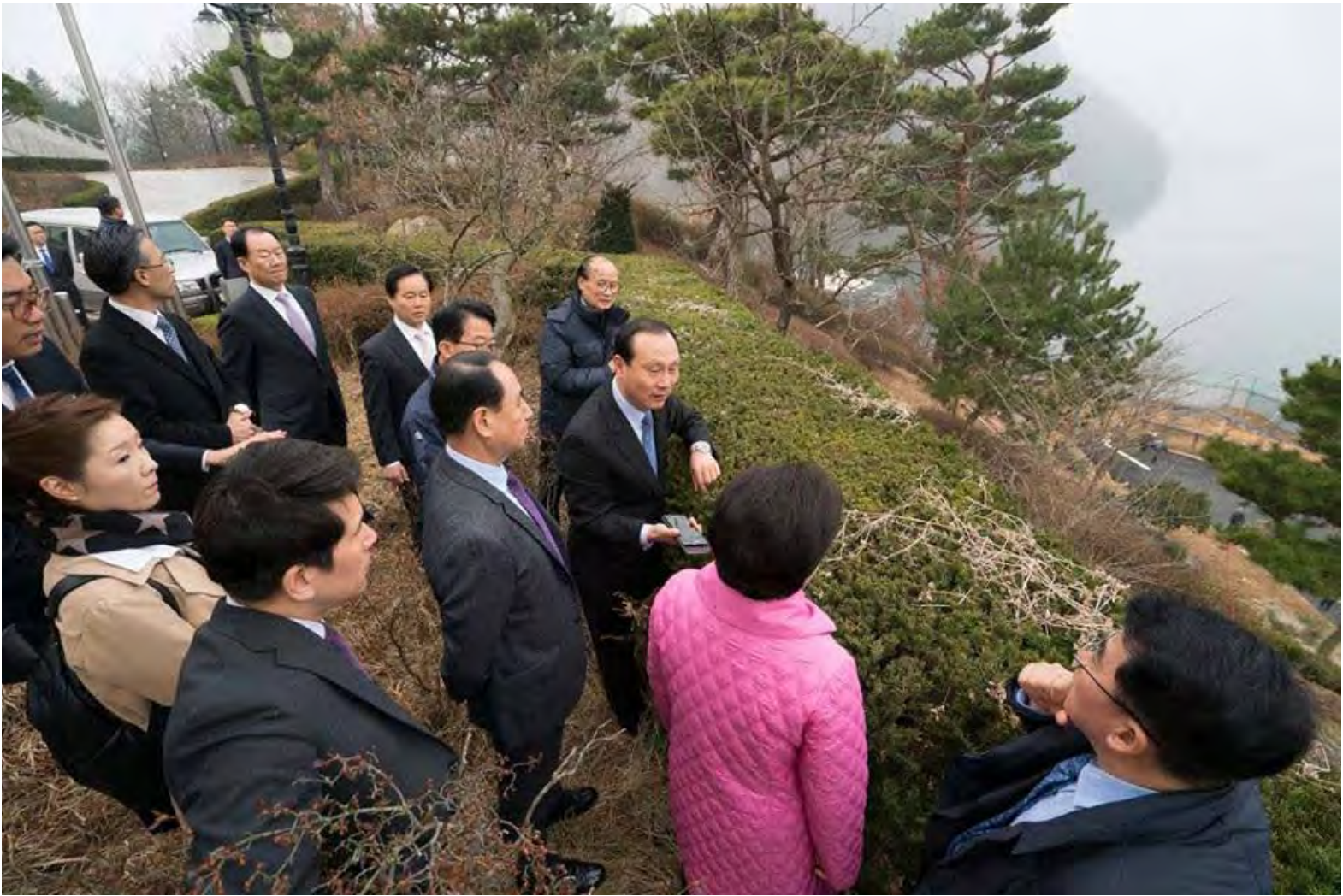
54. True Parenst told them to remodel the third floor as am educational facilities for VIPs, March 27, 2017.