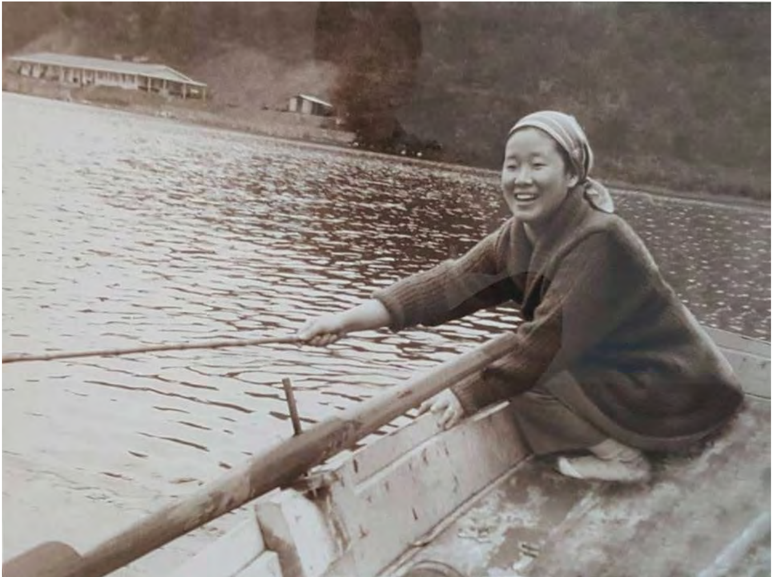
7. True Mother crossing the lake on a boat and visiting Shinseonbong. Before this place became flooded due to the dam construction, it was a famous market which villagers often walked.