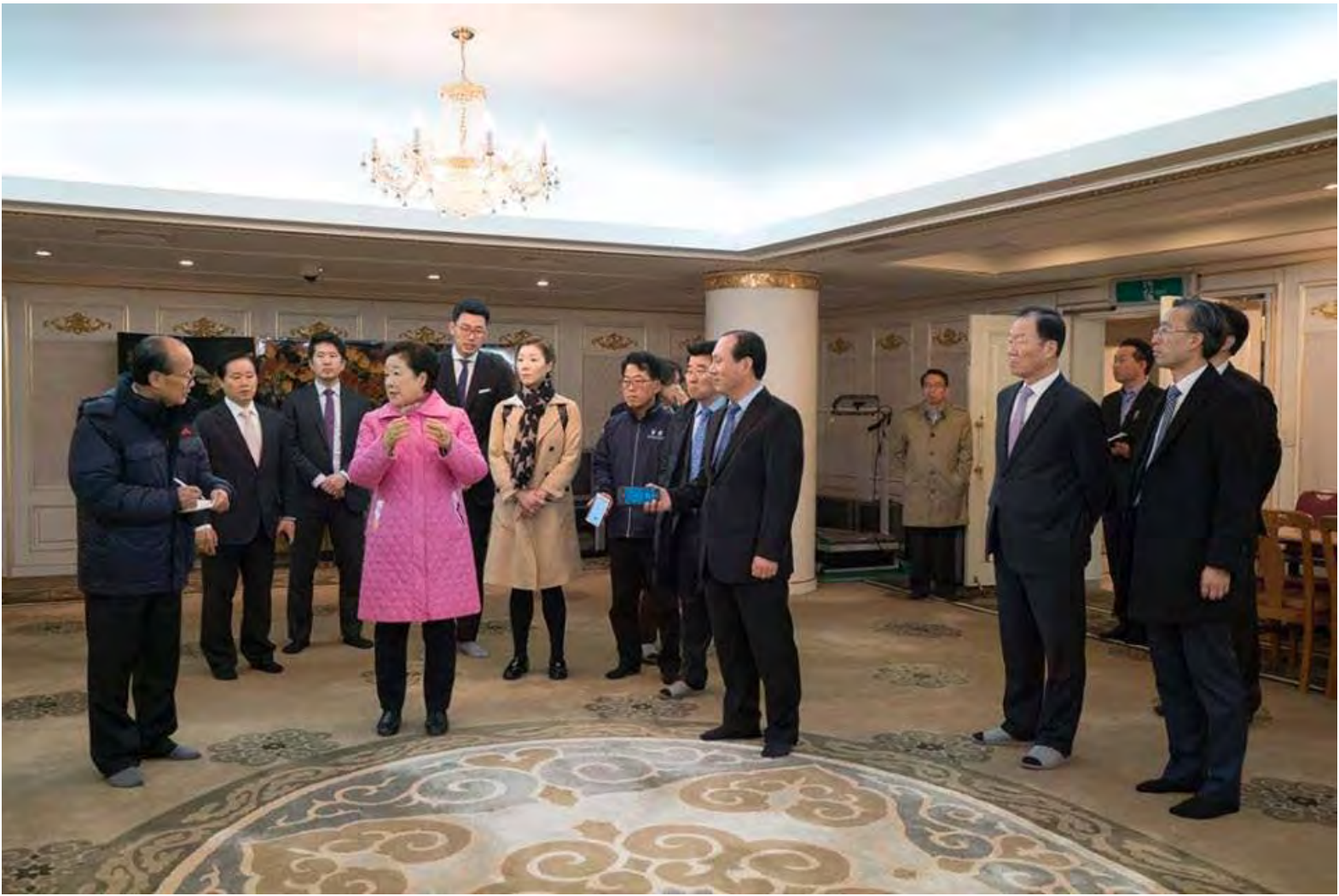
53. True Parenst told them to remodel the third floor as am educational facilities for VIPs, March 27, 2017.