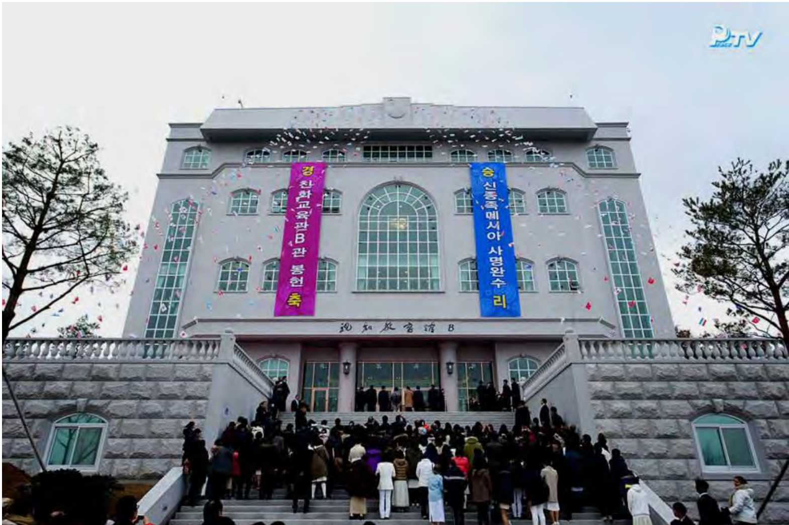
23. Offering Ceremony for Chinhwa-gwan in Cheong Pyeong Heaven and Earth Training Center February 18, 12.31 in the second year of Cheon II Guk by heavenly calendar, Cheong Pyeong Heaven and Earth Training Center — at 천주청평수련원.