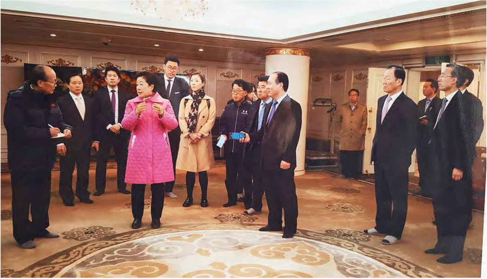
39. True Parents told them to remodel the third floor as an educational facilities for VIPs, March 27, 2017.