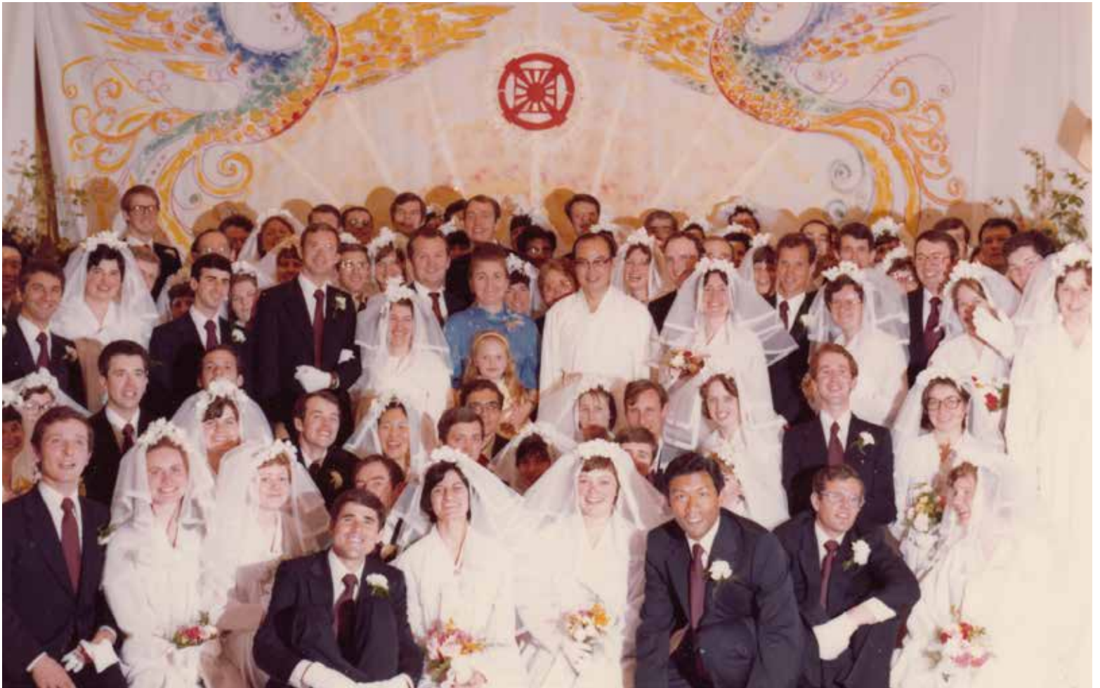
Top: The 118 couples, Blessed on May 21, 1978.