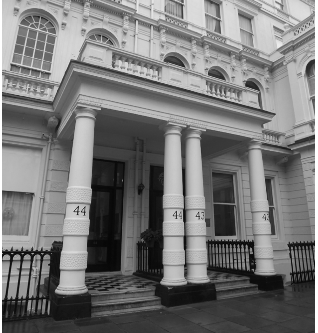
Top: The new national Headquarters, 43/44 Lancaster Gate, in central London.