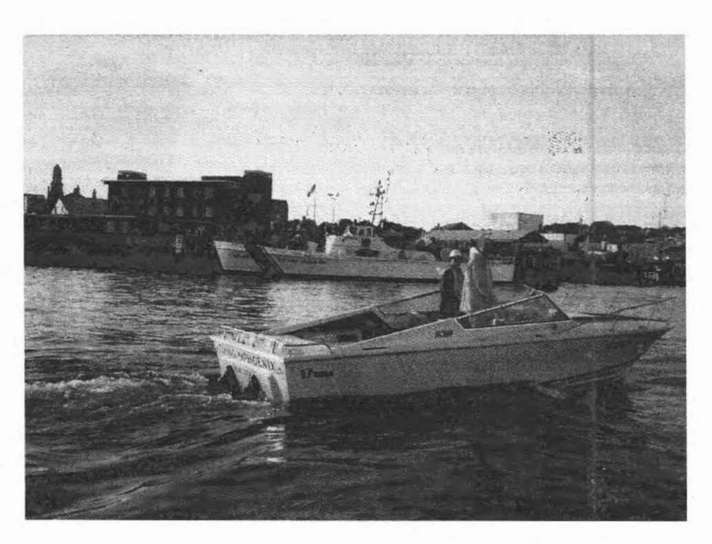
Flying Phoenix entering Gloucester Harbor