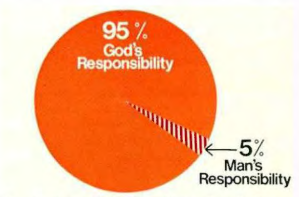
Man's Part of the Total Responsibility for the Fulfillment of God's Will