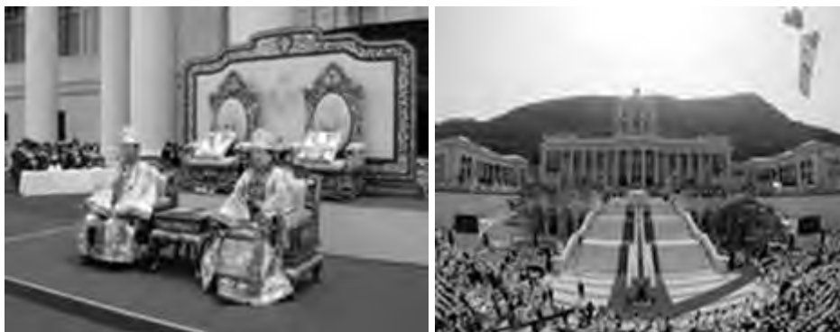
Entrance Ceremony to the Cheon Jeong Gung Palace, June 6, 2005. Note the four thrones; the two larger ones in the back are the thrones of God as Heavenly Father and Heavenly Mother.

These coronations led up to the Entrance Ceremony for the Cheon Jeong Gung Palace on June 6, 2005, where Rev. and Mrs. Moon, wearing crowns and carrying a royal scepter, declared the basic laws of the Cheon Il Guk nation and presided over the establishment of the national flag, flower, anthem, and other accoutrements of state. As Solomon's Temple signified the permanence of the Davidic kingdom in Israel, this palace high on a mountain overlooking Cheong Pyeong Lake signified the establishment of Cheon Il Guk on solid ground.