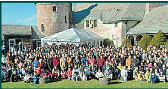
True God's Day Celebrations • p. 8