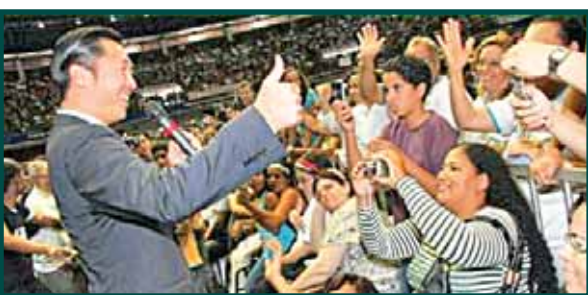
Global Peace Festivals • p. 12-17