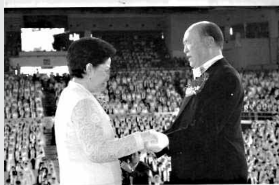
2nd Generation Blessing Preparation Guide Book