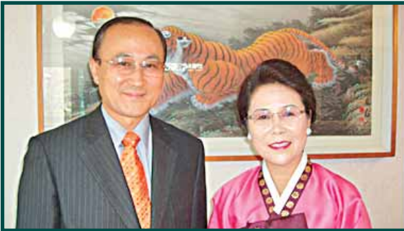
New Year Message • p. 5