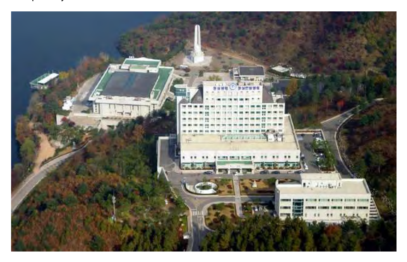
On November 7, 1999, True Parents presided over a dedication ceremony and commemoration service for the Cheonseong Wanglim Palace at Chung Pyung Heaven and Earth Training Center in Korea.

Sun Myung Moon November 7, 1999 Chung Pyung Heaven and Earth Training Center of the four seasons Compiled by Taekon Lee