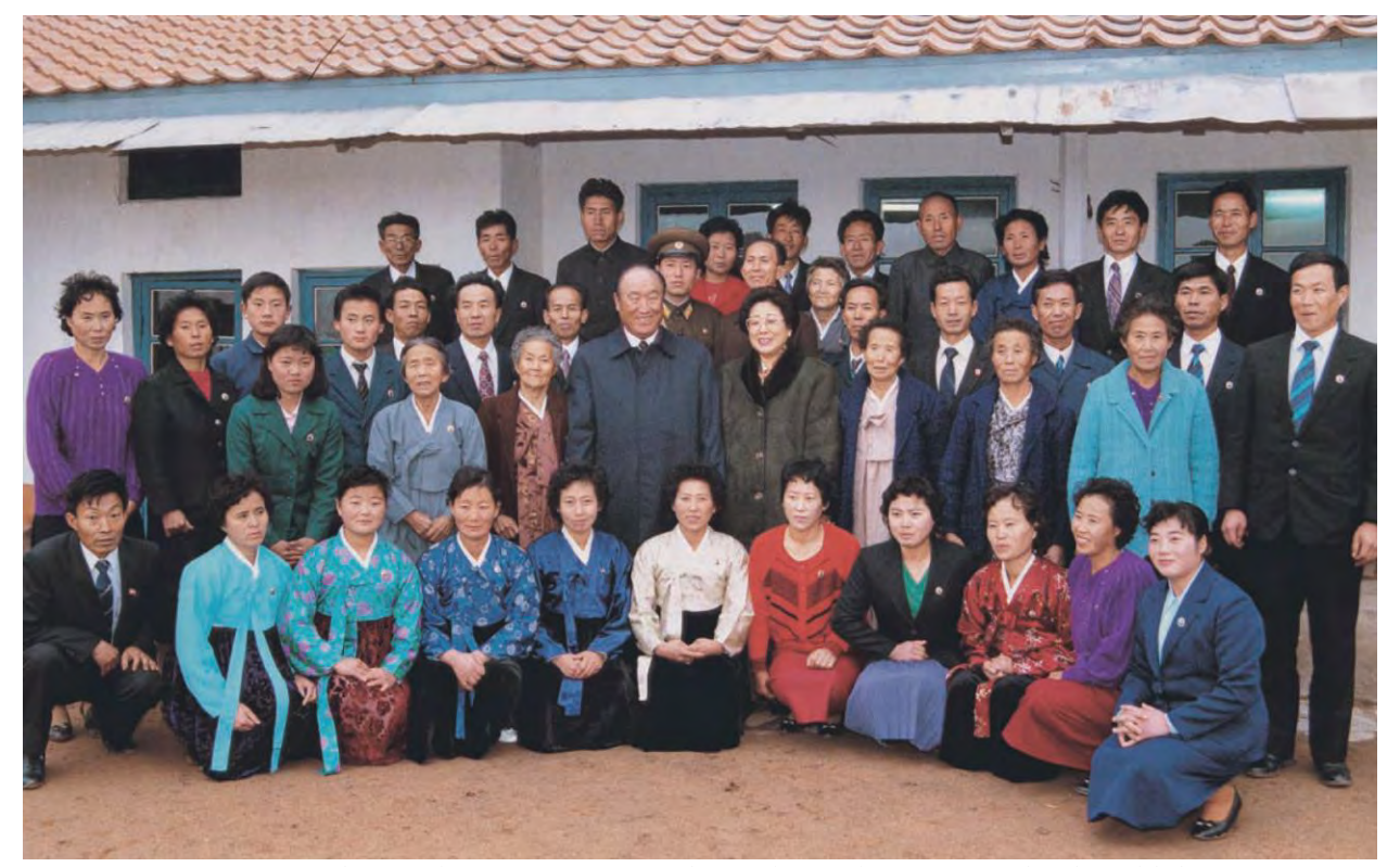
True Parents among Father's relatives in 1991; Father's close relatives wept, but he told them, "Don't cry. I did not come for tears, I came for God's mission. We have much greater things to do."

After receiving an official invitation from the North Korean government, True Parents arrived in North Korea on November 30, 1991. This was True Fathers first visit to North Korea after an absence of 40 years and 11 months. He met his surviving relatives at his hometown of Jeongju on December 5. Father said that his birthplace will be a holy ground to which people of the world will make pilgrimages. His visit to North Korea greatly interested both local and foreign mass media. At the farewell ceremony held at the guesthouse in Seojaegol, Pyongyang, on December 6, Father emphasized that true love is the driving force behind unification, as he explained that "love is thicker than blood."