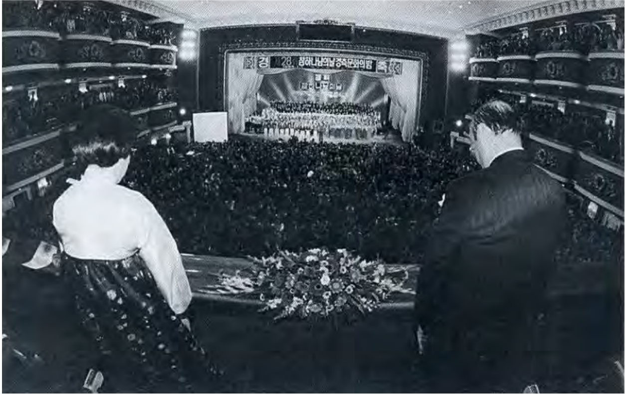
Father and Mother greet the audience at the True God's Day entertainment program in the Little Angels School in Seoul, Korea, on January 1, 1995.

evil and it seeks to pull down good people.