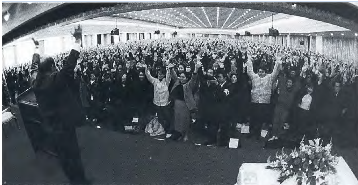
Father and the congregation shout "Mansei!" at the close of the morning speech in the Sutaek-ri Training Center.

I ask all these things in the name of True Parents. Amen, Amen, Amen.