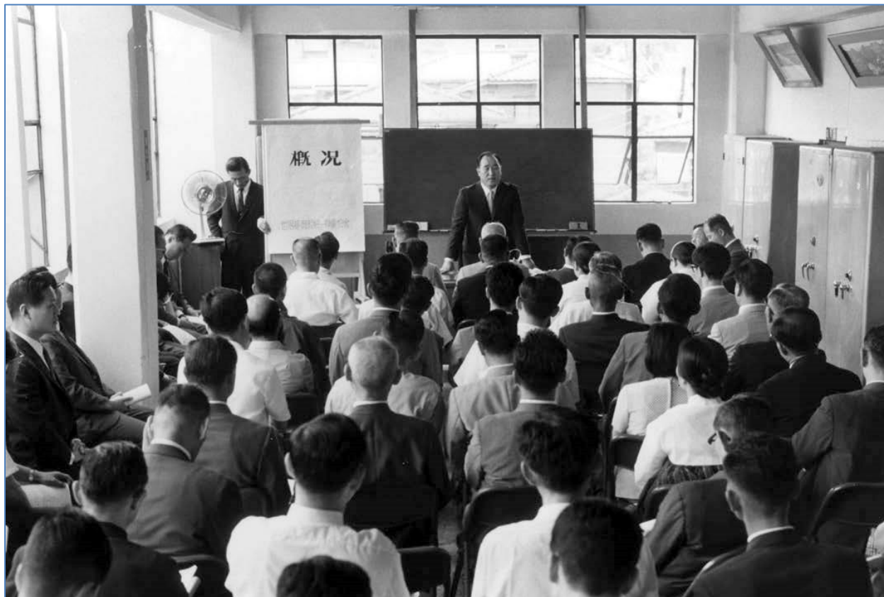
July 15, 1970 - Unification Church Headquarters in Seoul to members of the Association of Religions in Korea

Unification Church Headquarters in Seoul to members of the Association of Religions in Korea