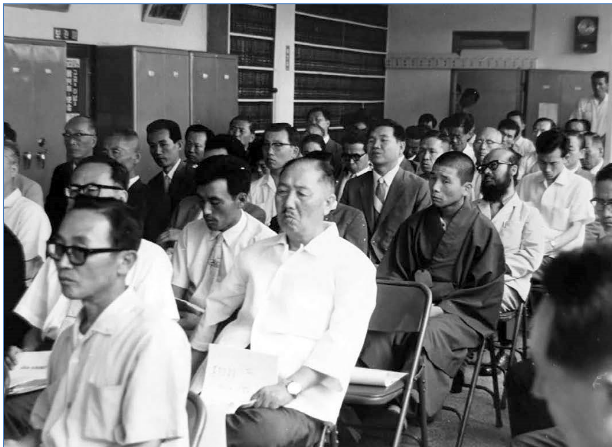
July 15, 1970 - Unification Church Headquarters in Seoul to members of the Association of Religions in Korea

So the saints established the standard for binding the human way to the foundation of heavenly law. However, only teachings that transcend the boundaries of the world can be called the teachings of the saints. Based on these ways, human beings today have established the way of humility and morality.