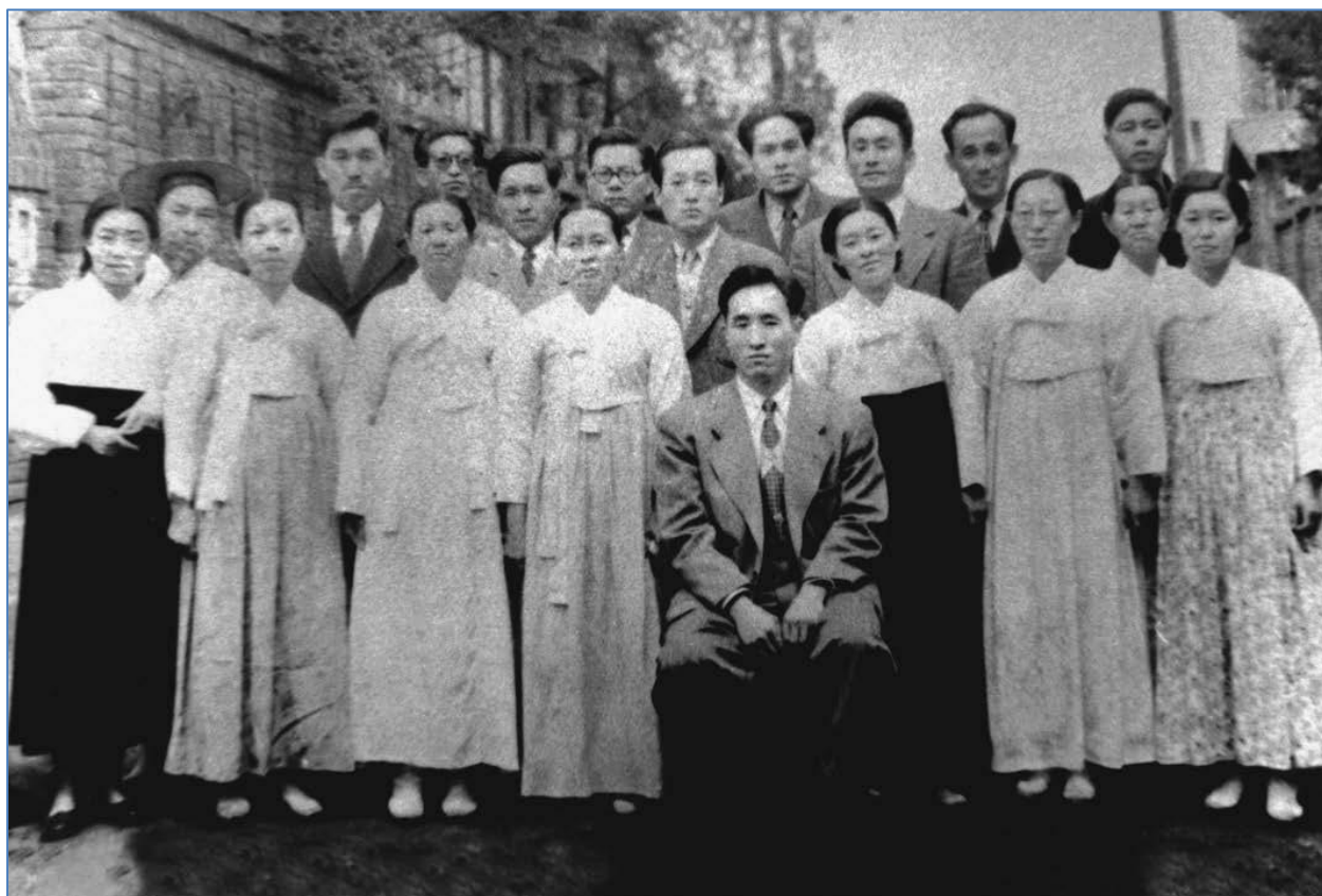
True Father with early members on May 1, 1954, the day of the Founding of the Holy Spirit Association for the Unification of World Christianity.

The world of love that God is hoping for cannot be realized without absolutely achieving this standard of love. The world of love, the final goal, must be established through individuals whom God can love, through the family composed of such individuals, through the tribe composed of such families, through the society composed of such tribes, and through the nation composed of such societies. Without having that kind of loving foundation as a base, the world cannot be bound together in love. This surely has to happen in the course of history.