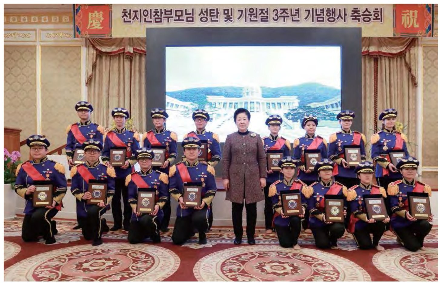
True Mother presenting plaques marking the graduation of Universal Peace Academy students who have completed their one-year internships as missionaries abroad

is not historic. Yet you must look far. This is not yet True Parents' nation. When you need to look far and advance, you should not be trying to figure out the right and wrong of small things.