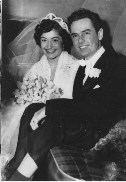
My parents on their wedding day.