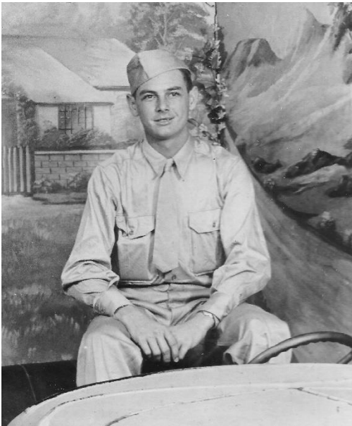
My father in the US Army.