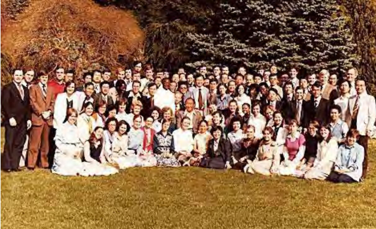
The 40-Day International Missionary Workshop attendees. I am in the front row, fifth from the right, in a beige skirt suit. Father is in the middle.