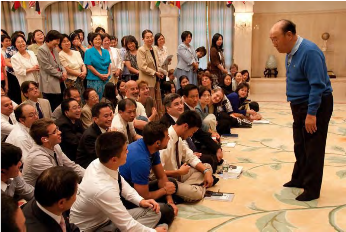
Father speaking at East Garden. I am in the royal blue shirt in the front row, sticking my head out, trying to see who Father was talking to. He wanted to know why the second-generation brother had a beard.