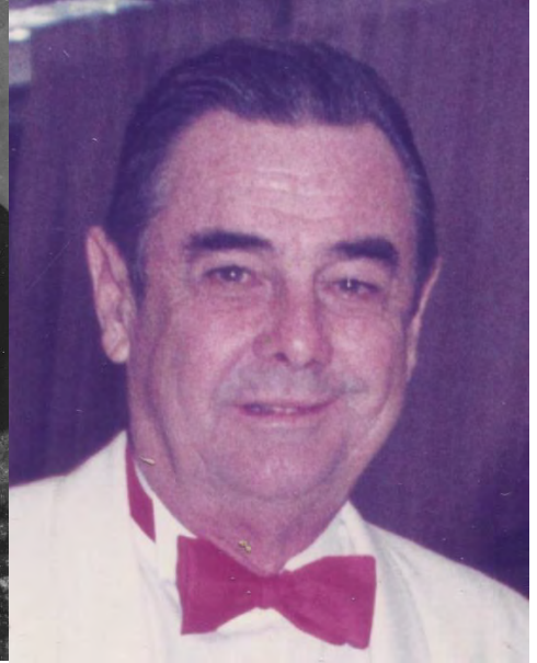
My father later in life.