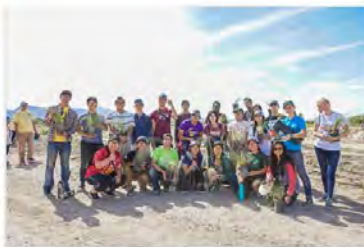
October 13, 2018 @ Las Vegas Wash with Generation Peace Academy