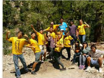
August 15, 2014 @ Mt. Charleston