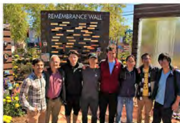
March 9, 2019 @ Las Vegas Community Healing Garden