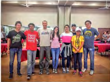
July 31, 2015 @ Las Vegas Rescue Mission