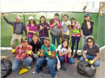
Our First Service Project (March 16, 2013 @ World's Largest Gift Shop)