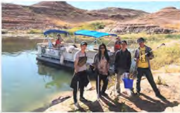
October 20, 2018 @ 33 Hole Overlook, Lake Mead