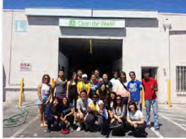
July 25, 2015 @ Clean the World