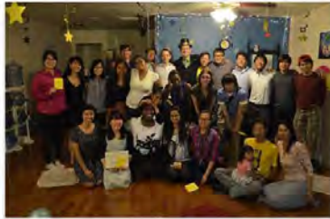
Shine City Project's 3rd Anniversary Celebration (March 18, 2016)