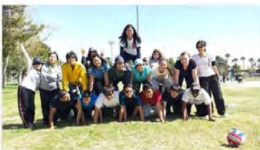
Shine City Project's 1st Anniversary (March 15, 2014 @ Sunset Park)