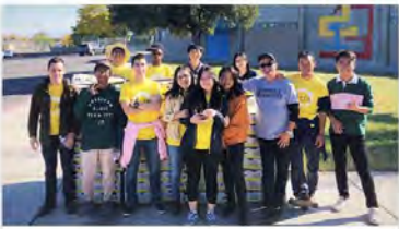
November 9, 2019 @ Just One Project - Helen Marie Smith Elementary School