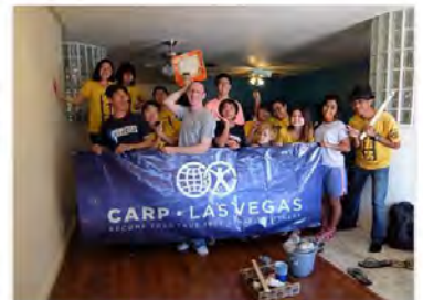
August 22, 2014 @ CARP Las Vegas House