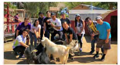
April 20, 2019 @ Gilcrease Nature Sanctuary