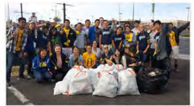
April 25, 2014 @ El Pollo Loco