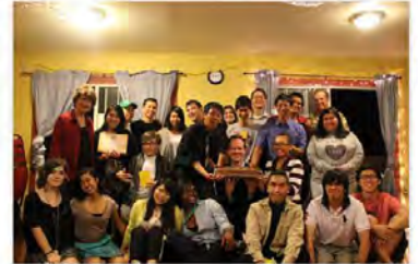
Shine City Project's 2nd Anniversary Celebration (March 14, 2015)