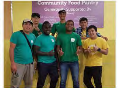
August 17, 2019 @ Catholic Charities of Southern Nevada with International Leadership Training Program (ILTP)