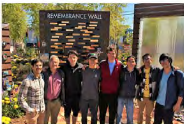
March 9, 2019 @ Las Vegas Community Healing Garden