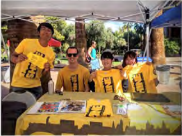
September 2, 2015 @ UNLV Involvement Fair