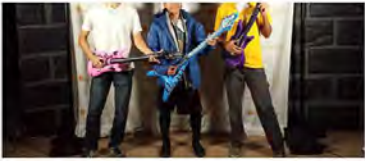
October 30, 2015 @ Haunted Harvest, Springs Preserve