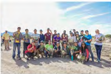
October 13, 2018 @ Las Vegas Wash with Generation Peace Academy