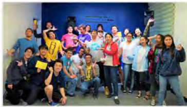
Shine City Project's 6th Anniversary Celebration (March 16, 2019 @ CARP Las Vegas Learning Center)