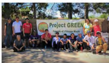
April 27, 2019 @ Pittman Wash