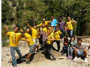
August 15, 2014 @ Mt. Charleston