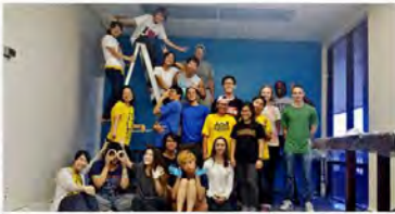
August 16, 2014 @ CARP Las Vegas Learning Center