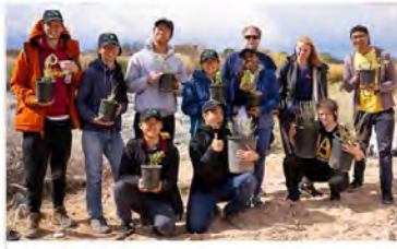
March 2, 2019 @ Las Vegas Wash