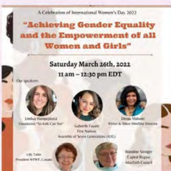
WFWP CANADA Celebrates IWD 2022 May 2, 2022

Women should be encouraged to play a leading role in transcending barriers of race, nationality, religion and cultures to facilitate global peace. "