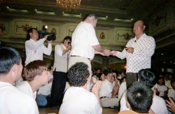
Me singing and then getting a 100,000 Won check from True Father