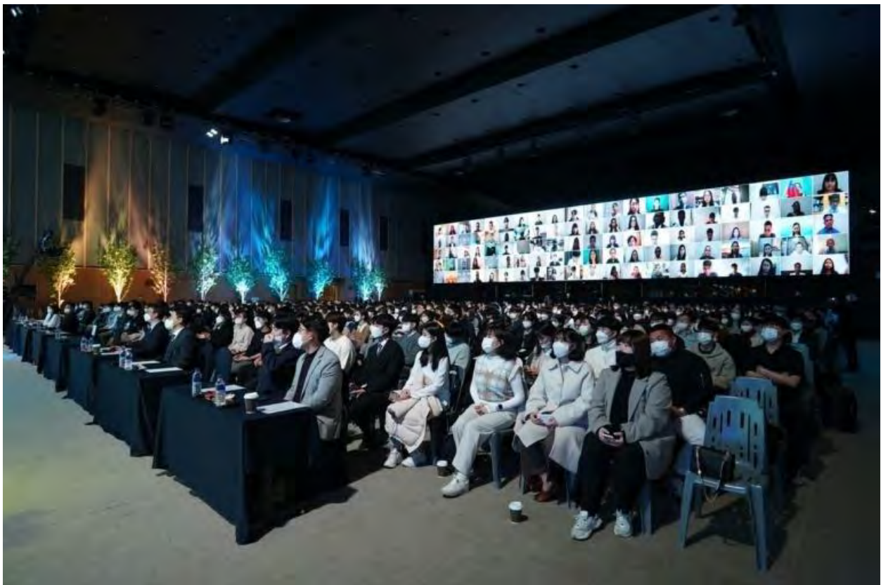
The presenters and judges seated in the front of the hybrid audience.

"[They] held S!NERGY International 2022 to support youth and students in voicing and sharing their solutions to contemporary issues in various aspects of society and focused on the theme, "Youth Action for Peace and Sustainable Development." S!NERGY International 2022 was held on November 27, 2022 in the Hyojeong Cultural Center, South Korea with 600 participants."